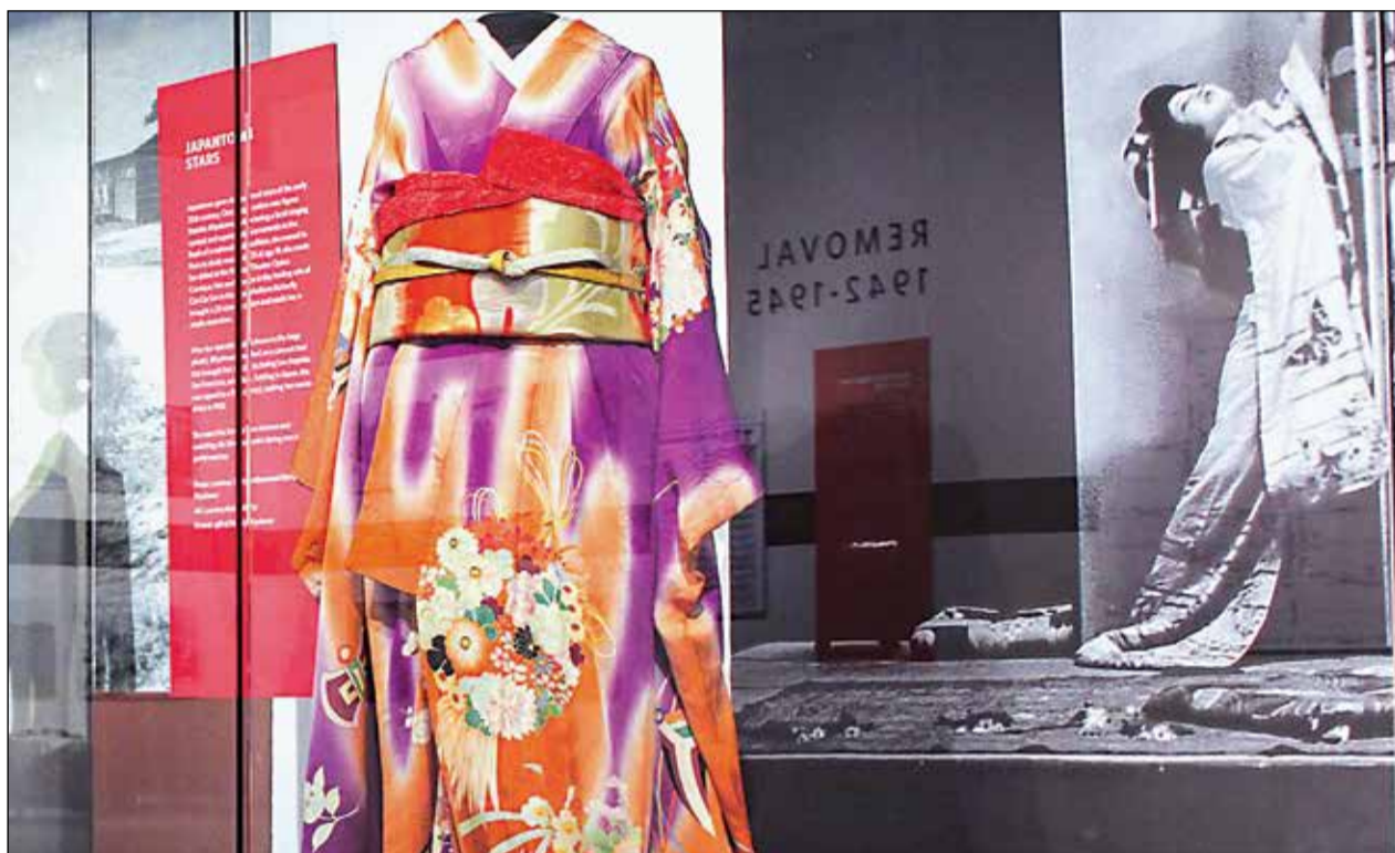
Pictured is the formal dance kimono worn by Japanese singer Agnes Yoshiko Miyakawa.