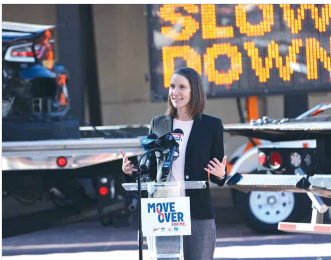
The change, authorized under Assembly Bill 390, legislation sponsored by AAA, comes during a nationwide spike in roadside deaths that safety leaders are calling a crisis.

"Too many Californians are losing their lives simply because passing drivers fail to slow down or move over," said CHP Commissioner Sean Duryee. "This expanded law makes clear that every person on the roadside, whether a driver or a passenger,