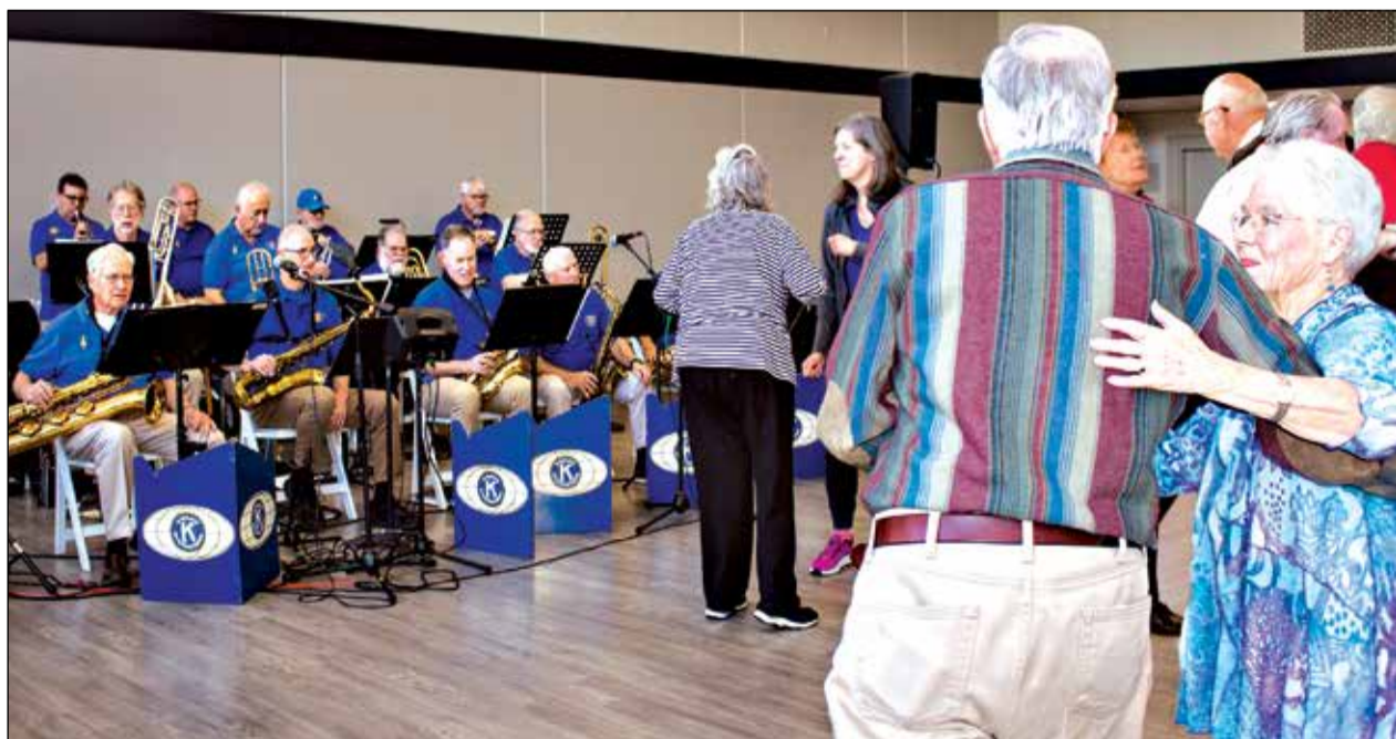
The Carmichael Kiwanis Club Big Band will play for a senior concert/dance at the La Sierra Community Center, Feb. 13.