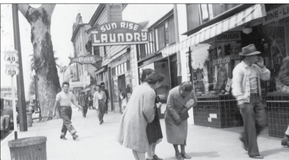
Japantown was once a thriving residential and business district, with businesses such as Sun Rise Laundry pictured.

Continued from page 1 caught in the American and Sacramento rivers.