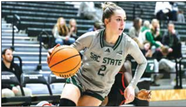
The Welland, Ontario, native opened last week with an 18-point night against Idaho, hitting four of her seven shots from distance in 39 minutes, grabbing four boards, dishing out three assists and swiping a pair of steals.

The Welland, Ontario, native opened last week with an 18-point night against Idaho, hitting four of her seven shots from distance in 39 minutes, grabbing four boards, dishing out three assists and swiping a pair of steals. Ten of her 18 points came in the first half as she