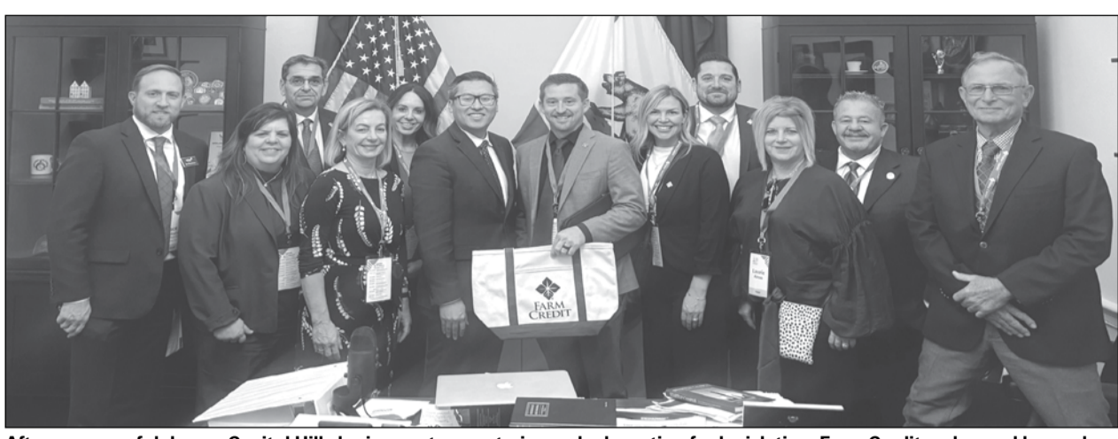
After a successful day on Capitol Hill sharing customer stories and advocating for legislation, Farm Credit welcomed lawmakers and staff to the Fly-In Marketplace Reception, which showcased Farm Credit customers and their products from across the country.

"We still need reauthorization of the Farm