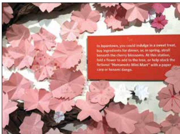
Museum visitors can interact with the exhibit by creating a paper cherry blossom to add to a cherry blossom tree.

"Kokoro: The Story of Sacramento's Lost Japantown" is now on display at the California Museum located at 1020 O St. in Sacramento, through March 29. The exhibit first appeared at the California Museum in 2017 and has remained one of the museum's "most beloved and impactful", according to the museum's website.