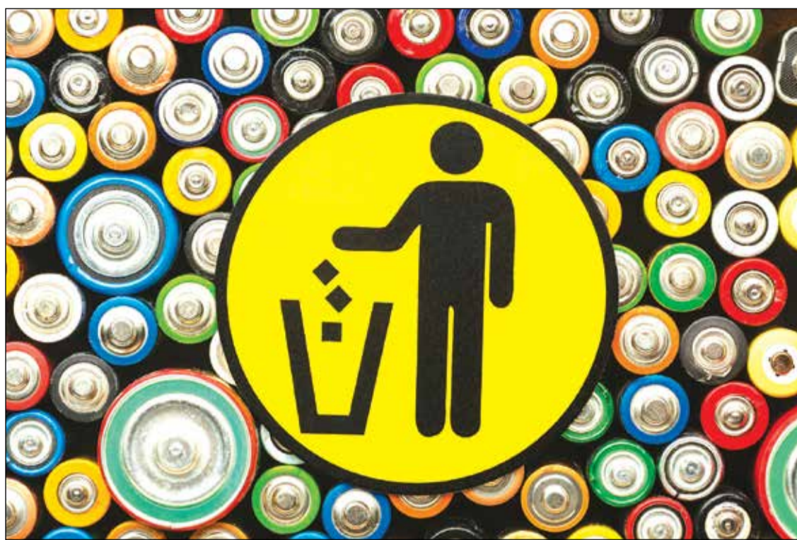
When batteries are crushed, punctured or exposed to metal or liquid during compaction, they can spark, explode or ignite.

Battery-related fires on collection routes put collection employees in immediate danger and can threaten nearby homes, businesses and roadways. Expensive collection trucks can be severely damaged or destroyed. Entire collection routes may be delayed or suspended while emergency crews respond.