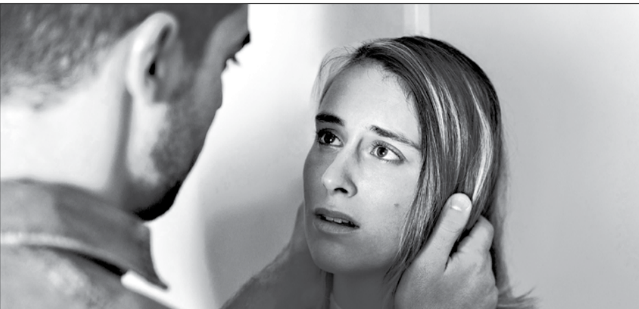
There are steps you can take to protect yourself. Trust your instincts — if you feel you are in danger or in an unhealthy relationship, it is important to end it.

Continued from page 1 mentioned above, or if they have physically harmed you in any way, there are steps you can take to protect yourself. Trust your instincts — if you feel you are in danger or in an unhealthy relationship, it is important to end it. If you are afraid to confront your partner or concerned about how they might react, there are many resources available for help, guidance and counseling. If you believe you are in an abusive relationship, you should consider reaching out to a trusted friend, teacher, parent, or mentor, spending more time with people you feel comfortable with, getting involved in activities you enjoy that connect you with positive influences, seeking guidance from a school counselor or therapist, or calling the National Domestic Violence Hotline at 800-799-SAFE (7233). Studies have found that negative or abusive behaviors in unhealthy relationships are more likely to increase over time. Abuse escalates as the relationship progresses and victims are more likely to sustain substantial injuries or harm. If you believe that you may be in an abusive or unhealthy relationship do not hesitate to ask for help. Teenage dating violence is more common than you know; you are not alone.