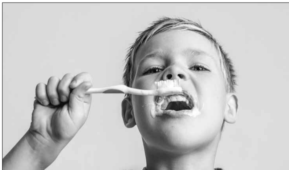
Nearly one in four California children aged 5 to 11 have untreated tooth decay, a rate higher than the national average, and it remains the most common chronic disease among children.