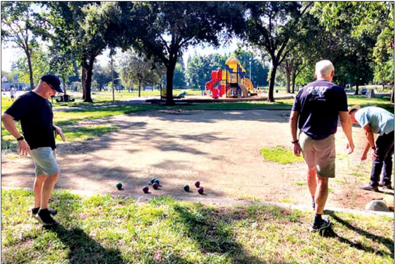
Cordova Recreation & Park District has supported the conversion of an abandoned pit into open play Bocce ball courts, with the project advancing toward a board item that could be placed on the July budget planning meeting for the 2026-27 fiscal year.