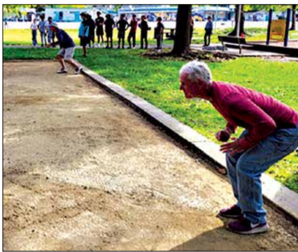
A group of Gold River residents have introduced bocce play on Wednesdays in addition to Thursdays at Gold River Park, drawing a crowd of Gold River Discovery School students.

Rediscovering the long-abandoned horseshoe pit in the Gold River Park adjacent to the Gold River Discovery School, it was imagined that the space could be repurposed to immediately support open