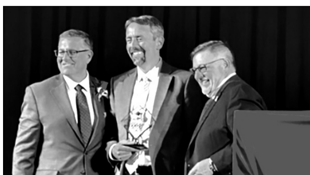
Sacramento County was awarded the Friend of Housing Award on Friday, Jan. 30, during the North State BIA Installation of Officers Dinner.

The recognition reflects Sacramento County's commitment to improving customer service, modernizing internal processes and updating county codes, fees and programs to create a more efficient, transparent and responsive development experience