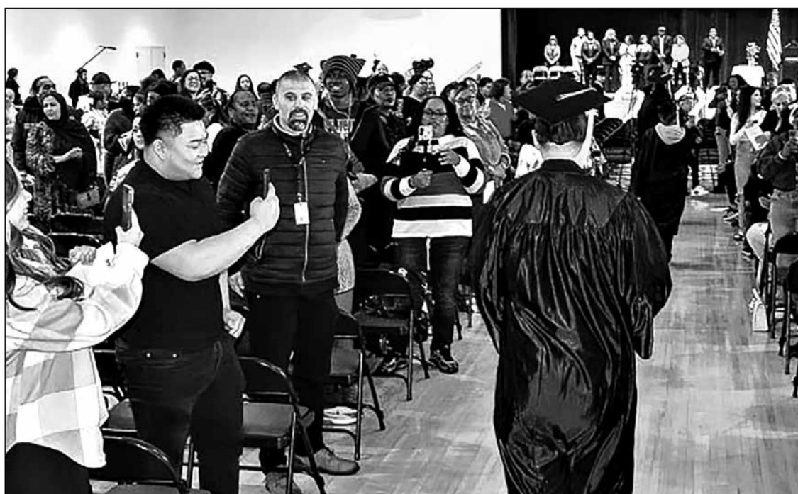
More than 100 students from SCOE's Community School and Senior Extension programs received their diplomas in a ceremony this January.

because a community surrounded you, they lifted you, they pushed you – and they believed that you were worth the investment."