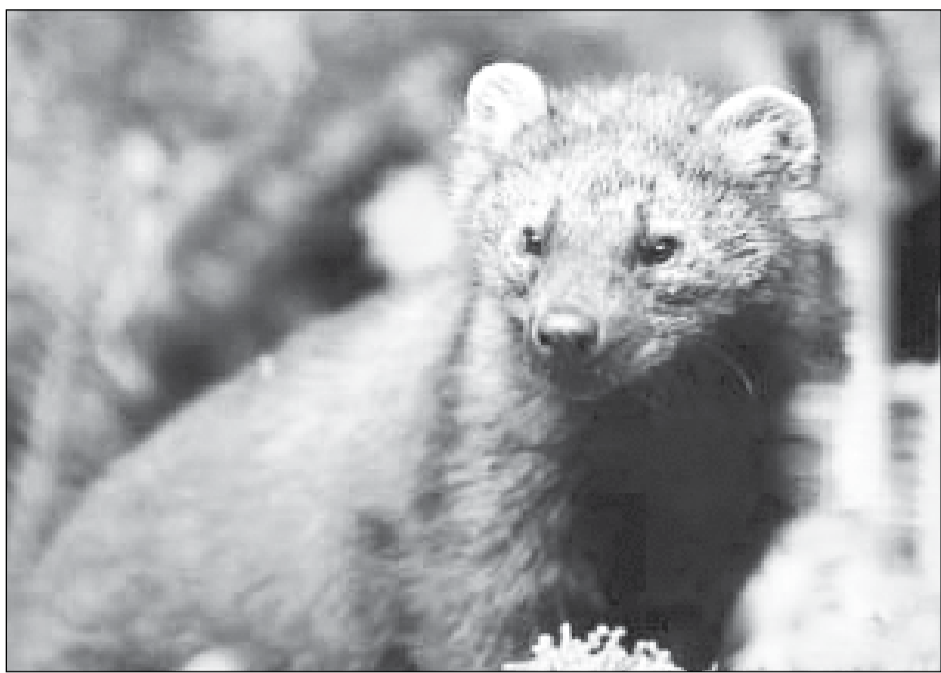
The fishers of the southern Sierra Nevada are medium-sized furry carnivores.