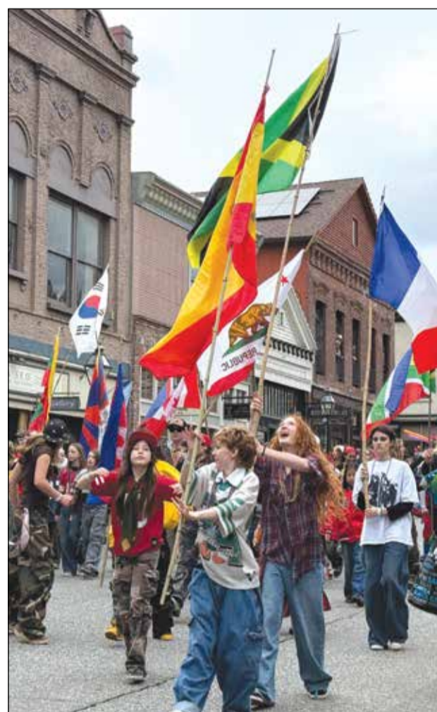
Parade participants carry colorful flags through downtown Nevada City during the 32nd annual Mardi Gras Parade on Sunday, Feb. 15. The celebration featured international flair and drew large crowds to Broad Street.

At the Miners Foundry, Carnival a la Brazil brought a Brazilian music festival indoors, adding to the day’s international theme. ★