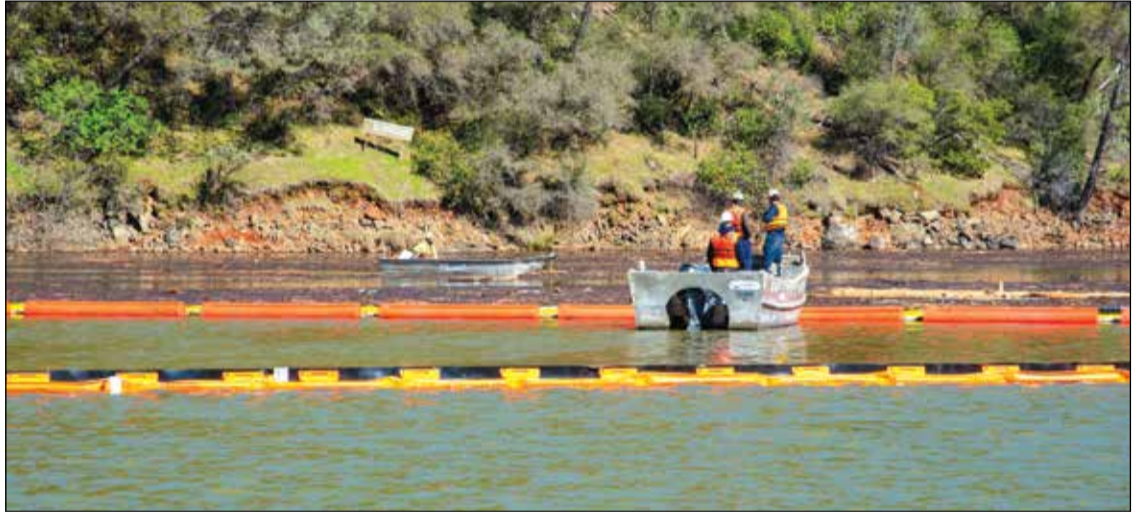
Crews work to contain and remove oily debris from the Yuba River near Englebright Lake on Feb. 22 following the New Colgate Powerhouse penstock failure. Yuba Water Agency reported that 17 bins of material had been removed in recent days as cleanup efforts continue.

rupture. General Manager Willie Whittlesey said it could take weeks or months to understand the extent of the damage and longer to complete repairs. "The reality is, it's going to take weeks to months to fully understand the extent of the damage to the hillside and to our facilities and then months to years for recovery," Whittlesey said. Environmental impacts remain under review. Fisheries scientists with the South Yuba River Citizens League reported that juvenile salmon and steelhead were stranded and likely died after river conditions changed rapidly following the incident. State and local agencies continue monitoring water quality and ecological effects. Initial independent laboratory