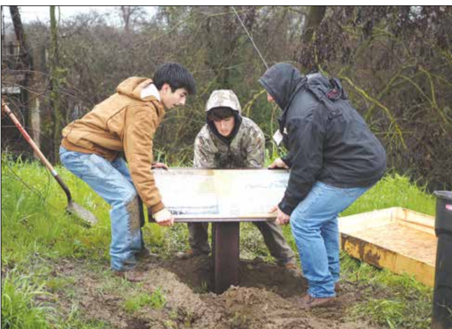
Members of the Sutter Union High School FBLA Community Service Committee install one of seven historical markers as part of the chapter's "Landmarks of Legacy" project on Feb. 12 near the Sutter Buttes.

Continued from page 1 before entering Sutter; the Sutter Train Depot in Close Lumber's parking lot in Sutter; the Sutter Cemetery; the Butte Slough School in Meridian; the Long Bridge in Meridian; and Sunsweet Growers Inc. in Yuba City. In addition to the markers, the chapter created a travel-guide brochure that is stocked in local businesses and at the Sutter County Museum. Members of the FBLA Community Service Committee are also giving presentations at local K-8 schools to discuss the importance of local history and provide information about the featured sites. To determine the project locations, committee members made multiple visits to the Sutter County Museum and researched