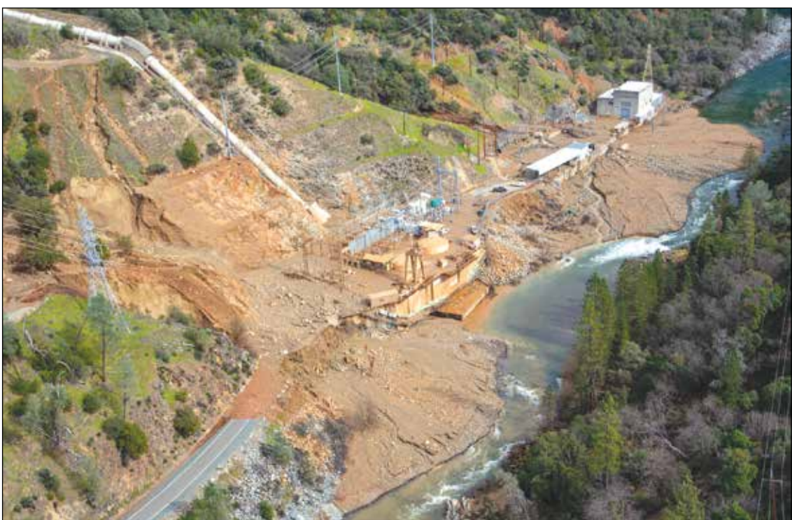
An aerial view shows the New Colgate Powerhouse and surrounding hillside following the Feb. 13 penstock rupture near Dobbins. Yuba County has proclaimed a local emergency to support environmental monitoring and cleanup efforts, officials said.