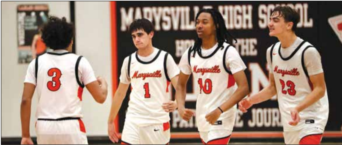
The Marysville Indians defeated the Sutter Huskies 72-68 on Feb. 20 in the second round of the CIF Sac-Joaquin Section Division IV playoffs.

Sutter converted three shots from beyond the arc and led 19-9