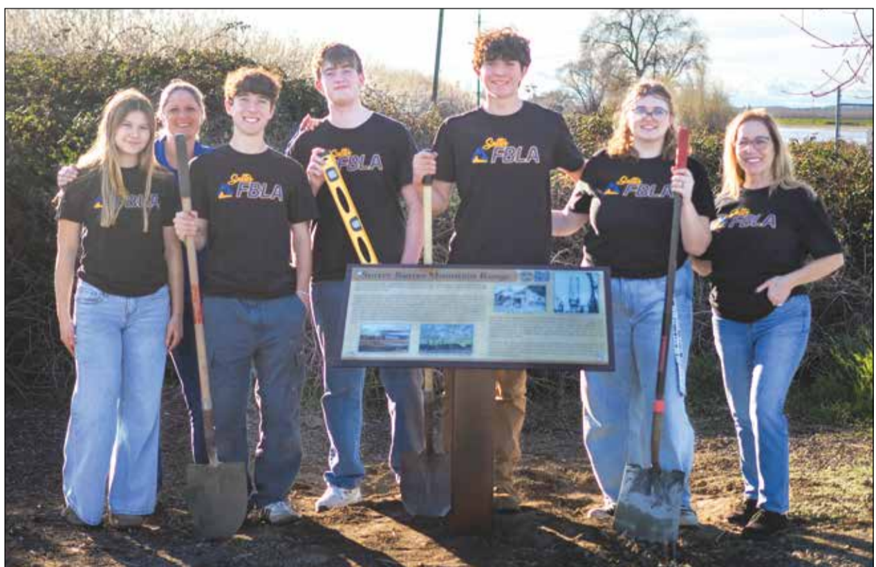
Students from Sutter Union High School's FBLA chapter display the finished historical marker installed as part of their countywide local history project on Feb. 12 near the Sutter Buttes.