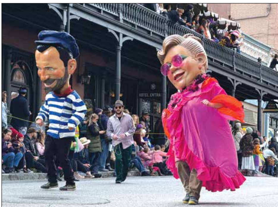
Parade participants don oversized character costumes during Nevada City’s 32nd annual Mardi Gras Parade on Sunday, Feb. 15, adding to the festive atmosphere of the afternoon event.