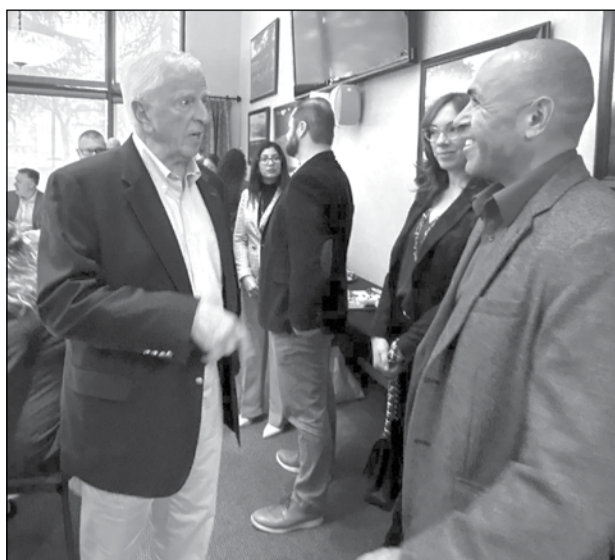
Congressman Mike Thompson, left, met with rural healthcare leaders Feb. 6 in Yuba City to discuss access and funding challenges in California's 4th Congressional District.

"I heard from health care leaders today that these new cuts threaten to accelerate closures and further limit access to care in rural communities, which means everyone