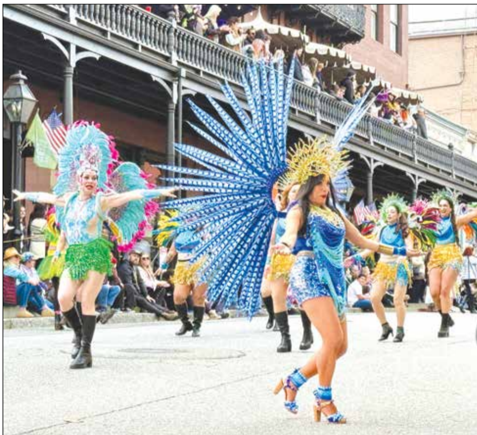
Dancers in vibrant feathered costumes perform along the parade route during Nevada City’s 32nd annual Mardi Gras Parade on Feb. 15. The festivities included Brazilian-inspired performances and live music throughout downtown.