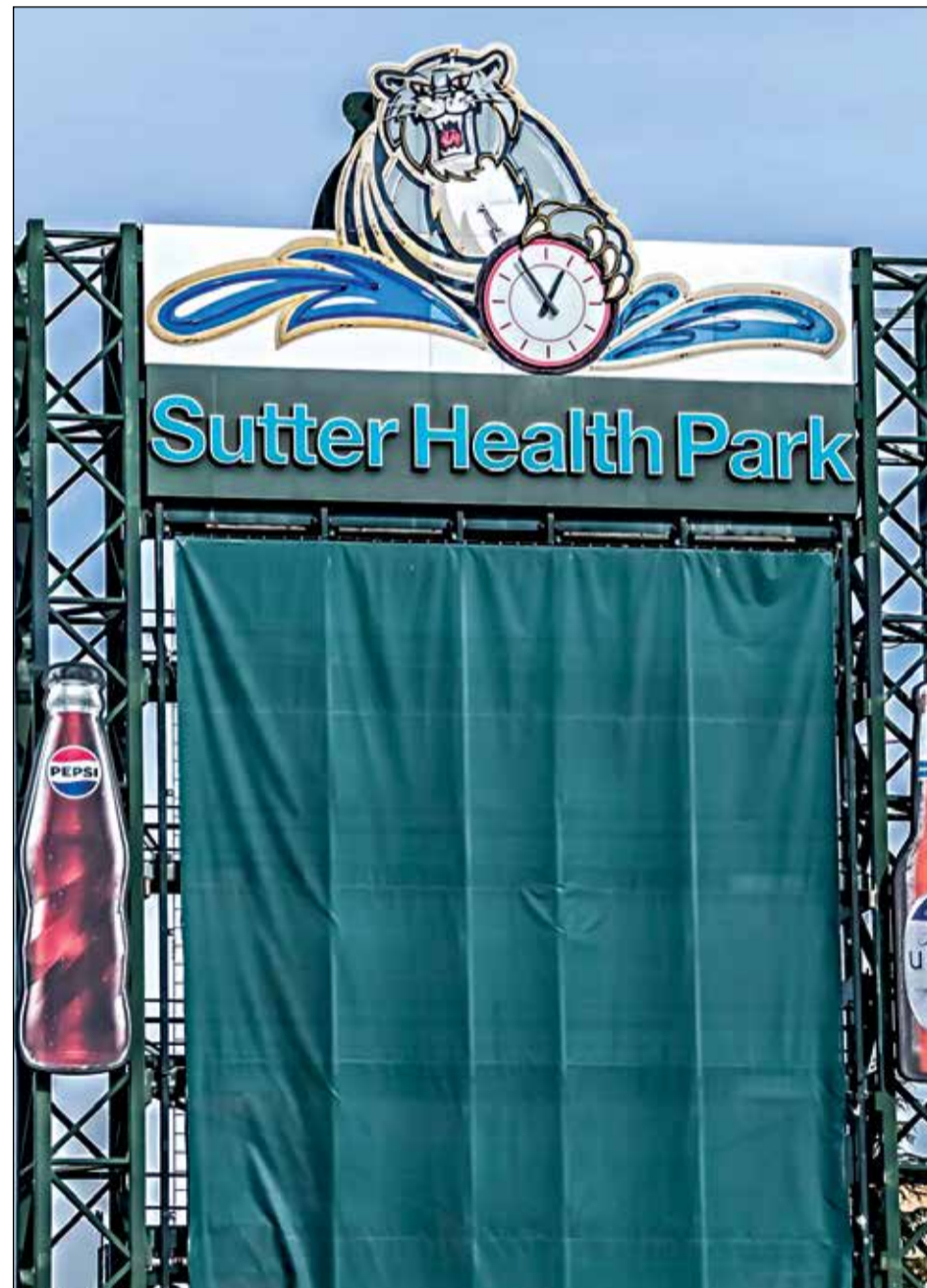
Sutter Health Park stands as a valued regional landmark and an integral part of Sacramento's baseball tradition, dating back to 1869.