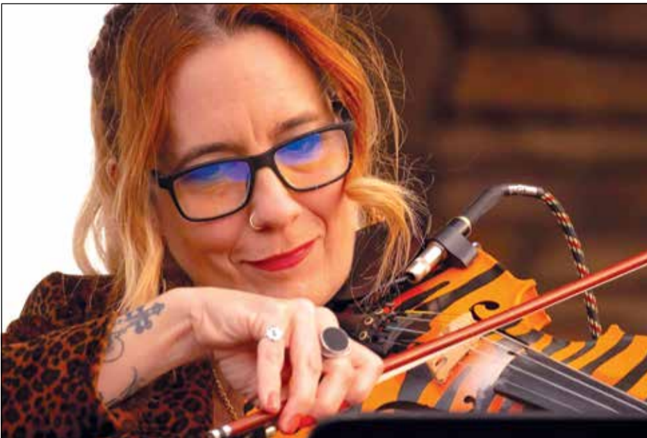
Renegade Orchestra features the pure unbridled fury of some of the bay area's top orchestra players unleashed on classic rock songs backed up by a hard-hitting rhythm section.

The Beauty of a Symphony, the Soul of a Rock Band