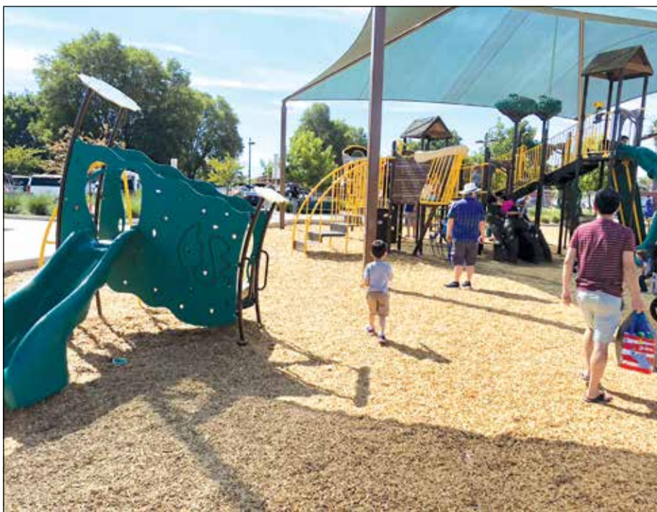
Major improvements and upgrades to West Sacramento’s Bryte Park will be underway following a contract award for the Bryte Park Master Plan Implementation Project.

According to a presentation at the City Council’s Aug. 6, 2025, meeting, the city has resources to cover $27.5 million in construction costs, including a $15