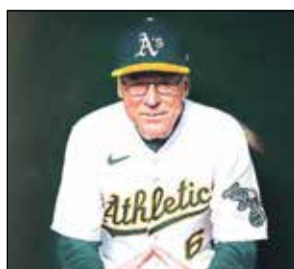
The Athletics have welcomed back Bob Melvin as Special Assistant, Baseball Operations, the club announced Feb. 19.

Melvin returns to the A's where managed for 11 seasons from 2011-21. The A's were 853-764 (.528) under his guidance, winning three American League West titles (2012, 13, 20) and three American League (AL) Wild Card berths (2014, 18, 19). Melvin was named American League (AL) Manager of the Year in 2012 and 2018 and earned National League Manager of the Year honors with