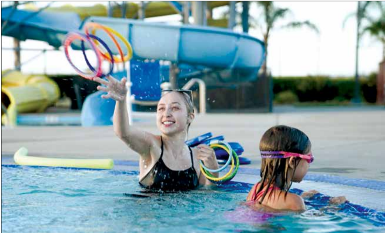
The Bryte Park Master Plan spells out renovations to existing features along with new amenities, the biggest of which is an aquatic center with a six-lane lap pool, zero entry wading pool, shaded spectator areas and a building with rooms that can be rented to the public.