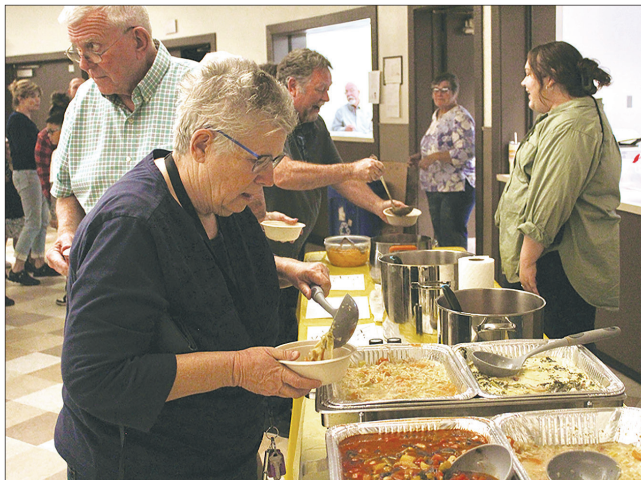
Galt Sunshine Food Pantry & Resource Center, Inc. will host its annual Empty Bowls fundraiser from 5 to 8 p.m. Saturday, March 7 at Littleton Community Center, 410 Civic Center Drive.