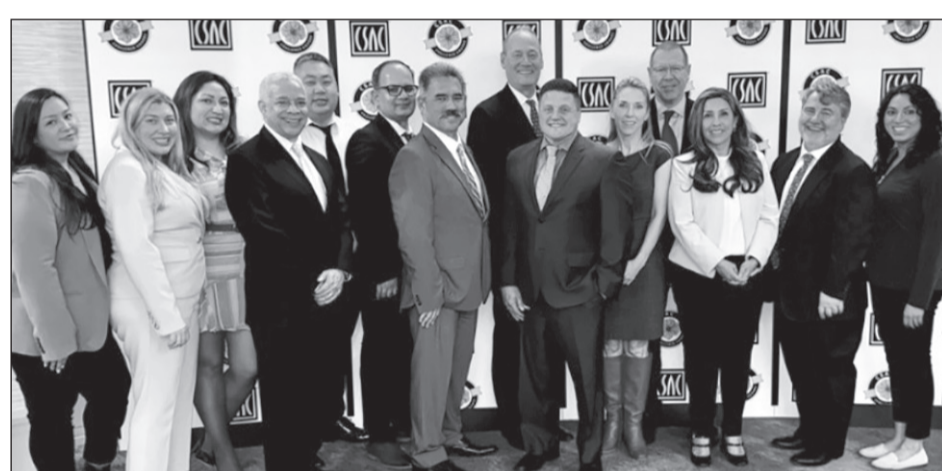
The Sacramento County Public Defender's Office was awarded a 2025 Challenge Award on Feb. 11 by the California State Association of Counties for innovative work through its Juvenile Pre-Trial Program.

"This award reflects our belief that when we invest in young people early, by understanding