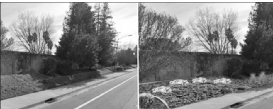
A current view of landscaping along Stockton Boulevard, left, and a rendering showing the planned improvements for the road corridor.