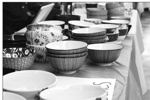
The Empty Bowls fundraiser dinner, hosted by Galt Sunshine Food Pantry & Resource Center, Inc., will feature local artisan bowls for sale on Saturday, March 7.