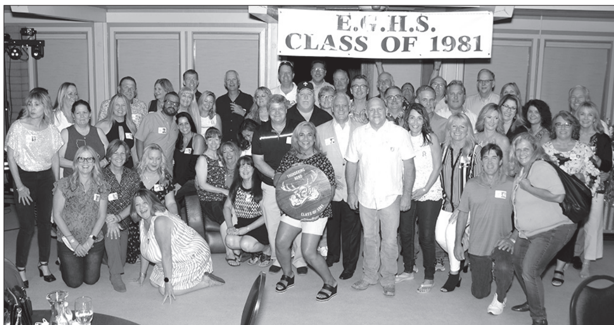
The Elk Grove High School's Class of 1981 will hold its 45-year reunion on Saturday, July 25 at The Rancho Murieta Inn & Spa, 7337 Murieta Drive.