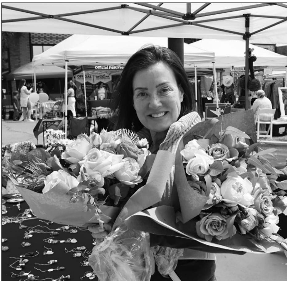
The City of Galt announced in its latest newsletter that the Saturday Market will host a kickoff event from 9 a.m. to 2 p.m. March 7 at the 4th Street Promenade featuring live music from Listen Hear Band.