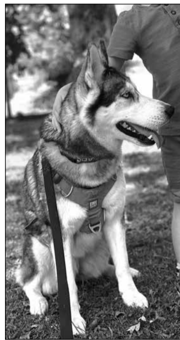
The Roy C. Marcum Animal Care Faire will feature adoptable dogs and cats ready to meet their forever families.