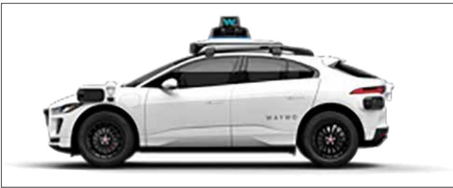
The 5th-generation all-electric Jaguar I-PACE.

Self-Driving Rideshare Services Coming to Sacramento