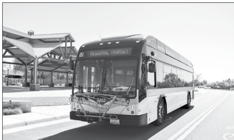
The Sacramento Regional Transit District (SacRT) will implement adjustments on seven bus routes effective April 6 to enhance on-time performance and maintain reliable connections across the system.

Route 138 (Weekdays): Up to 10 minutes of travel time will be added to certain trips. ★