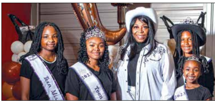
Purple Pageant, the Greater Sacramento-based pageant, has nurtured young women and girls to become not just queens on stage, but leaders in their communities.