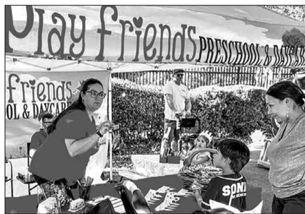
The free Family Fun & Playfest at Fairytale Town will showcase early learning programs and community organizations, offering education, health, and wellness information to parents.