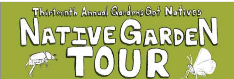
The Gardens Got Natives tour is a free self-guided event featuring forty plus California native plant gardens in the Sacramento Area.

I am taking action to provide victims of sex offenses and their families the peace and security of knowing that the person who violated them will not be eligible for early release simply because they turned 50. I will do everything I can to keep people who commit these terrible crimes where they belong, in prison. ★