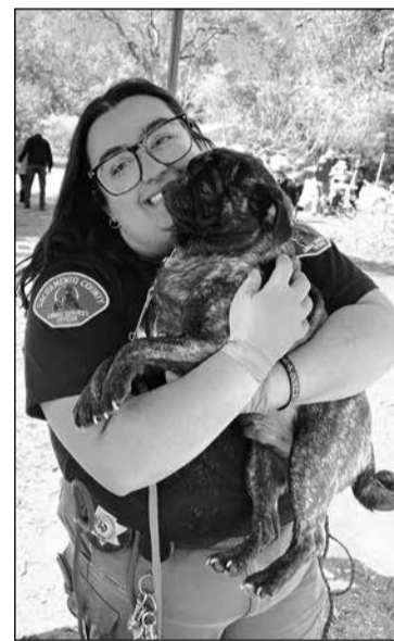
The Roy C. Marcum Animal Care Faire is a free, family-friendly, pet-friendly event offering the community a chance to come together in celebration of animals, compassion and the lifesaving work happening every day at Bradshaw Animal Shelter.