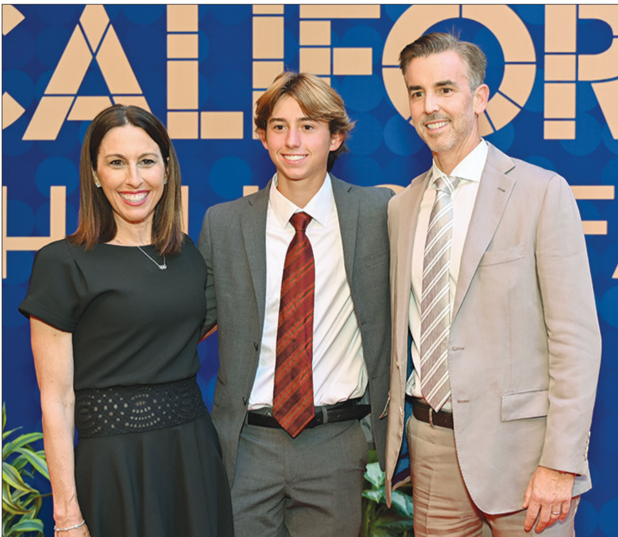
Olympic gold medalist Janet Evans is pictured with her family at the red-carpet event before being honored at the California Hall of Fame 19th Class ceremony on March 19.