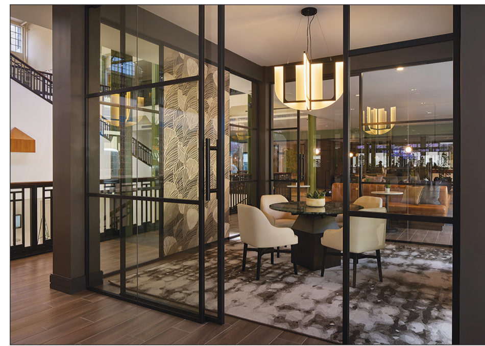
Pictured is a meeting space available at the newly renovated Sheraton Grand Sacramento.