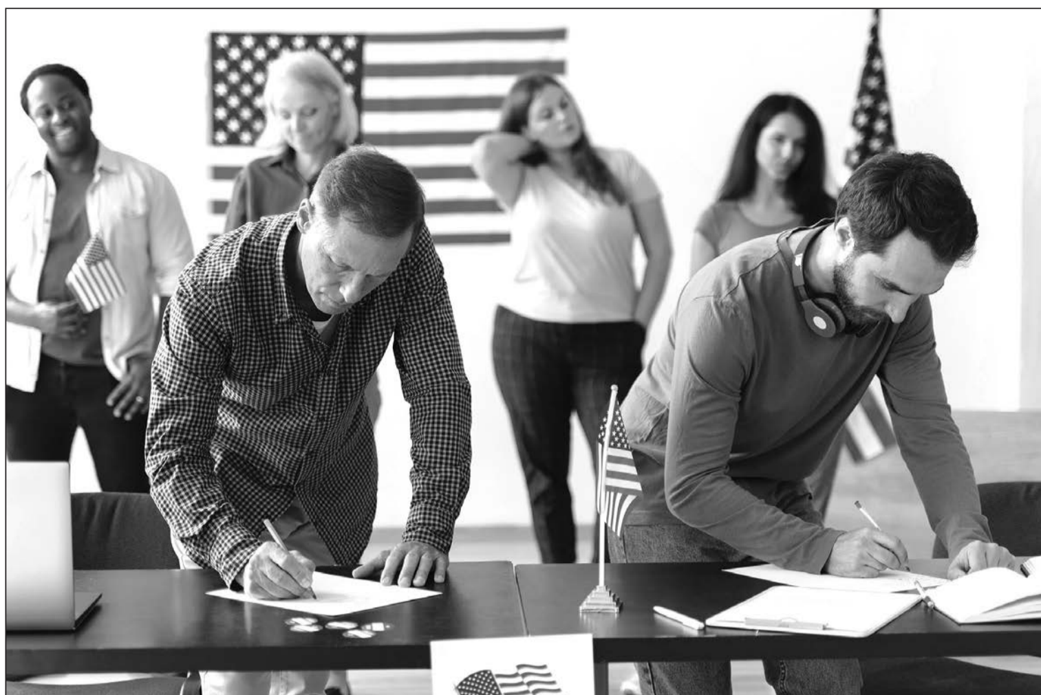
Where do I vote? Am I registered to vote? Does everyone get a ballot in the mail? Get the answers to your election day questions ahead of California's June 2 primary election.

How do I register? Visit https://registertovote.ca.gov/ . You'll need the same information as above.