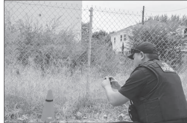
The city is reminding property owners to clear tall weeds or face code violations, as dry, overgrown vegetation can pose a significant fire hazard and impact neighborhoods.

For more information, call 916-808-2633 or visit the weed abatement web page at bit.ly/4sWVom8 (case sensitive). ★