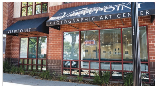
Photography Month Sacramento, led by Viewpoint Photographic Art Center, is in progress with various receptions and special activations happening throughout April.