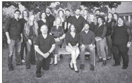
Reconciliation Singers Voices of Peace (RSVP), a Sacramento-based vocal ensemble known for blending artistic excellence with community impact, will present its Spring 2026 concert series.

Concerts will be held at multiple Sacramento-area venues: at 7:30 p.m. Friday, April 24, at Faith Presbyterian Church, 625 Florin Road, Sacramento; at 3 p.m. Saturday, April 25, at Pleasant Grove Community Church, 1730 Pleasant Grove Blvd., Roseville; at 7:30 p.m. Friday, May 1, at The Table at Central United Methodist Church, 5265 H St., Sacramento; and at 7:30 p.m. Saturday, May 2, at the Benvenuti Performing