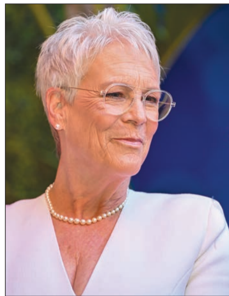
California native and Hollywood actor Jamie Lee Curtis is pictured at the California Hall of Fame 19th Class red carpet event ahead of the ceremony, where she was honored as an inductee.

Trained at an early age by his parents, two track and field stars, Lewis grew up under their keen professional tutelage, winning NCAA championship titles. In 1984, he debuted at the Los Angeles Olympics, winning the long jump, 100-meter dash, 200-meter dash and the 4 by 100-meter relay. Lewis ended up winning nine Olympic gold medals across four Olympic Games, along with eight world championship titles and multiple world