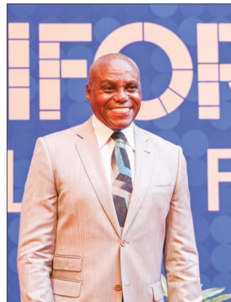
Olympic gold medalist Carl Lewis poses at the California Hall of Fame 19th Class red-carpet event before being honored as an inductee at the ceremony.

The first partner then introduced Jamie Lee Curtis, Academy Award-winning actor and humanitarian. Born in Los Angeles to Hollywood legends Tony Curtis and Janet Leigh, she attended the University of the Pacific in Stockton (following in her mother's footsteps) and has become a role model for generations.