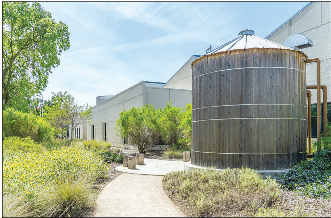
The City of Sacramento's Department of Utilities invites residents to tour its water-efficient demonstration garden on April 18 and learn how California native plants can create a beautiful, low-water landscape.

Attendees are encouraged to register in advance for the event at sacvalleycnps.org/gardens-gone-native-tour . Registration includes a map and brochure, which will be sent a week before the tour begins. ★