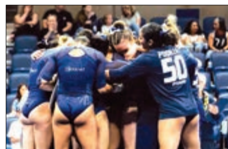
Student-athletes are named to the MPSF All-Academic team based on a specific set of criteria, all of which the eight Aggies successfully met to earn the honor.

To qualify, a student-athlete must maintain a cumulative grade point average of 3.00 or higher, be at least a sophomore academically, and have completed one full academic year at the institution prior to the season in which the award is received. In addition, the student-athlete must have participated in at least fifty percent of the institution's competitions in their respective sport.