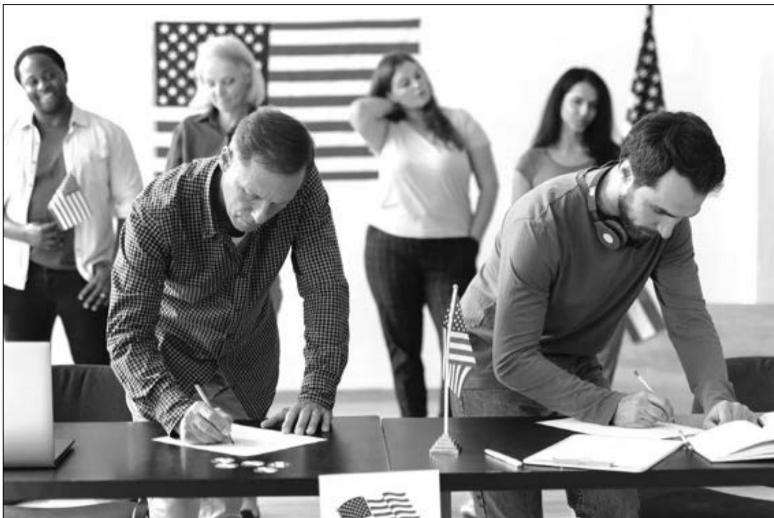
Where do I vote? Am I registered to vote? Does everyone get a ballot in the mail? Get the answers to your election day questions ahead of California's June 2 primary election.

How do I register? Visit https://registertovote.ca.gov/ . You'll need the same information as above.