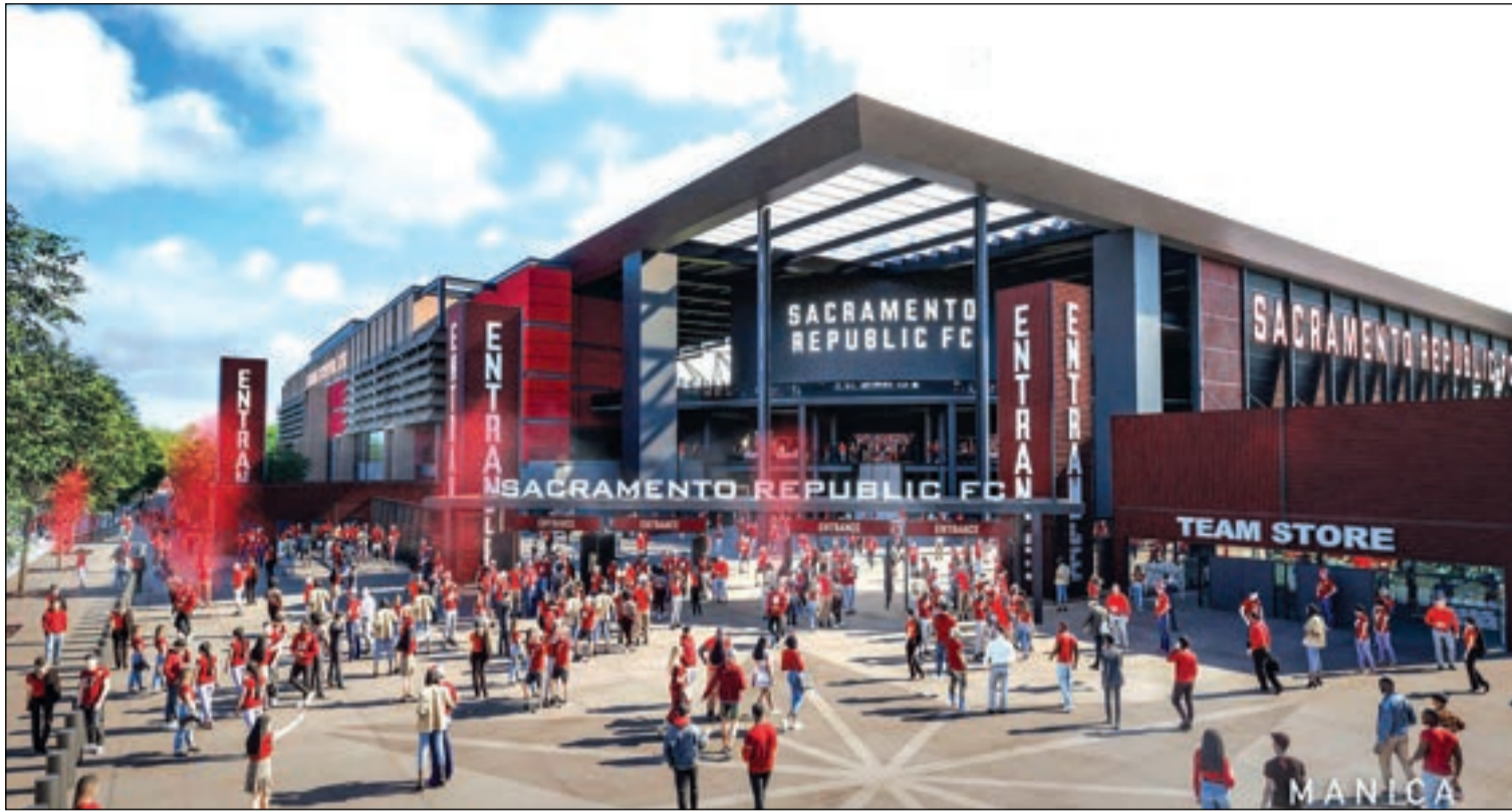
Republic FC's new downtown home will be the biggest pro sports and entertainment venue in the region and will serve as the anchor for a new neighborhood that will help double the size of Downtown.