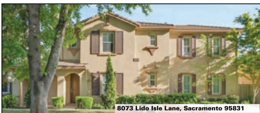
8073 Lido Isle Lane, Sacramento 95831