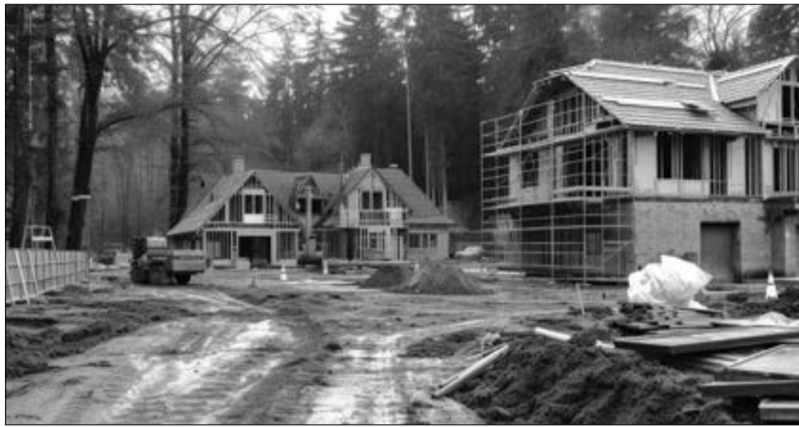
Sacramento region is a powerful economic driver that generates billions of dollars in income, supports tens of thousands of jobs and delivers more than $1 billion annually to local governments.