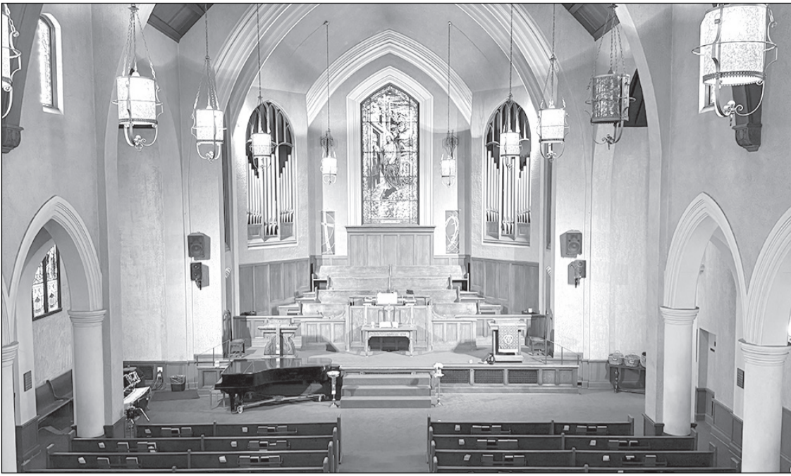
The 100-year-old sanctuary is home to the congregation that was the first church formed in Sacramento during the Gold Rush in 1849.