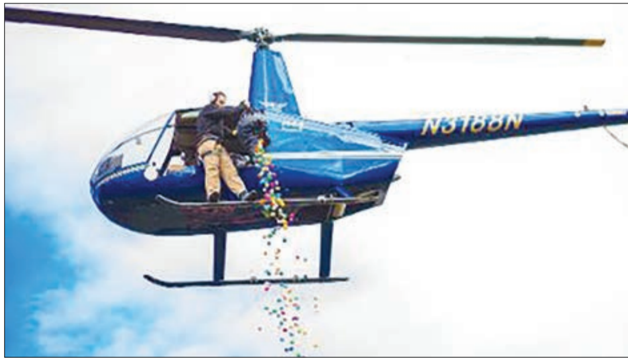
The helicopter is pictured dropping more than 2,000 Easter eggs over River's Edge lawn on March 28.