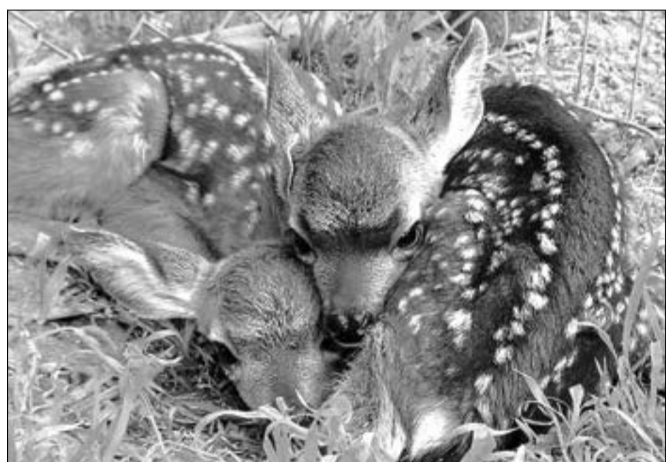
It is both illegal and unethical to feed deer and keep deer in your personal possession.

California Department of Fish and Wildlife News Release