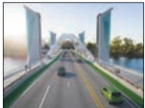
The city released an update on the I Street Bridge Replacement Project, noting higher-than-expected costs for delays but reaffirming it as a top priority, with construction now expected to begin in 2027.