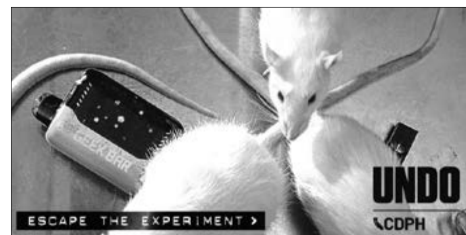
The “Not Your Lab Rat,” aims to reduce nicotine addiction among young adults and prevent the initiation of vaping and use of other modern nicotine products.