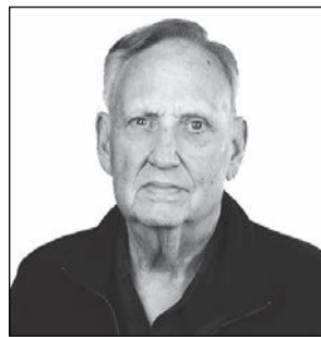
By Dan Walters, CALMatters.org

Eric Swalwell's abrupt departure from the campaign for governor due to revelations about sexual transgressions leaves nine men and women remaining as serious contenders for spots on the November ballot.