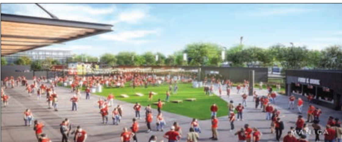
Lund Construction's portfolio throughout the Sacramento area encompasses complex joint trench systems, multi-utility coordination, and large-scale infrastructure delivery.

of the Sacramento region. At the heart of our work is a simple belief: strong communities are built by dedicated people. That principle continues to guide everything we do. We are honored to contribute to the future home of Sacramento Republic FC and proud to partner with the