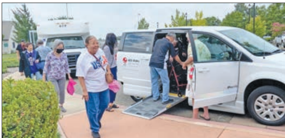
From transportation to medical appointments and wellness classes to social activities and caregiver support, ACC ensures seniors remain active, connected and valued members of our community.

From transportation to medical appointments and wellness classes to social activities and caregiver support, ACC ensures seniors remain active, connected and valued