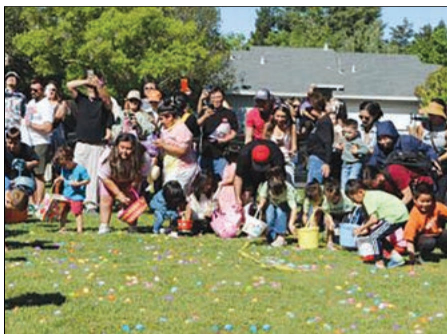
More than 1,500 people were at this year's dropping of Easter eggs at the River's Edge Church at 6446 Riverside Blvd.

Her final comment was, "It's always a very fun community event! We are grateful to host these fun opportunities and love welcoming folks!" ★