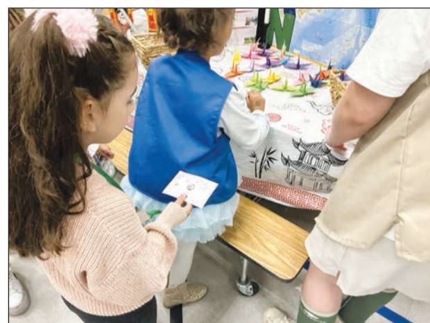
Younger Girl Scouts, wearing their lanyards with paper "passports," visit each country display to collect stamps during World Thinking Day.