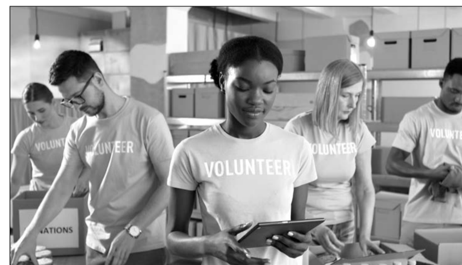
If you are interested in getting involved, there's a wide range of opportunities. Take some time to learn more about the volunteer options and see what interests you.