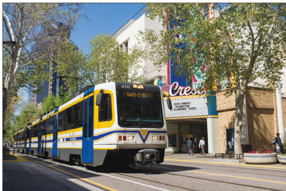
The Elk Grove City Council has approved a proposed plan to extend Sacramento Regional Transit's Blue Line light rail service to the city. The council accepted the plan under the condition it expands its scope to look at a more regional approach to transit in the city and incorporates new transportation technologies.