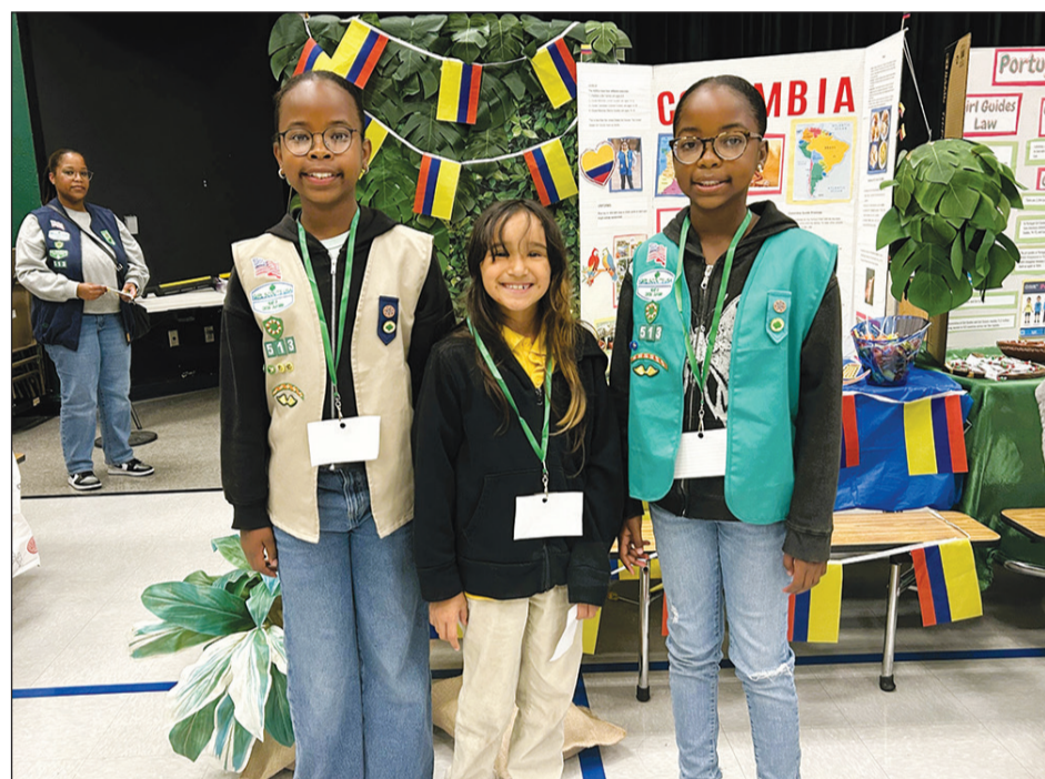
Girl Scouts from Elk Grove/Galt Service Unit 144 pose for a photo in front of a display celebrating Girl Scouts in Colombia, wearing lanyards with paper "passports" used to collect stamps at each country station they visited during World Thinking Day on April 10.

The event also featured a guest speaker who offered