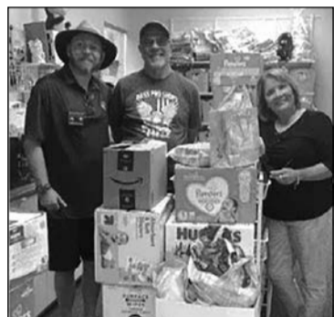
The Sacramento Life Center provides compassionate, life-affirming medical care and resources at no cost to pregnant women, empowering them to make informed choices and build strong families. You can learn more at saclife.org .

Founded in 1972, Sacramento Life Center provides free medical care and comprehensive support services to low-income women, teens, and families facing unplanned or unsupported pregnancies. Through its licensed