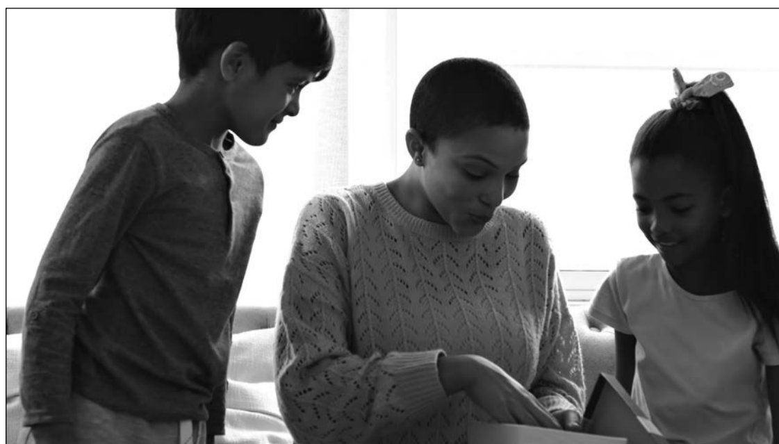
As conversations continue at the state level about ways to improve access to child support services, Sacramento County remains focused on its mission: helping children and families thrive.