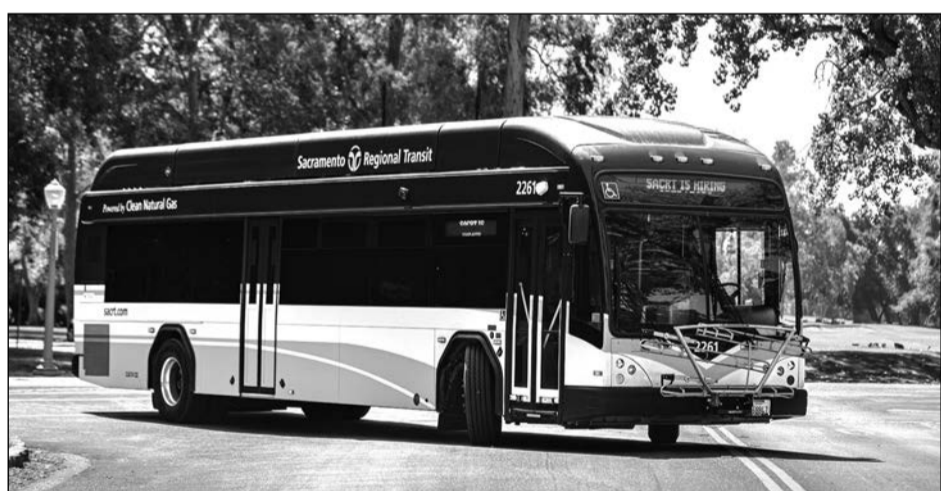
Transit Connect is being developed to support a seamless, integrated fare experience across multiple Northern California transit providers by fall 2026, further expanding rider convenience and regional mobility.