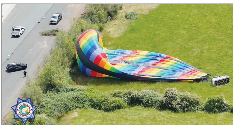
Officials confirmed that the pilot was the sole occupant of the hot air balloon that struck the side of Sky River Casino.

Sky River Casino said in a statement the pilot initiated the flight due to