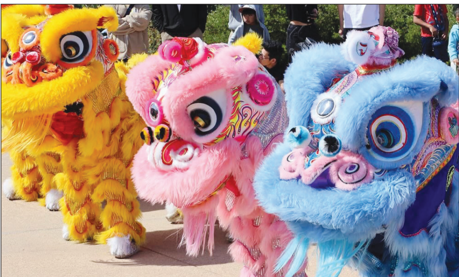
Pictured is The Teng Fei Lion Dance group at the 2025 Asian Pacific CultureFest, kicking off the event with a live performance.