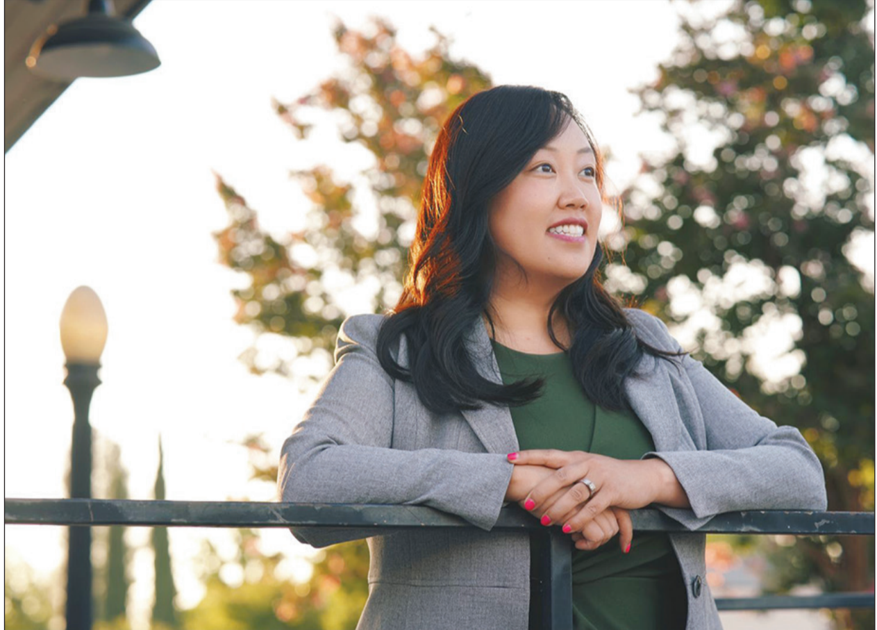
Sacramento City Councilmember Mai Vang, in an April 16 interview with the Elk Grove Citizen, outlined her campaign priorities ahead of the June state primary as she seeks the District 7 congressional seat.

Candidate Highlights Priorities for District 7 Campaign