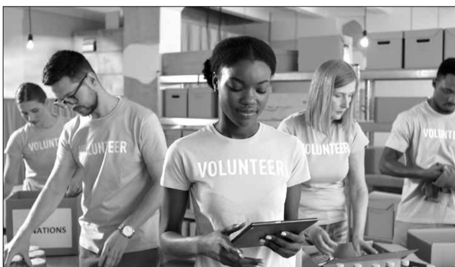
If you are interested in getting involved, there's a wide range of opportunities. Take some time to learn more about the volunteer options and see what interests you.