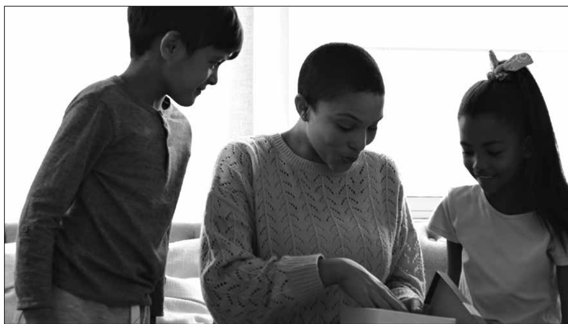
As conversations continue at the state level about ways to improve access to child support services, Sacramento County remains focused on its mission: helping children and families thrive.