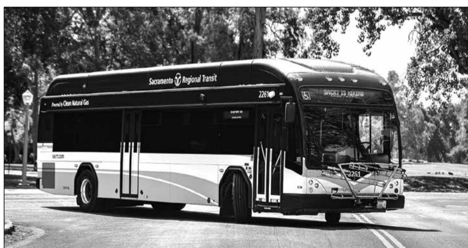
Transit Connect is being developed to support a seamless, integrated fare experience across multiple Northern California transit providers by fall 2026, further expanding rider convenience and regional mobility.