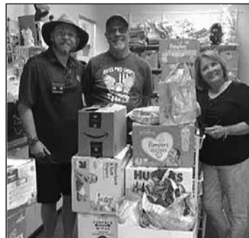
The Sacramento Life Center provides compassionate, life-affirming medical care and resources at no cost to pregnant women, empowering them to make informed choices and build strong families. You can learn more at saclife.org .

Founded in 1972, Sacramento Life Center provides free medical care and comprehensive support services to low-income women, teens, and families facing unplanned or unsupported pregnancies. Through its licensed