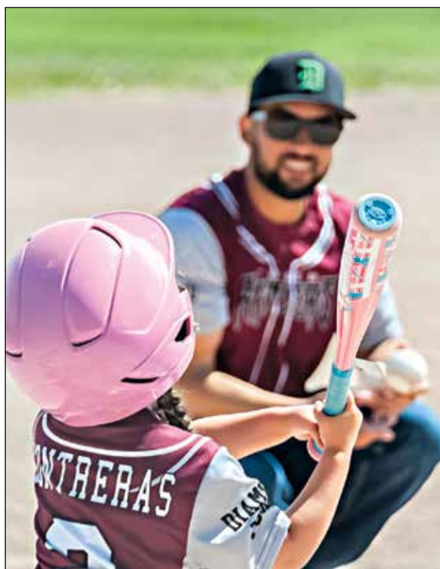
Dixon Girls Softball games will continue into mid-May, with the season concluding during week 10. Key matchups include the Dixon HUNTR/X against the Dixon Bobcats on May 13 and the Bobcats versus the Diamond Daisies on May 14 at Hall Park.