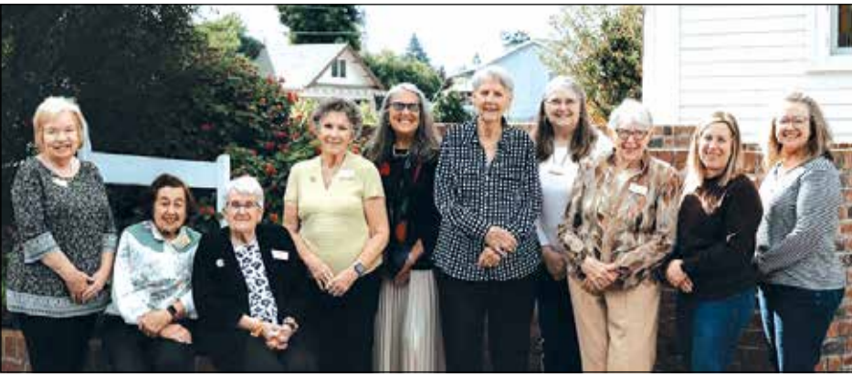
Dixon Women's Improvement Club (DWIC) is hosting its annual scholarships and community grants dinner from 5 to 8 p.m. May 1. Held in the banquet room at Pedro's Cocina, 1423 Market Lane, the event will include raffle prizes, a silent auction, and dinner.