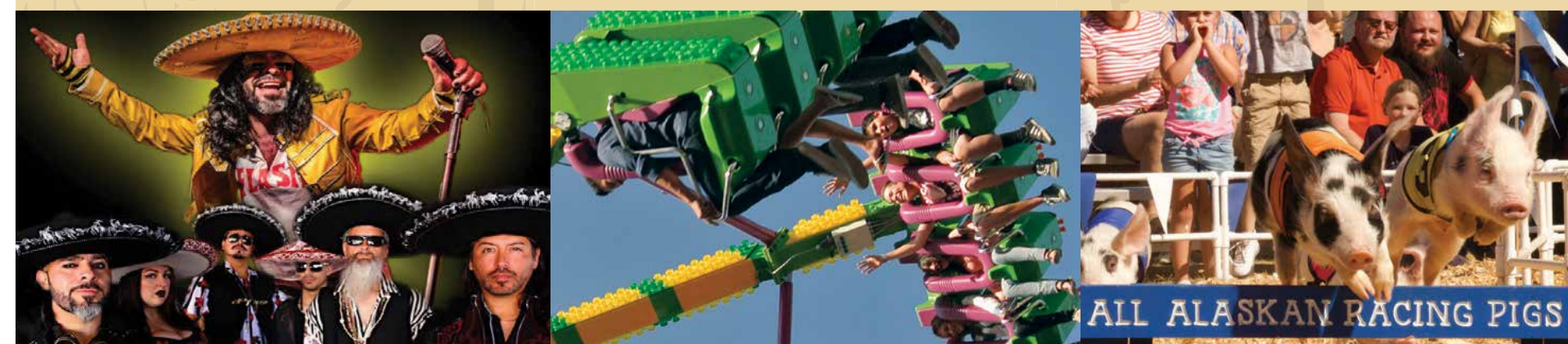
ALL ALASKAN RACING PIGS

Schedule Subject to Change without Notice