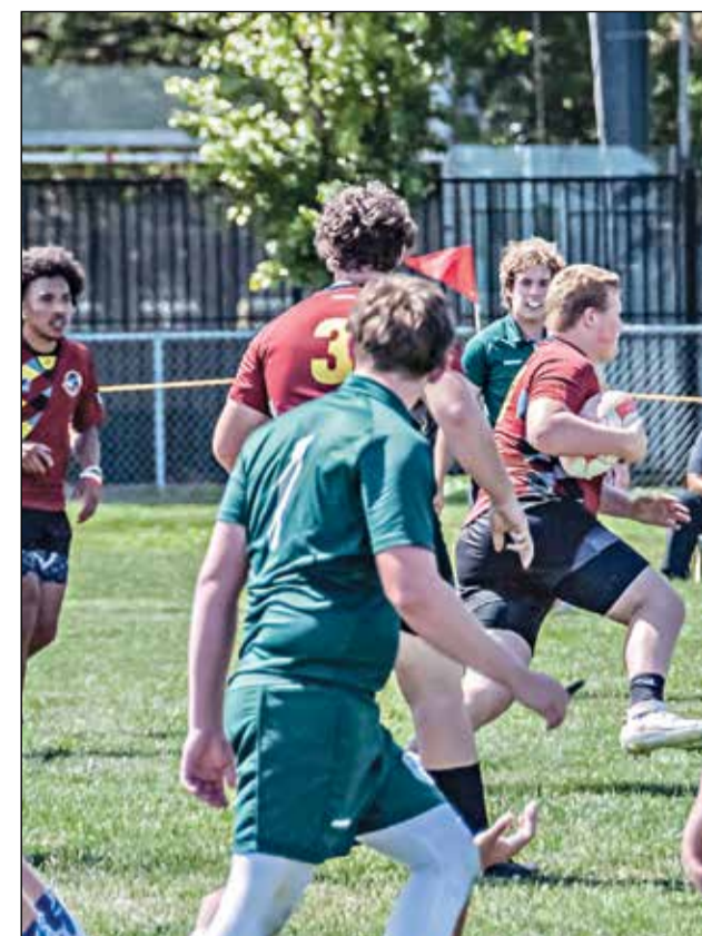
Solo Youth Rugby's high school team enters postseason play in May, with playoffs held May 5, followed by a championship match May 9 and an All-Stars event May 16.