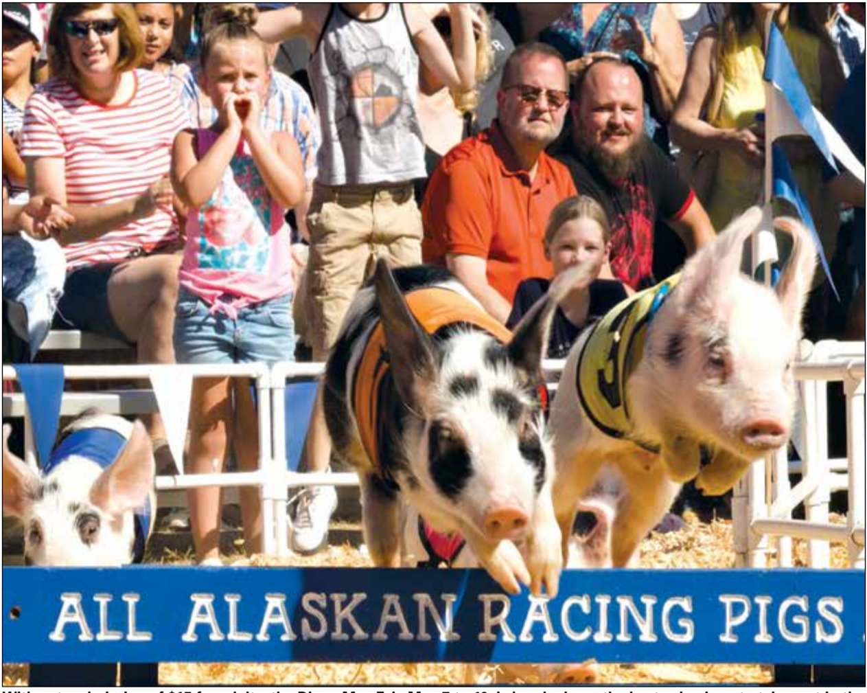
ALL ALASKAN RACING PIGS With gate admission of $15 for adults, the Dixon May Fair, May 7 to 10, is hands-down the best value in entertainment in the area. However, there are also a number of discounted days and tickets available.