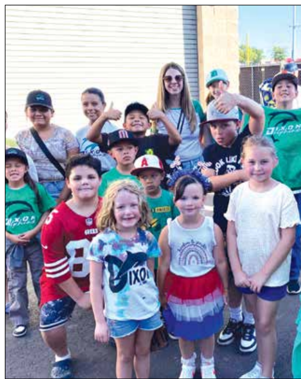
Dixon Dolphins Swim Team will continue its season at 7 a.m. May 2 with an intersquad meet at Pat Granucci Aquatics Center, 450 E. Mayes St. This meet is for Dixon Dolphins swimmers only. Swimmers will compete in all events to set times before the first league meet.