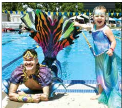
The weekend’s programming ranges from public spectacles to interactive workshops, including swim sessions, costuming classes, educational panels and live performances.

Main convention programming takes place Saturday, May 16, from 9 a.m. to 5 p.m. at Hagan Park Community Pool, featuring hands-on activities and performances for attendees of all ages. That night, the Bubble Ball runs from 7:30 to 11:30 p.m. at the Hagan Community Center, offering a ticketed, all-ages costume event with live entertainment and immersive visuals.