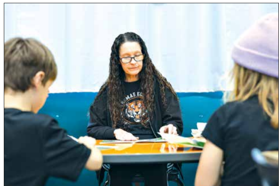
Designed to identify early signs of reading difficulties, including risk factors for dyslexia, the screener helps teachers better understand how to support students’ literacy.