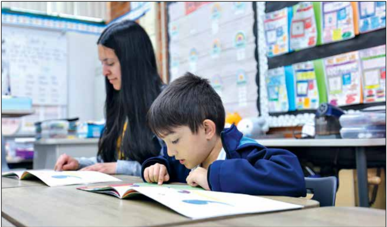
During the screening process, students work with staff to identify letters, sounds, or words and may also read aloud or answer questions about what they hear.

How The K-2 Reading Difficulties Screener Guides Student Success