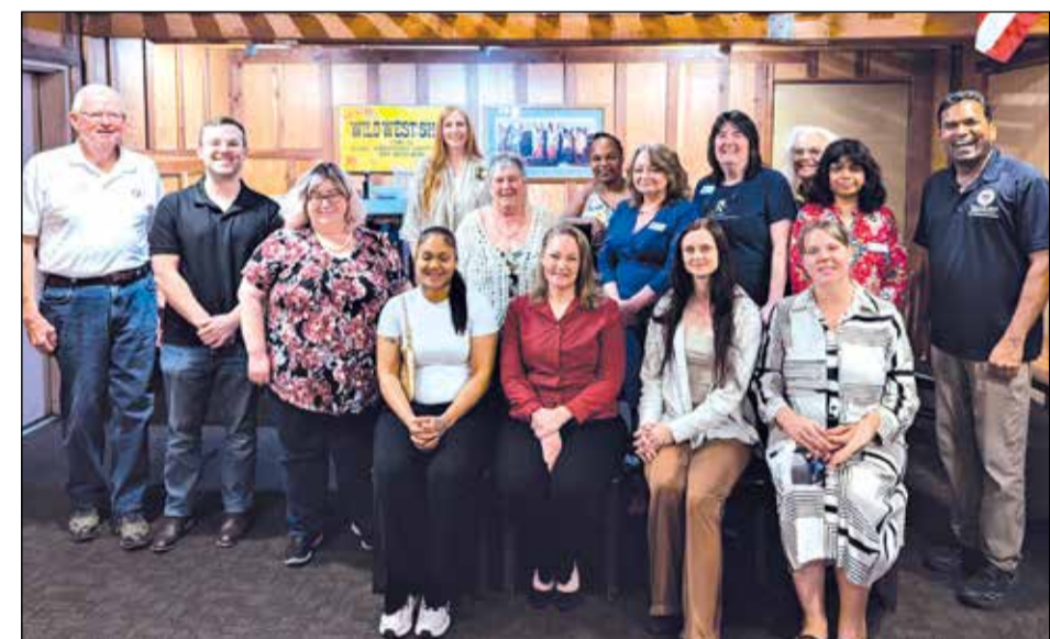
Soroptimist International of Rancho Cordova & Gold River awarded $3,500 in Live Your Dream: Education and Training Awards for Women to five local women to support their pursuit of higher education and improve their economic situation.