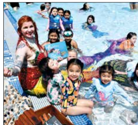
The California Mermaid Convention returns May 15-17 for its seventh annual event, transforming the Hagan Community Center and Cordova Community Pool into a three-day celebration.

convention’s most anticipated events, will feature a jazz band, aerial performances and the crowning of the event’s “Pearl,” recognizing a standout participant within the community.