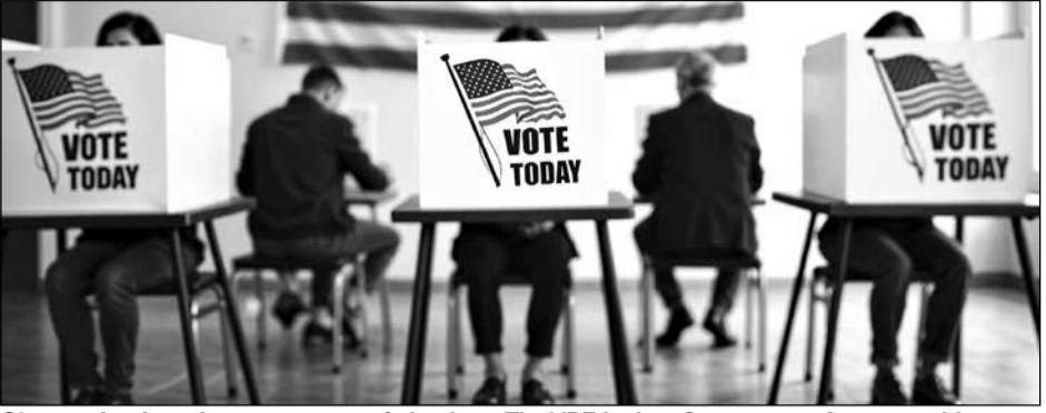
Observation is an important part of elections. The VRE invites Sacramento County residents to observe these processes anytime they are running.