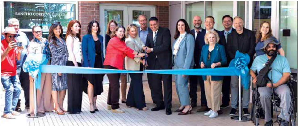
Folsom Lake College, in partnership with Sutter Health, unveiled a new Instructional Healthcare Hub at its Rancho Cordova Center on April 29.

Folsom Lake College, Sutter Health open hands-on healthcare training hub