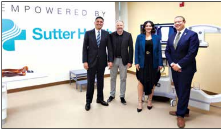
For Sutter Health, the investment is part of a larger effort to address workforce shortages while strengthening community health systems.