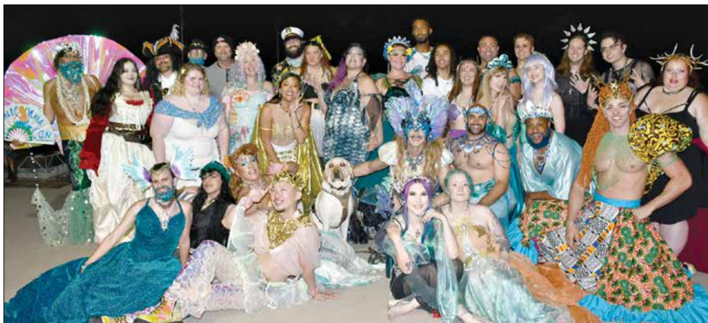
The Bubble Ball, one of the convention’s most anticipated events, will feature a jazz band, aerial performances and the crowning of the event’s “Pearl.”

Festivities begin Friday, May 15, with the Promenade of Mermaids from 5 to 7:30 p.m. along the Embarcadero Waterfront in Old Sacramento, a free, all-ages event that has become a regional tradition. The evening continues with a 21-and-over launch party from 8:30 to 11:30 p.m. at Dive Bar, 1016 K St., Sacramento.