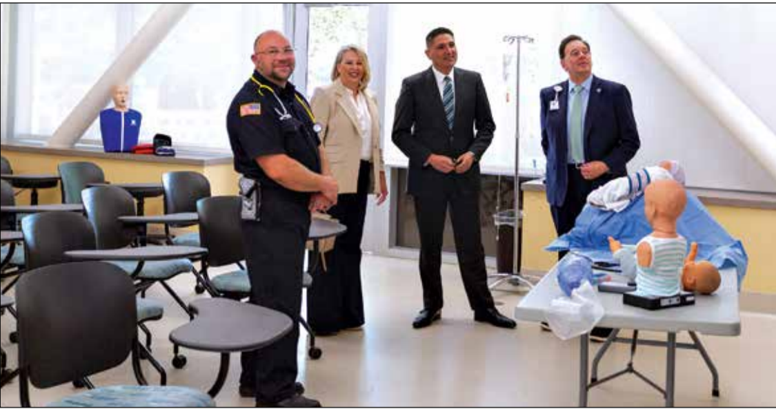
College officials said the hub is designed to mirror real-world clinical environments and better prepare students for immediate employment.

Continued from page 1 Instructional Healthcare Hub at its Rancho Cordova Center, backed by a $2.5 million investment aimed at expanding hands-on training for students entering allied health fields. The upgraded facility, located at 10259 Folsom Blvd., features four modernized classrooms equipped with advanced medical technology, including simulators, X-ray machines and hospital beds. College officials said the hub is designed to mirror real-world clinical environments and better prepare students for immediate employment.