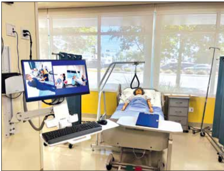
The upgraded facility, located at 10259 Folsom Blvd., features four modernized classrooms equipped with advanced medical technology, including simulators, X-ray machines and hospital beds.