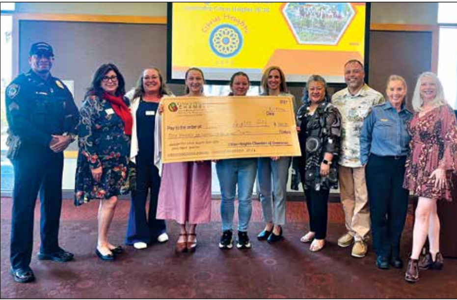
The Citrus Heights Leadership Class presented a donation of $3,164.79 to Citrus Heights Arts for its class project.