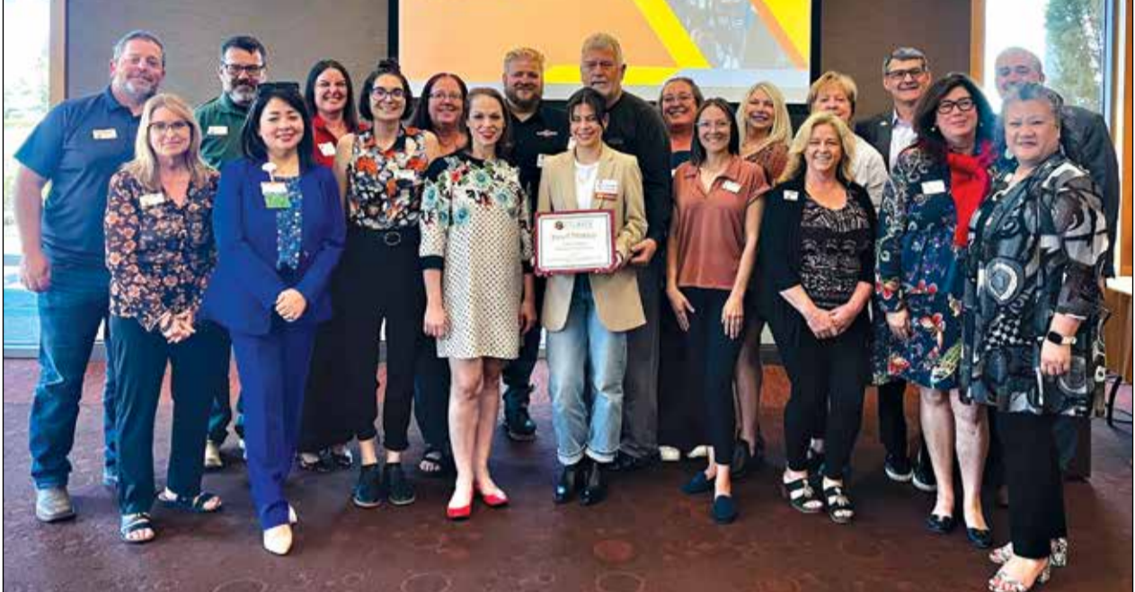
Citrus Heights Chamber of Commerce ambassadors stand alongside new chamber member, Play Makers, a non-profit organization focused on inclusiveness and developmental differences.

ACCESS Citrus Heights luncheon highlights Mercy San Juan crisis unit