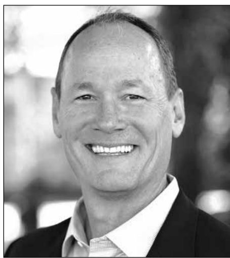
Sacramento County District 3 Supervisor Rich Desmond has been selected to sit on the Homelessness Task Force.

regional governance structure, while maintaining local control of critical land use and budgetary decisions for locally generated funding. The proposal creates a single governing board that would serve dual roles: acting as the federally required CoC Board while also functioning as an advisory body to local jurisdictions on homelessness issues outside the scope of the CoC, including shelter operations, encampment response, housing coordination and related policy matters.