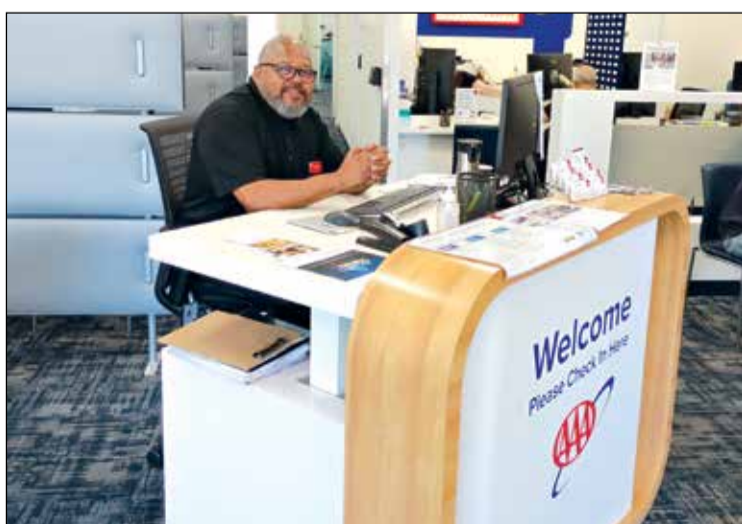
Arriving members and prospective members are greeted by a friendly, trained CSAA insurance agent manning a red, white and blue workstation in the front lobby who can field a wide range of questions and schedule appointments with an agent while they wait.