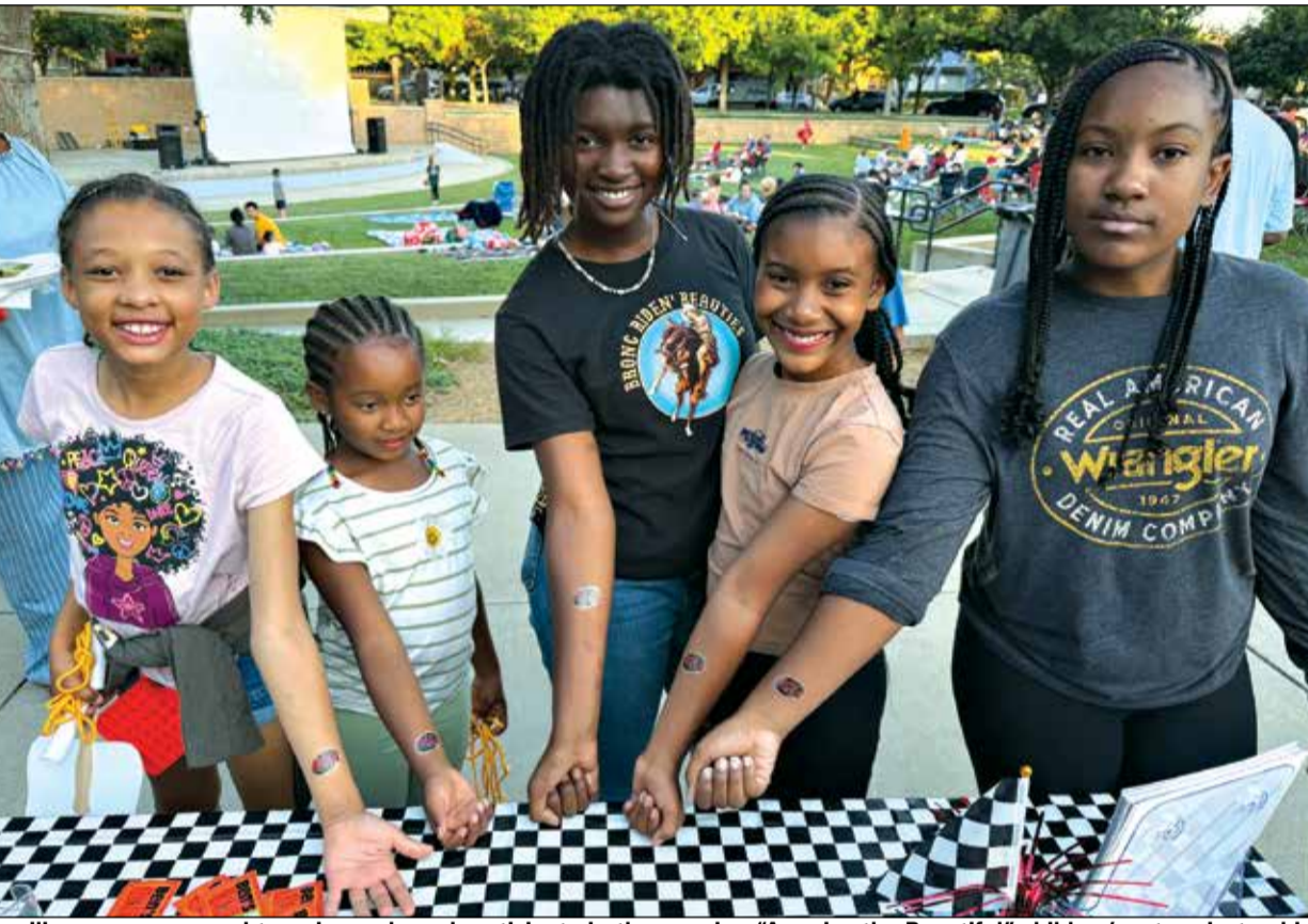
Families are encouraged to arrive early and participate in the ongoing "America the Beautiful" children's art project, which began during Kids Day and will later be featured in a Fourth of July art exhibit.

Moonlight Movies Brings Summer Fun Back to Rancho Cordova