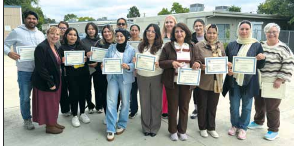
Nearly 400 English as a Second Language students at Folsom Cordova Adult School were recognized for their academic achievement.

Sacramento State Aquatic Center offers spring, summer and fall activities. The center is located at 1901 Hazel Avenue, Gold River. ★