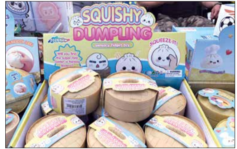
This squishy dumpling toy, sold at My Sister's Gifts, is a trendy toy amongst Gen Alpha.

This event's contest was the final of three contests, with the first one last October and the second one in March. All the winners from the previous two rounds competed against each other, with judges deciding who would ultimately take home the