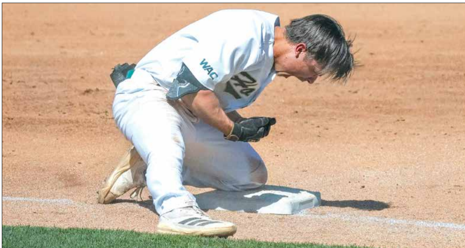
The Hornets, making their first WAC Tournament championship game appearance since winning the crown in 2019, finished their season at 29-32 overall, finishing 3-2 in tournament play.