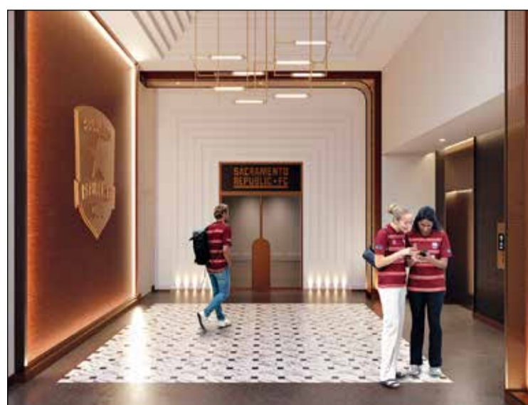
Republic FC's new downtown home will feature two new suite types — 12 Field Suites and 15 Executive Suites — adding to the world-class venue set to open in 2028.

FC's new stadium is a first-of-its-kind premium group experience in Sacramento — an indoor/outdoor, climate-controlled suite for private group gatherings and celebrations, positioned on the West touchline. Completely covered and fully all-inclusive, it places guests at the heart of the action for sports and entertainment