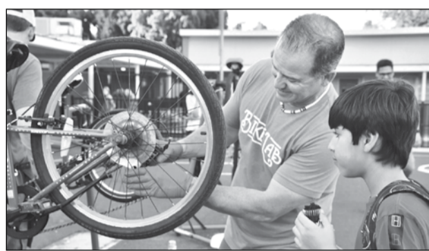
Repair your bicycle for free with Bike Lab during Good Neighbor Day.

RANCHO CORDOVA, CA (MPG) - Residents can meet city officials, connect with local organizations and celebrate community spirit at Good Neighbor Day from 5:30 to 7:30 p.m. June 11 at Dave Roberts Community Park, 10820 Mapola Way. The free event, themed around community outreach and the upcoming 2026 FIFA World Cup, is part of the city's effort to bring government and resources directly into neighborhoods. Attendees can learn about city services and programs while enjoying a variety of family-friendly activities, including a