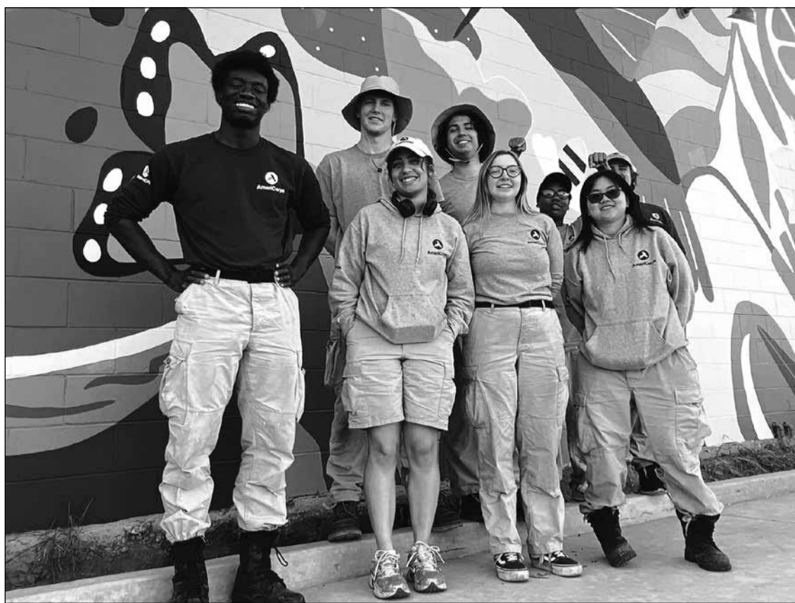
The Rancho Cordova Food Locker is one of the ten nonprofit organizations selected to participate in the inaugural cohort of the Sacramento Countywide Nonprofit Partnership Initiative and reduce stigma around food assistance.