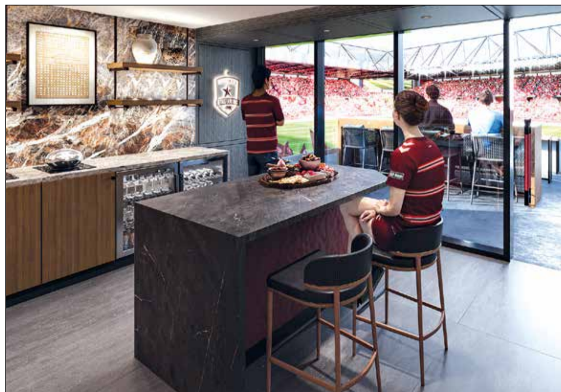
Suite holders will enjoy an unparalleled matchday experience, beginning with dedicated concierge hospitality service and access to premium parking upon arrival.