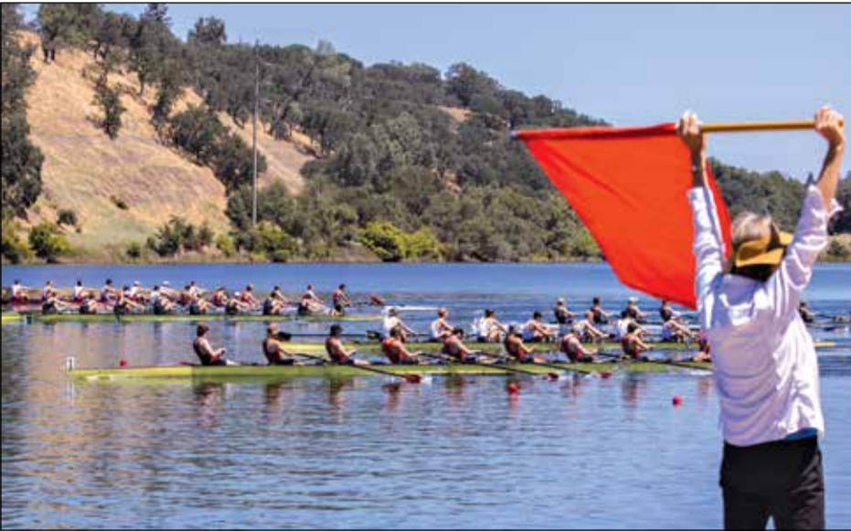
Harvard University men nail a light-weight division championship. The race is among final events in the Intercollegiate Rowing Association regatta at Lake Natoma (Gold River)