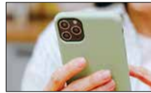
Sacramento County's updated 311 Connect Mobile Application has been launched as of May 29.