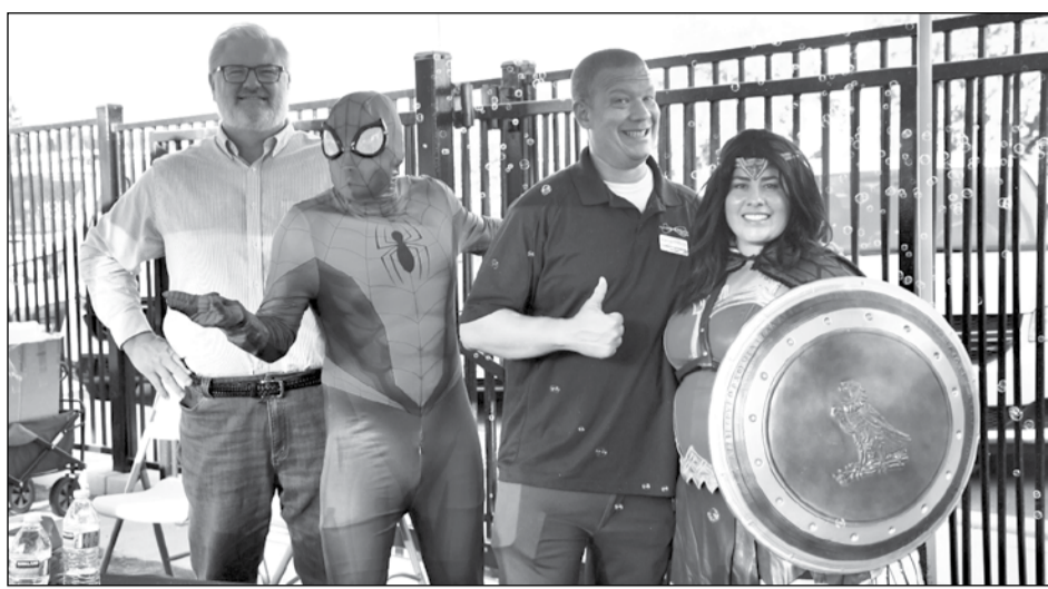
Attendees can learn about city services and programs while enjoying a variety of family-friendly activities.