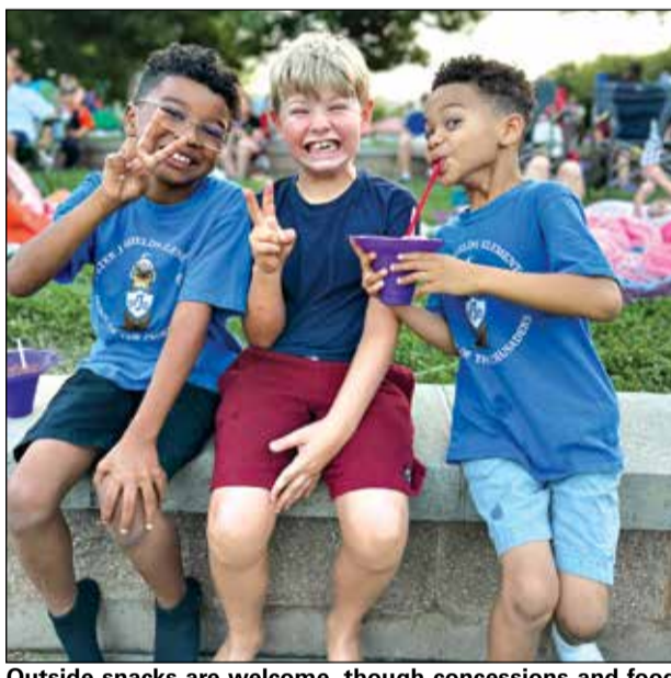
Outside snacks are welcome, though concessions and food trucks will also be available on site.

Hosted by the Cordova Community Council, the annual summer series will feature two films each Friday night