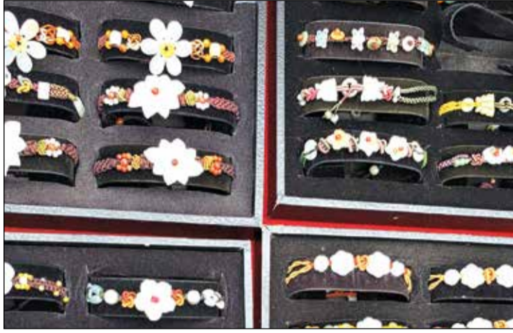
The jade flower bracelets are the bestselling item at Kong's Jade.