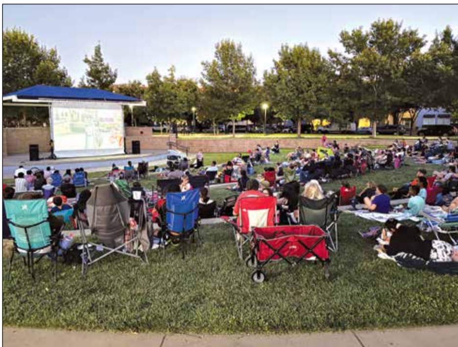
Friday Moonlight Movies returns in June with a monthlong lineup of free double features celebrating America's 250th anniversary.