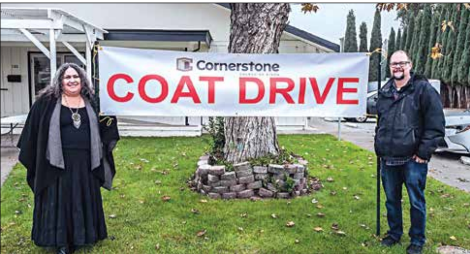
Cornerstone Baptist Church is hosting the Third Annual Dixon Food Pantry Golf Tournament at 8:30 a.m. June 20. Registration costs $125 per person and includes lunch and raffle prizes. Proceeds will benefit the church's food pantry program.

Continued from page 1 participating businesses.