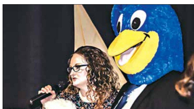
Anderson Parent-Teacher Organization (PTO) was recognized as the 2025 Nonprofit of the Year during Celebrate Dixon March 14, honoring the organization's years of service and support for students, teachers and families at Anderson Elementary School.

For the Color Run, the organization seeks donations from community members and businesses, with proceeds helping fund field trips and student assemblies. The Fall Festival features raffles supported by donated items from local businesses, with funds benefiting classrooms and educational