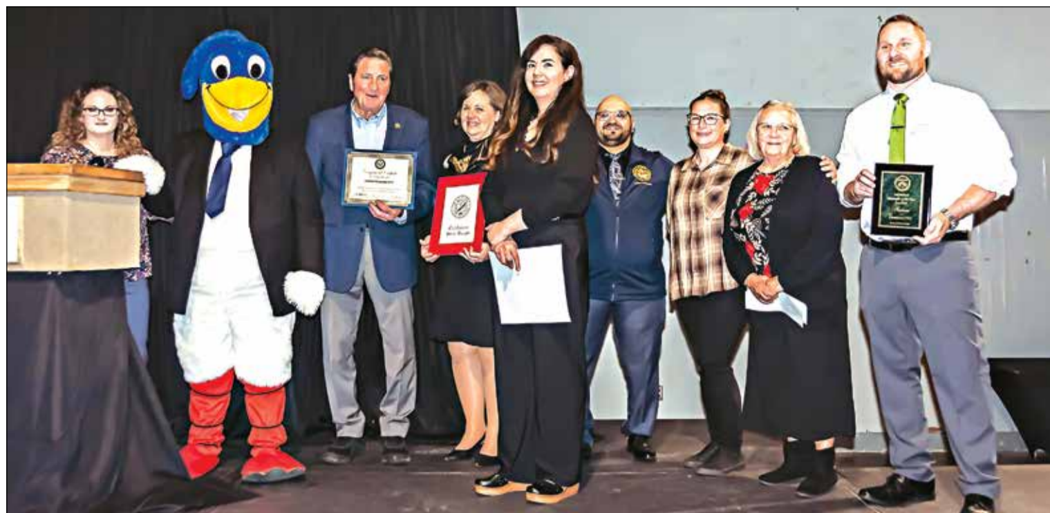
The PTO supports a variety of programs and activities at Anderson Elementary, including assemblies, field trips, classroom resources and schoolwide events.

"I think because we do so much for the students and try to be involved in activities for them to make school the best place for them," she said. "We try to be