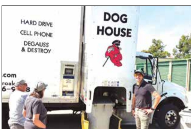
Atkinson Self Storage will host a document shredding event from 10 a.m. to 1 p.m. June 13 at its facility, 1800 N. First St. The service costs $10 per banker-sized box of papers and documents. Both cash and card payments will be accepted.

Downtown Dixon Business Association's (DDBA) summer event season begins with the Downtown Dixon Weekly Farmer's Market, held every Wednesday from 5 to 7 p.m. through Oct. 28. Hosted at Pardi Plaza, 132 E. A St, the event,