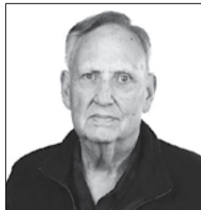
By Dan Walters, CALMatters.org

As Gavin Newsom makes his increasingly frequent appearances outside the state — seemingly preparing for a 2028 presidential campaign — one of his stock messages is that California's economy is soaring.