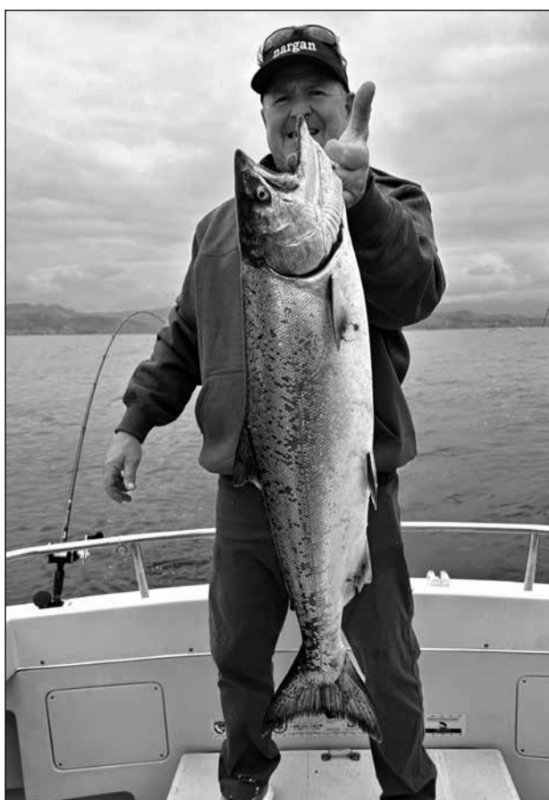
Anglers are always advised to check for updated information when planning an ocean salmon fishing trip. Season dates, bag limits, possession rules and gear restrictions can be found on CDFW's Ocean Salmon Fishery Information page.

Sport anglers can expect to see updates to the recreational catch tracker twice a month throughout the duration of the salmon season. Recreational catch estimates are calculated based on half-month sample periods, broken out into the first half and second half of each month. The recreational catch tracker will be updated following the conclusion of each sample period. Updates may become more frequent when total catch is approaching a harvest guideline. Any notices