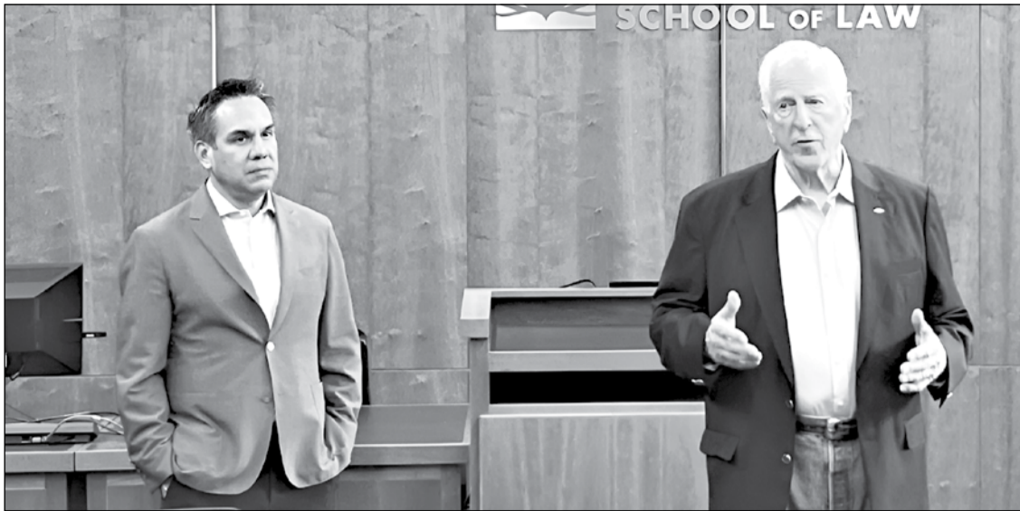
On May 27, Rep. Mike Thompson (CA-04) (right) and Democratic Caucus Chair Pete Aguilar (CA-33) hosted a town hall for students on campus at UC Davis.

“The burden of student debt is crushing our young people. Students shouldn’t have to choose between getting an education and being able to afford rent, groceries or a future,” said Thompson. “I recently introduced the Lowering Student Loans Act to address this directly by capping student loan interest rates at two percent. We must make it affordable to get an