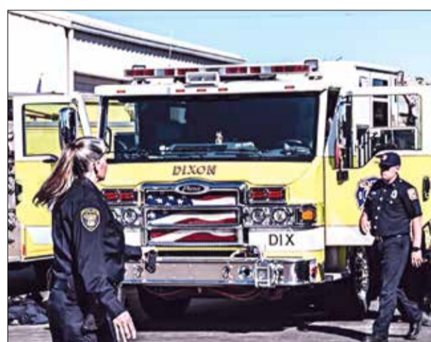
Among his immediate priorities as fire chief are beginning construction of Fire Station 82, filling staffing vacancies and helping develop a long-range master plan for the department.