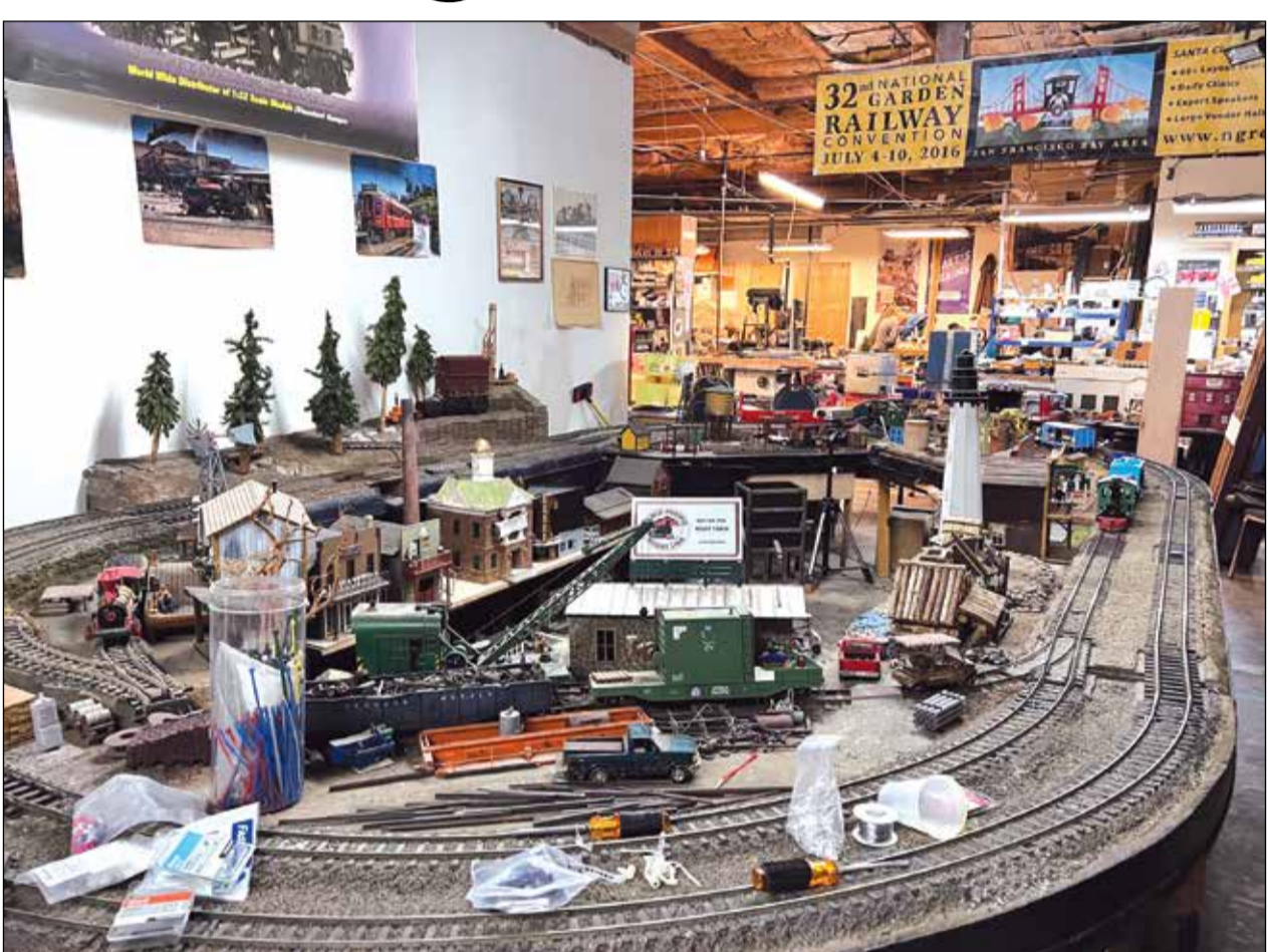
Downtown Dixon Business Association's (DDBA) will host the return of Railroad Days from 10 a.m. to 6 p.m. June 20 and 21 throughout downtown Dixon.