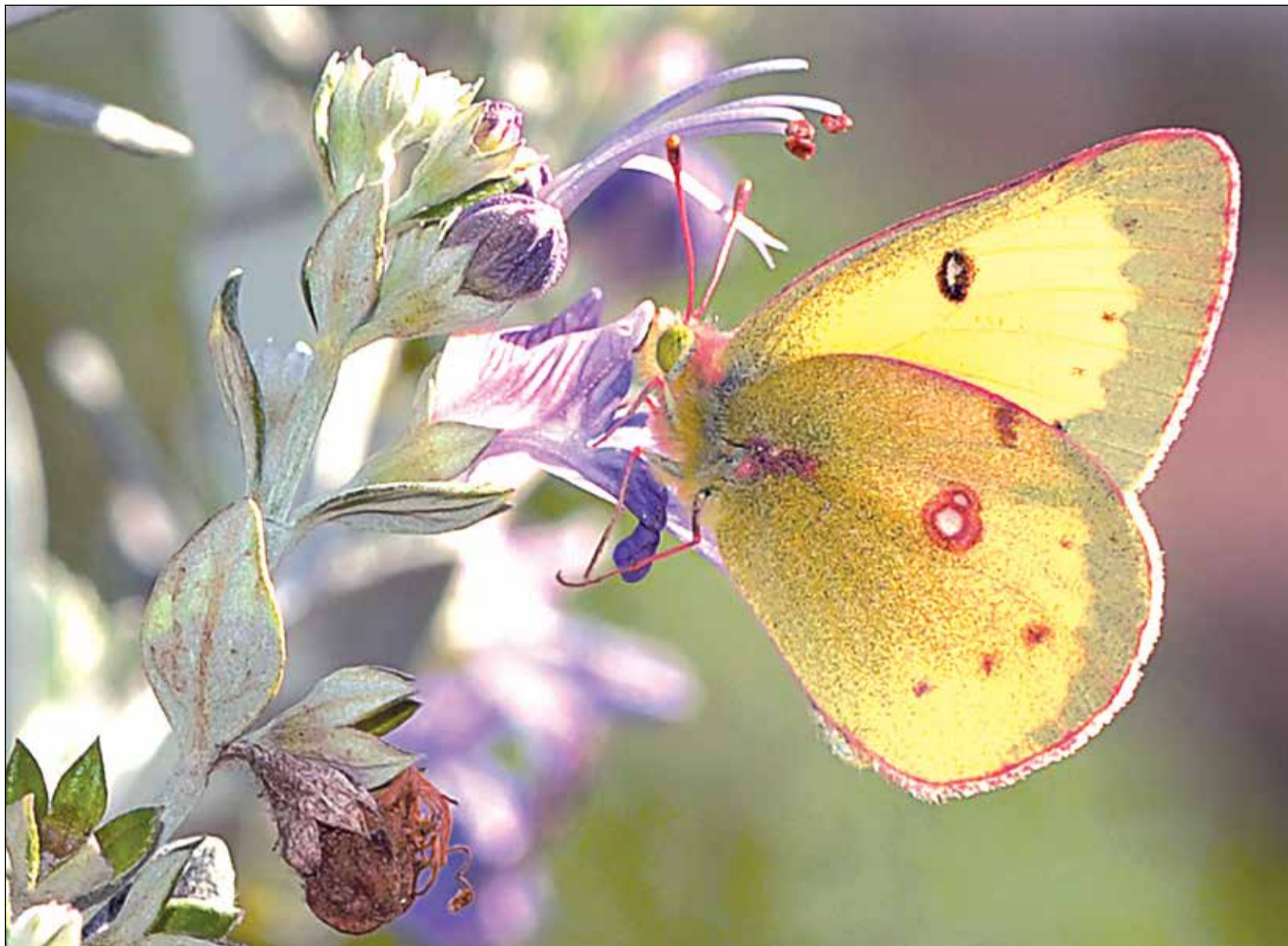
A male orange sulfur butterfly, Colias eurytheme, in the UC Davis Bee Haven.