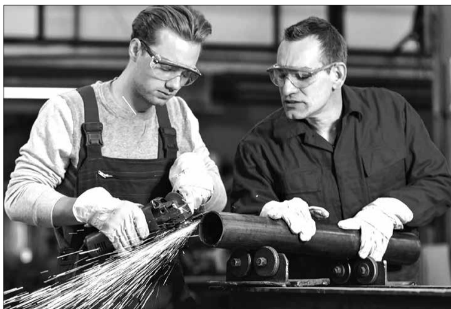
The scholarship program will award eight students with $2,500 each, paid directly to their certified trade school.

eight students with $2,500 each, paid directly to their certified trade school. Six scholarships will be awarded to students in the United States and two to students in Canada.