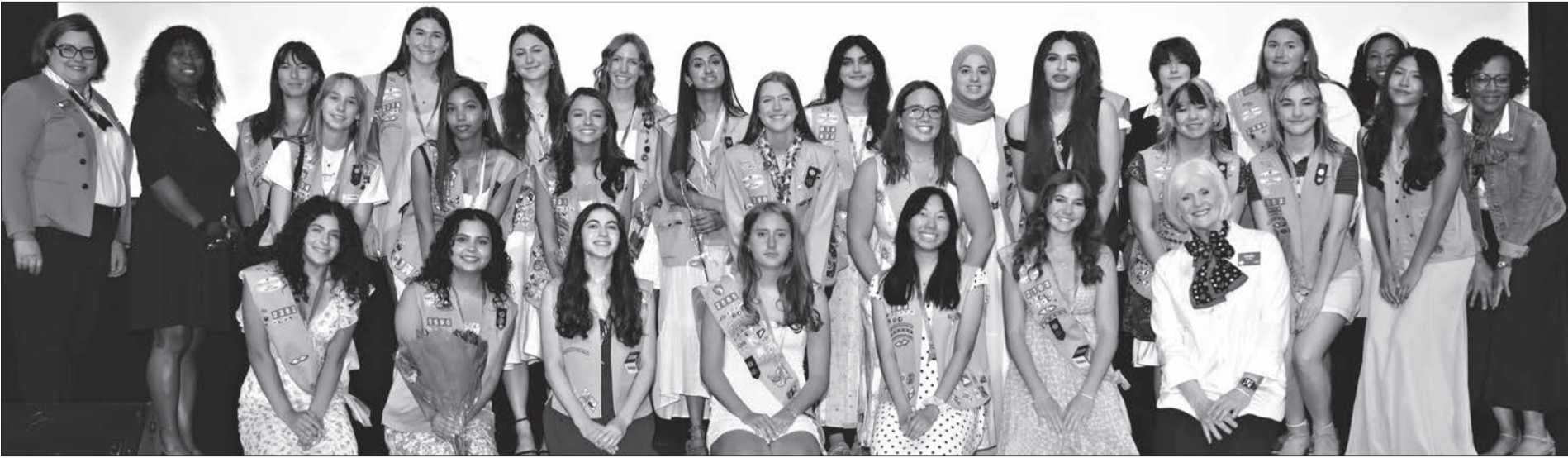
Girl Scouts Heart of Central California honored 167 girls during its annual Highest Awards Ceremony at Hiram Johnson High School Auditorium, recognizing recipients of the Girl Scout Gold Award, Silver Award and the council's Rose Award.