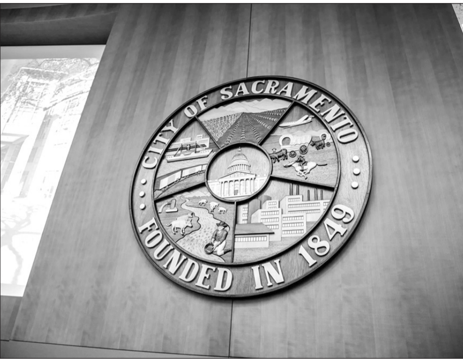
The city recently announced that it took action in support of a new partnership that would bring together elected officials from local jurisdictions and the Sacramento Continuum of Care (CoC) to help guide regional housing and homelessness efforts.