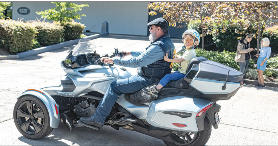
Christian Motorcyclists Association members at Special Kids Day gave motorcycle rides to youth at Depot Park.