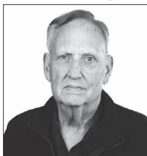
By Dan Walters, CALMatters.org

California's population exploded during and immediately after World War II, from 6.9 million in 1940 to 19.9 million in 1970, thanks to waves of migrants from other states drawn to California's surging economy and the famous postwar baby boom.