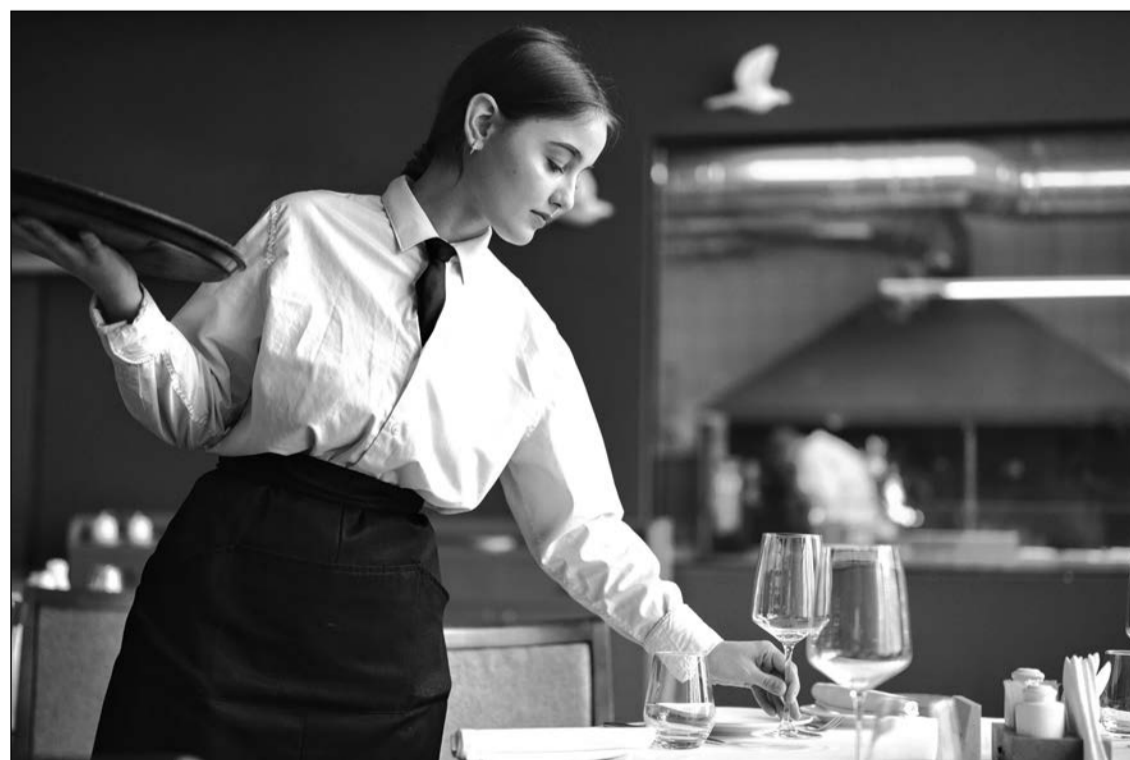
Grants are available to eligible restaurant owners and commercial caterers who are customers of PG&E or SoCalGas, operate in California and meet program requirements, including having one to five locations and annual revenue of up to $3 million at the location for which they are requesting funding. Designed by Magnific

Resilience Fund grants support the most critical areas of restaurant operations, from kitchen equipment upgrades and technology improvements to employee