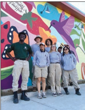
The Sacramento Region Community Foundation and County of Sacramento have announced a Countywide Nonprofit Partnership Initiative to support organizations addressing homelessness and food insecurity across the region.

Sacramento Region Community Foundation News Release