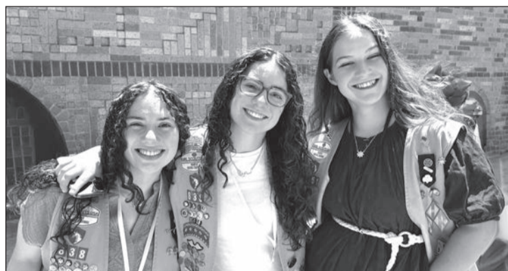
Throughout the ceremony, mentors and family members joined recipients on stage during a pinning ceremony celebrating not only the girls' achievements but also the support systems behind them.

Contreras designed hands-on lessons and experiments intended to continue long after her involvement ended, leaving behind supplies and curriculum