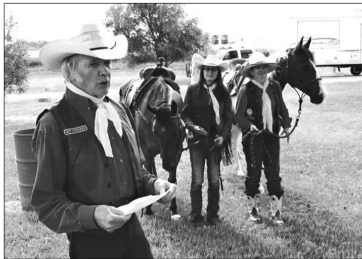
Swearing in Riders in Nebraska.

The continuous relay will pass through Missouri, Kansas, Nebraska, Colorado, Wyoming, Utah, Nevada and California. The public is highly encouraged