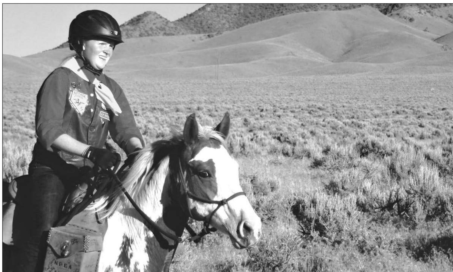
Youth Rider near Cold Springs, Nevada.