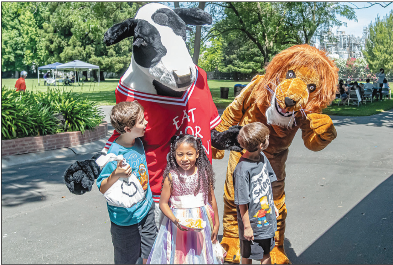
Chick-fil-A Cow and Leo the Lion mascots pose for a photo with kids who finished getting their eyes checked by Northern California Lions Sight Association (NCLSA) during their "Eye Screen for Ice Cream" free vision and health screening.