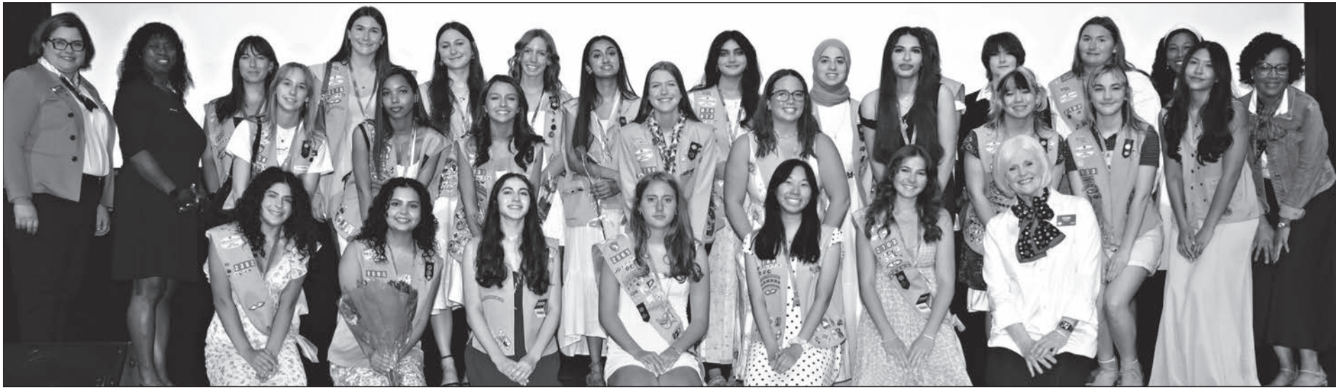
Girl Scouts Heart of Central California honored 167 girls during its annual Highest Awards Ceremony at Hiram Johnson High School Auditorium, recognizing recipients of the Girl Scout Gold Award, Silver Award and the council's Rose Award.