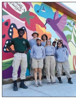
The Sacramento Region Community Foundation and County of Sacramento have announced a Countywide Nonprofit Partnership Initiative to support organizations addressing homelessness and food insecurity across the region.

Sacramento Region Community Foundation News Release