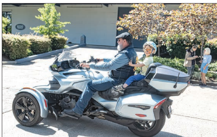
Christian Motorcyclists Association members at Special Kids Day gave motorcycle rides to youth at Depot Park.

Among the booths participating at the May 16 event was A Touch of Understanding Inc., a nonprofit focused on building disability