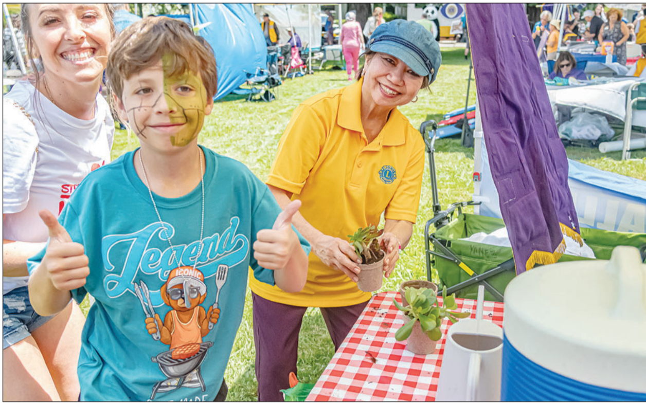
Attendees pictured participating at the Valley Hi Lions Club booth in a planting-related activity at the District 4-C5 Lions Clubs Special Kids Day event on May 16.