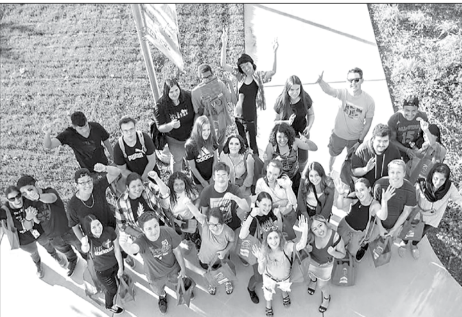
The city-funded program helps eligible recent high school graduates, GED recipients and U.S. military veterans cover college expenses while attending Folsom Lake College.