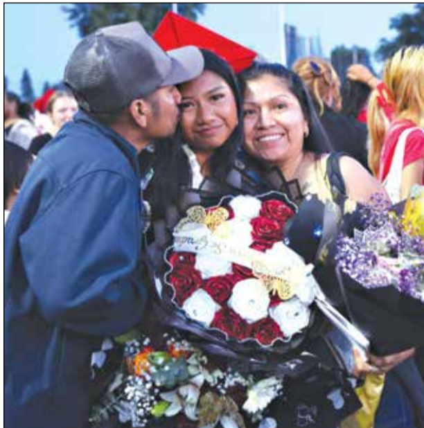
A Cordova High School graduate embraces family members at the 61st commencement ceremony for the Class of 2026 on May 29.