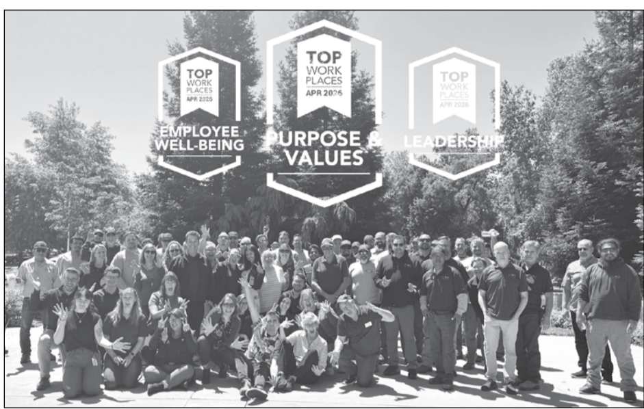
District staff pose at Hagan Community Park. Photo courtesy of Cordova Recreation & Park District

By Shelby Golden, Cordova Recreation & Park District