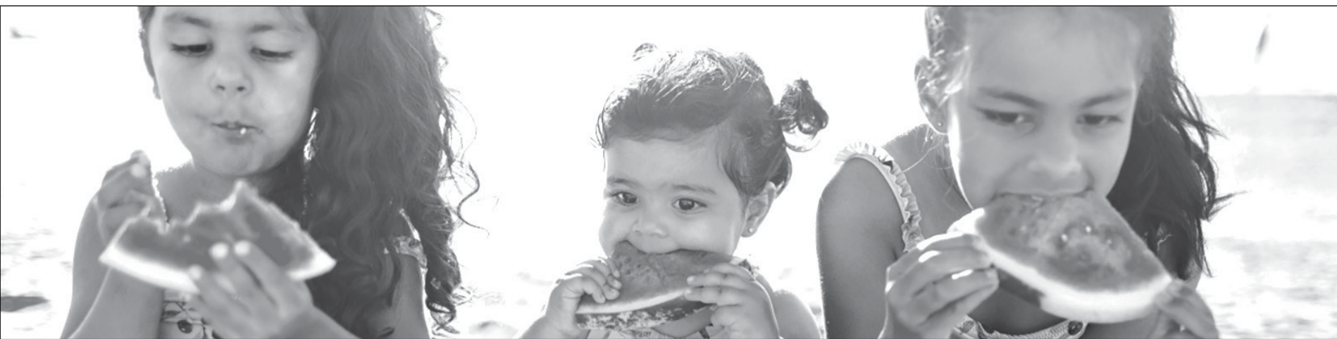
Summer break is a time for fun, family and sunshine, but for many Sacramento County families, it can also mean higher grocery costs while children are out of school.