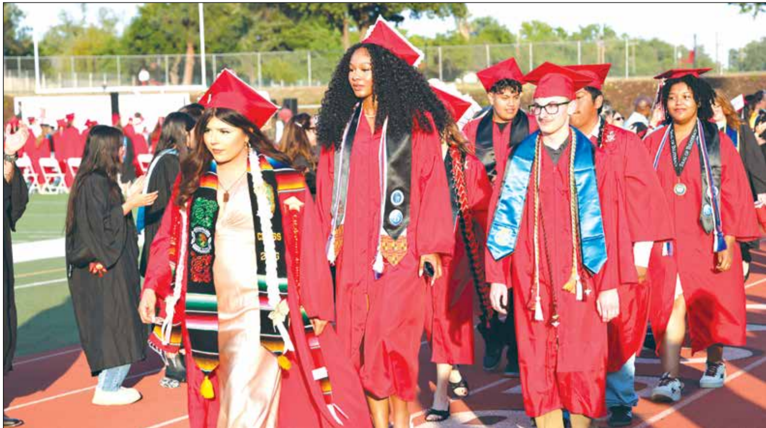
Cordova High School seniors enter the stadium for the 61st commencement ceremony for the Class of 2026 on May 29 in Rancho Cordova.

their passions and make intentional choices about their future.