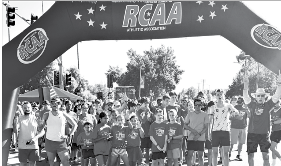
The one-mile run, jog, or walk begins at 9:05 a.m. on Coloma Road, following the city’s parade route through the heart of Rancho Cordova.