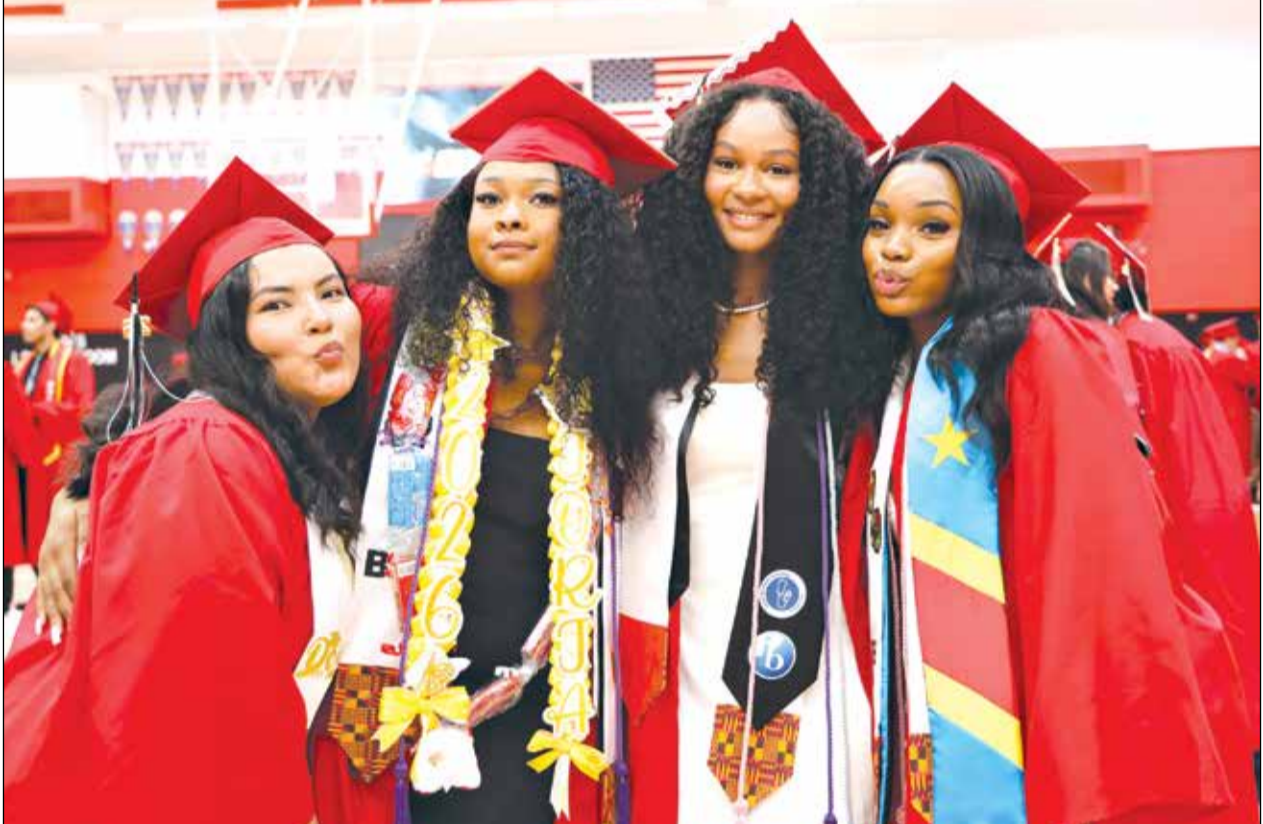
A group of Cordova High School seniors celebrates during the 61st commencement ceremony for the Class of 2026 on May 29 in Rancho Cordova.