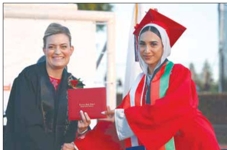
Graduates moved across the stage one by one, met with applause from families, teachers and friends.

“The worst moments of your life as you experience them have a good chance of turning into one of the best things to ever happen to