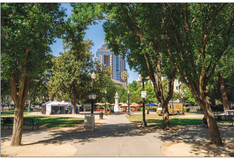
The city has opened a survey available to the public until July 24 for residents to be part of the renaming process for Cesar Chavez Park at 910 I St.