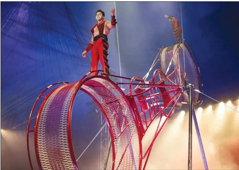
Circus attendees can expect edge-of-your-seat stunts including the Wheel of Danger.