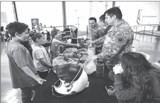
Attendees fanned out across dozens of interactive exhibits showcasing the breadth of aviation and aerospace careers. Photo courtesy of the California Capital Airshow

Hundreds of families from across the region experience aviation and STEM up close at Mather Airport