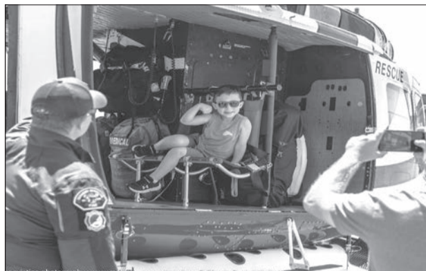
Positive Altitude is one of the free youth STEM programs the California Capital Airshow produces each year.