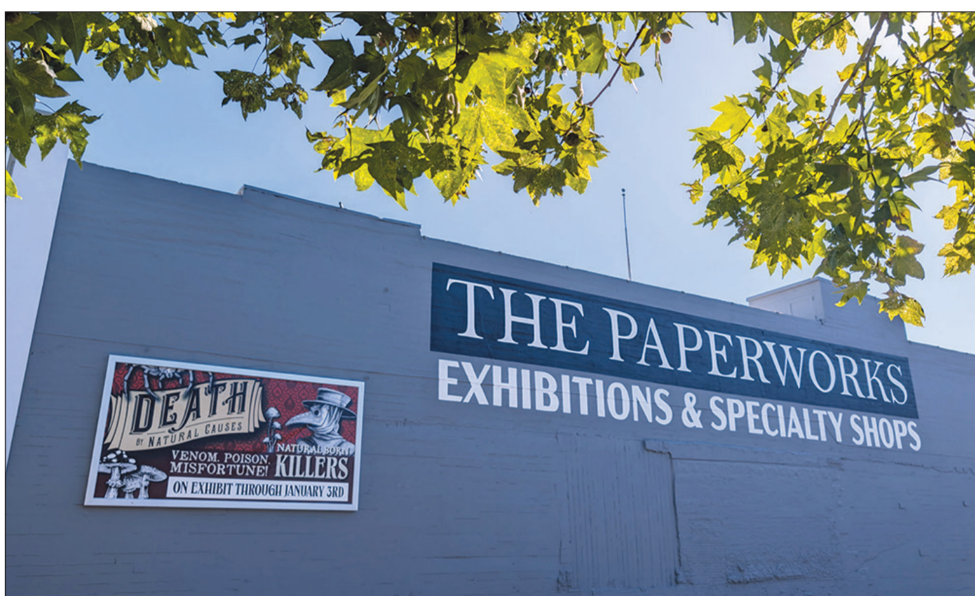
Stage Nine has announced the opening its latest renovation endeavor, The Paperworks building in Old Sacramento, and the coinciding debut of a traveling exhibition titled "Death by Natural Causes" on June 27.

The Paperworks building is currently home to the following local businesses, many of which are owned by first-time entrepreneurs: Back Door Lounge on the underground level (entrance in Firehouse Alley) and on the street level (entrance on Front Street) includes Big VIP Clothing, Carnal Flora (opens Aug. 2), DearSisa Boutique, EcoPress Sacramento (opens June 27), Panopoly Fine Art (opens June 27), The Paperworks Shop (opens June