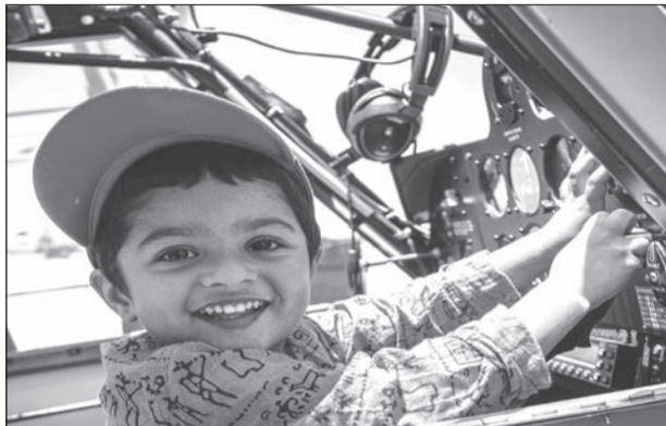
Young visitors got up close with aircraft and equipment.