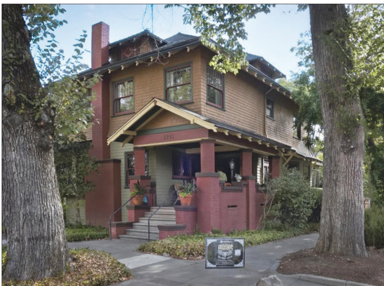
The Remick House, a 1908 Craftsman on 22nd Street, was part of a previous Historic Home Tour.

For advance tickets, visit preservation-sacramento-44.wildapricot.org/event-6731534 . For more about the tour, visit preservationsacramento.org/etour . ★