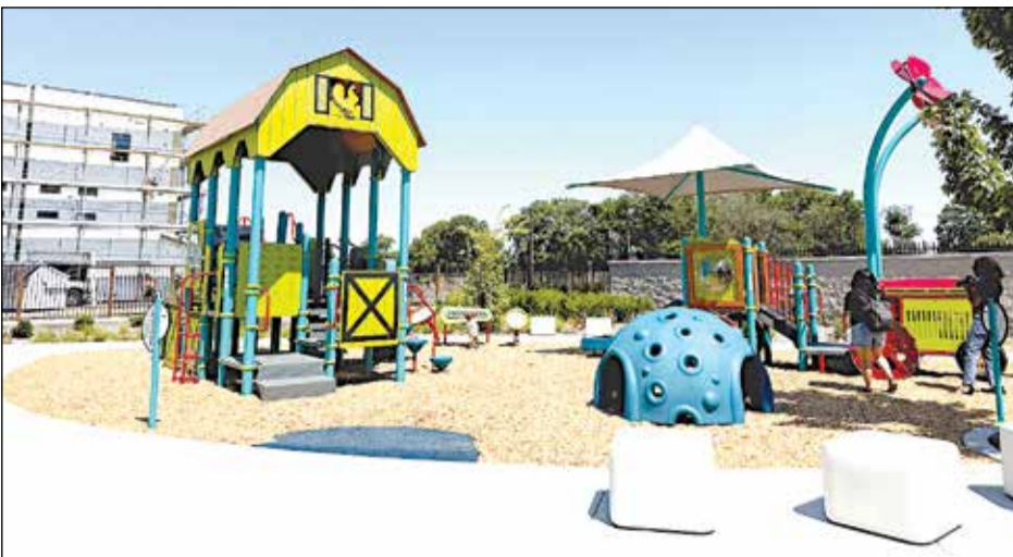
The park features lawn space, shaded picnic spaces, a children's playground and a public art installation by local artist Roger Berry.

Continued from page 1 which plans to bring 106 new homes, new sidewalks, lighting, landscaping and recreational amenities to West Sacramento. For more information, visit: https://blackpinecommunities.com/communities/four-40-west/index