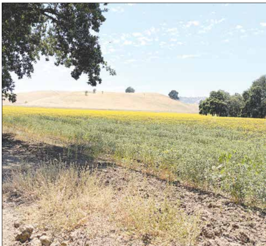
Proposed reductions to funding for California's Sustainable Agricultural Lands Conservation (SALC) Program threaten future opportunities to permanently conserve working farms and ranches in Yolo County.

SALC is a win for climate, food security, farmers and ranchers, and