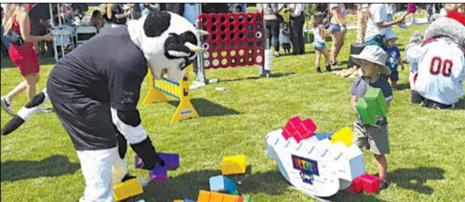
Mascots Dinger (River Cats) and Mooie (West Sacramento) engage with children at the park opening.