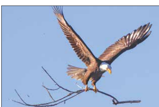
Hauling lumber and grasses from across the American River in spring, the bald eagles build and abandon two eyries before settling on a more secluded nesting tree by summer.

From below a leaning bluff tree I watched