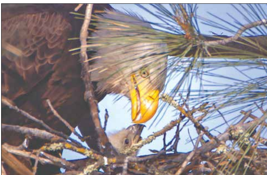
Brief bliss in the 2026 nursery. The bald eagles' 22nd and 23rd eaglets would both perish from causes unknown.

Nature can seem cruel: infant mortality is common among wild animals. But our national bird is a resilient creature. The species regenerated from near extinction after the 1970s. Our parents