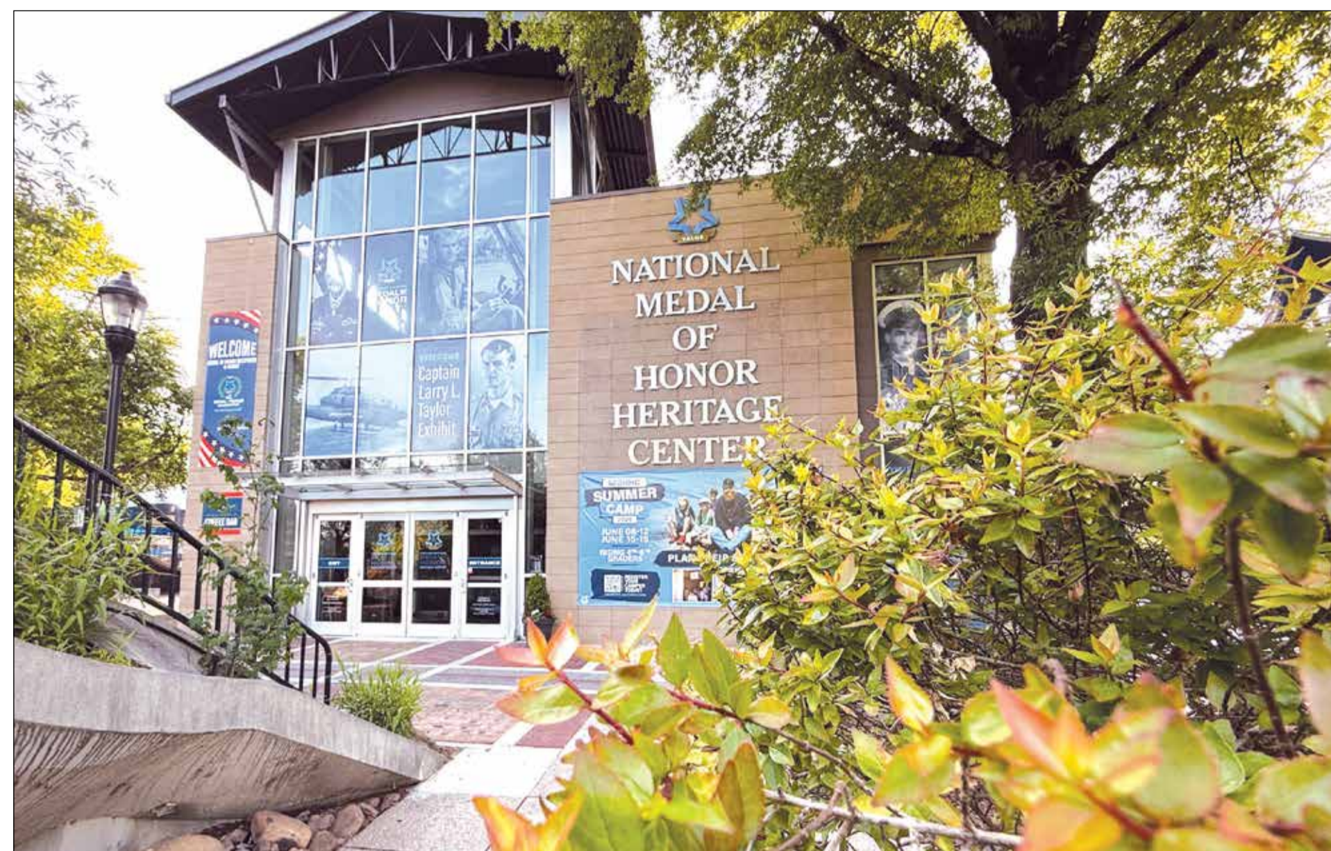
The striking facade and prominent window displays of the National Medal of Honor Center, welcoming visitors to the museum dedicated to the nation's highest military decoration in Chattanooga, Tennessee.