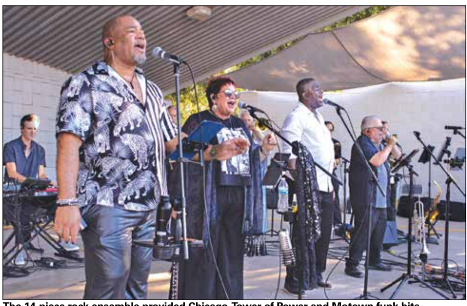
The 14-piece rock ensemble provided Chicago, Tower of Power and Motown funk hits.

The concert ended Carmichael Park District's offering of eight spring-to-summer rock events. The series also included a weekend of symphonic