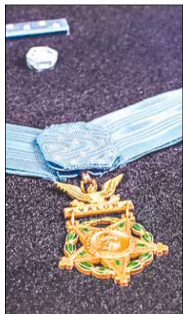
An acknowledgment for selfless duty, the Medal of Honor stands as the ultimate testament to courage under the most extreme circumstances.