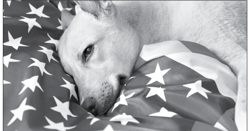
Keep pets indoors before celebrations begin and create a safe, quiet space with their favorite bed, toys and water.

Continued from page 1 Friday, Saturday and Sunday from noon to 5 p.m., and Wednesday from noon to 6 p.m. It is closed Mondays and Sacramento County holidays. You can also view lost and found pets online before heading to the shelter. ★