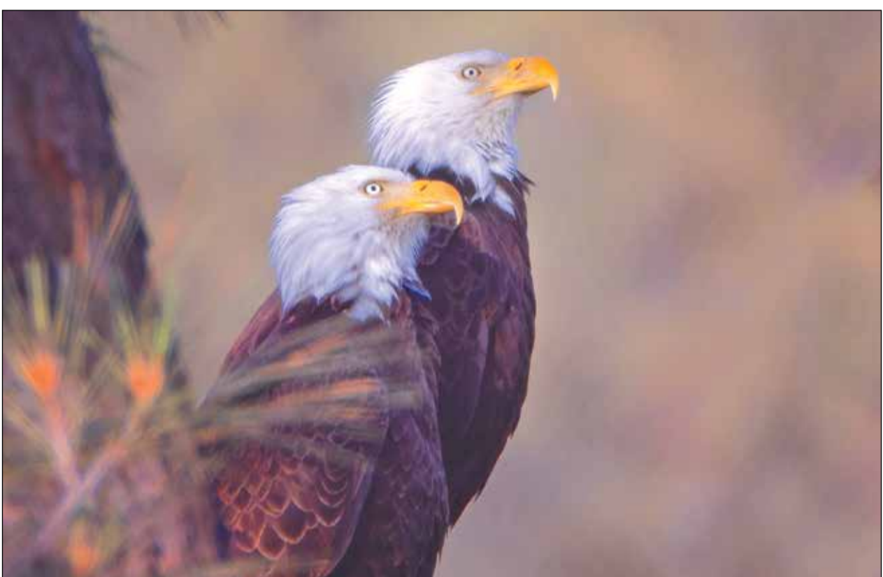
Indomitable. The fall of a nesting tree, then the loss of two hatchling eaglets spurs an American River bald eagle couple to regroup and rebuild for the future.