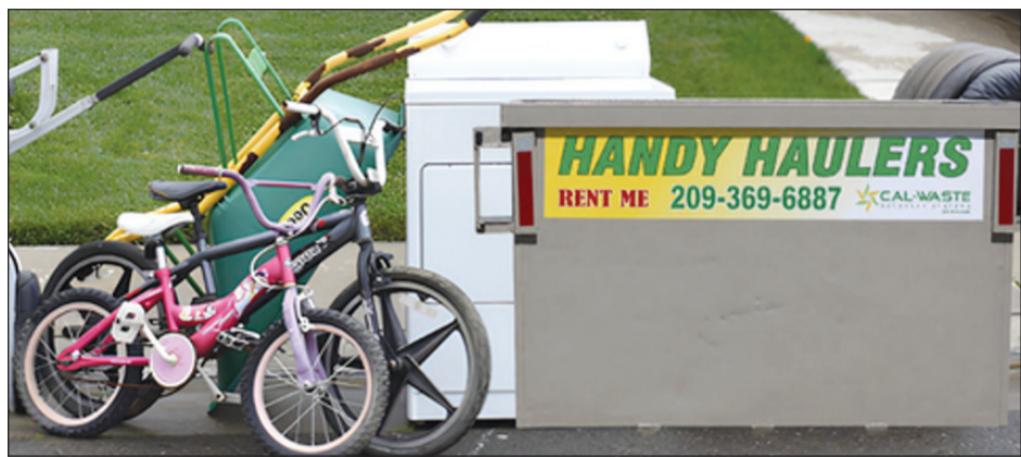
The city shared in its latest newsletter that residents have access to a free annual Handy Hauler and Bulky Item Pickup service through Cal-Waste for items including clothing, toys, books, furniture, mattresses, appliances and exercise equipment.