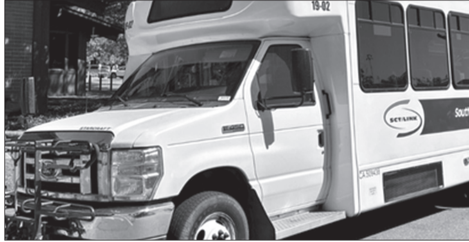
The city shared in its latest newsletter that the South County Transit (SCT-Link) has new updates in effect for its HWY 99 and Dial-A-Ride services, which now includes medical trips and later operating times.