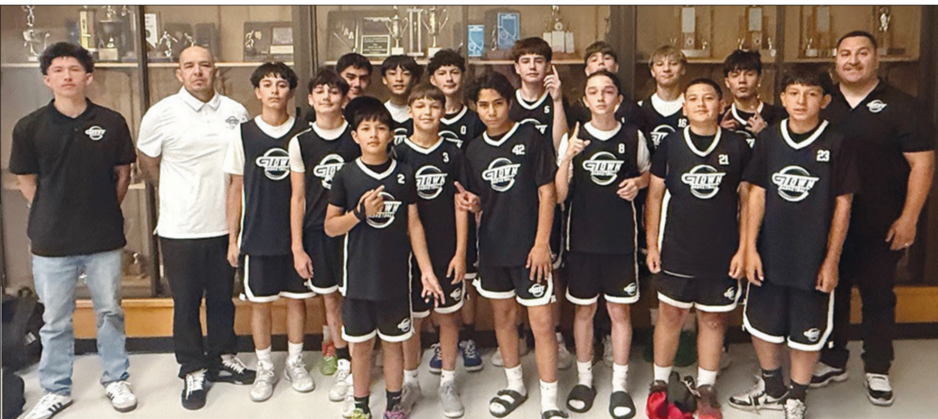
For the second straight season, GTown Basketball headed to Reno on Memorial Day weekend to represent our town, uniting youth players from Galt High School and Liberty Ranch High