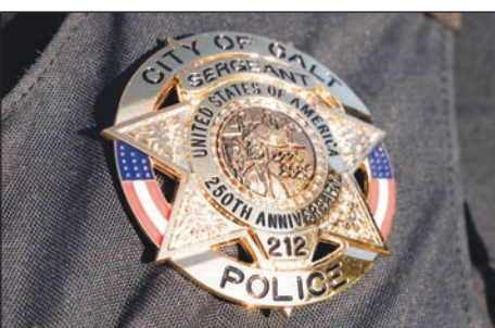
Pictured is the commemorative badge Galt Police Department officers will have the option of wearing over the next year in recognition of America's 250th anniversary.

As we celebrate 250 years of the United States, we're proud to honor where we've come from while continuing our commitment to those we serve. ★