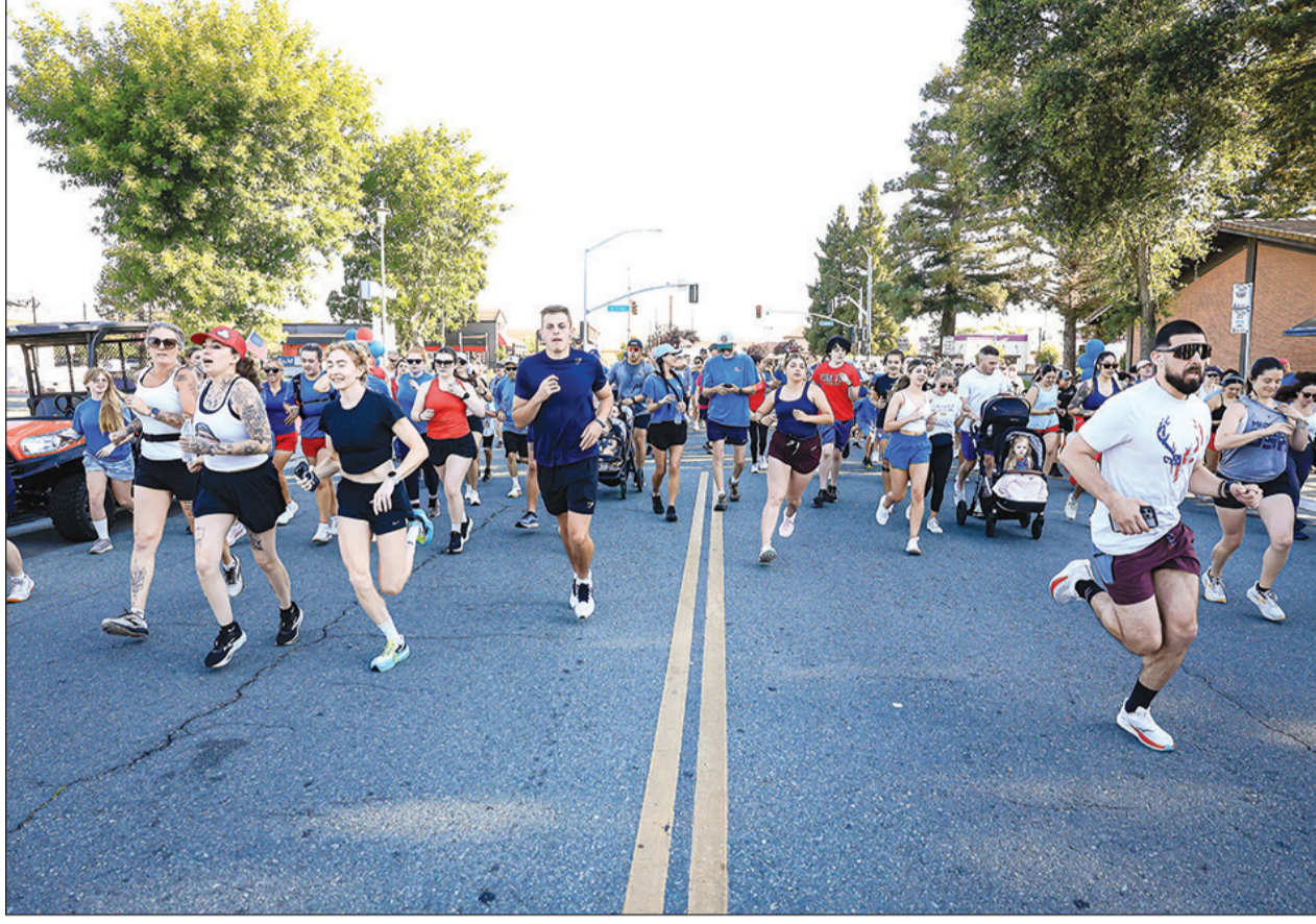
Runners leave the starting line on Civic Drive.