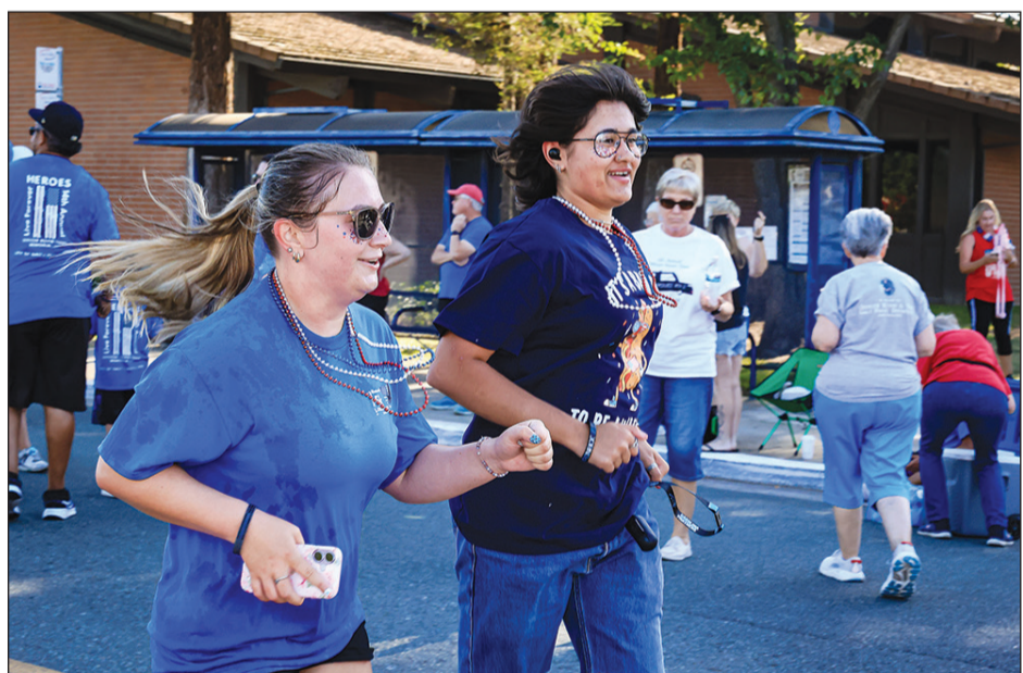
Runners finish the race.