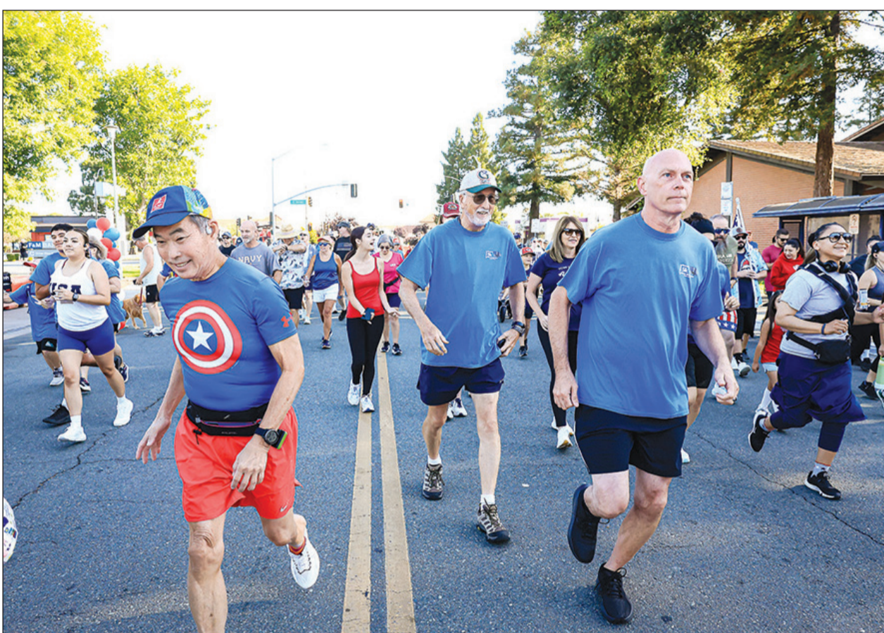
And they are off ... 150 runners begin at once.