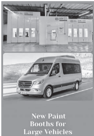
New Paint Booths for Large Vehicles