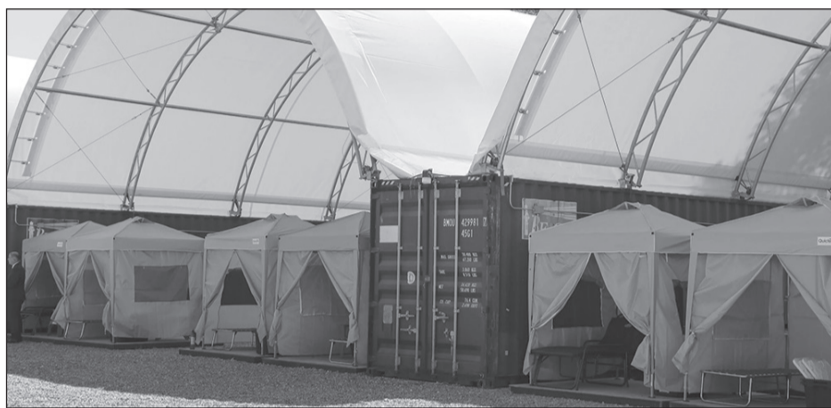
The new Safe Camping site features city-provided tents on raised platforms beneath covered structures designed to provide sun and rain protection. It also includes showers, restrooms, dog kennels, phone charging stations, a gathering space and 24/7 security.

The 2026 Point-in-Time Count found a 19% reduction in unsheltered homelessness within the city compared to 2024, representing nearly 600 fewer people living on Sacramento streets.