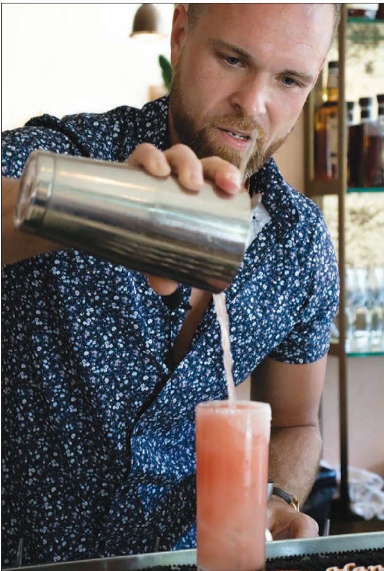
More than 15 bars, restaurants and lounges will offer discounted drinks every Wednesday during Sunset Sips, downtown's summer happy hour program, now through Sept. 30.