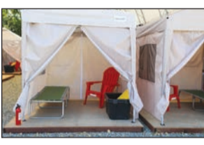
A new Safe Camping site at 291 Sequoia Pacific Blvd. is serving approximately 100 people experiencing homelessness, expanding the city's shelter and service options.