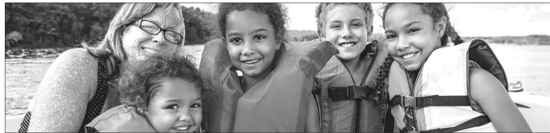
As temperatures rise and families look for ways to stay cool, Sacramento County reminds parents and caregivers that water safety should be a top priority throughout the summer months.