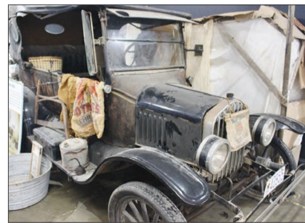
A display of a vintage Ford Model T automobile at the California Automobile Museum as part of its Route 66 exhibit.

Although many may not recognize Lange's name or know the identity of the "Migrant Mother," they recognize the face as a wordless testament to the hardships endured by travelers and migrants during a defining chapter of American history. ★