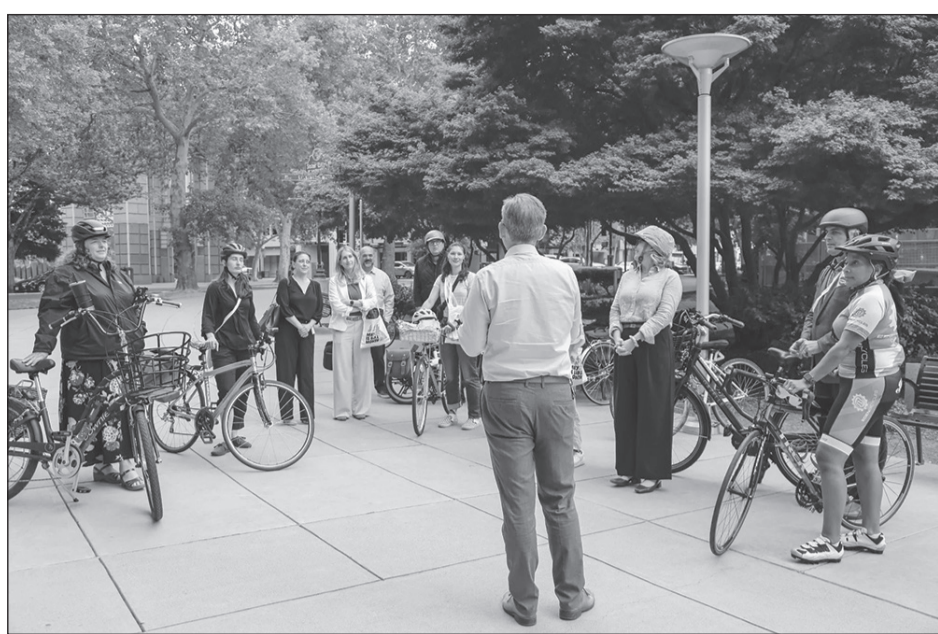
The city is offering residents free classes on how to confidently ride their bicycles and scooters through the streets of Sacramento's urban neighborhoods throughout the summer. No bicycle or scooter is required to attend.

"Our goal is to make it easier for more people to feel comfortable choosing active transportation