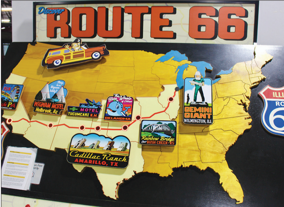
This display board at the California Automobile Museum is a great place to start a tour of the Route 66 exhibit.

Many Black travelers in the West avoided small towns and preferred larger cities, but even there the accommodations were limited. In Albuquerque, New Mexico, only six of the