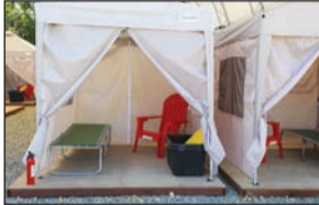
A new Safe Camping site at 291 Sequoia Pacific Blvd. is serving approximately 100 people experiencing homelessness, expanding the city's shelter and service options.