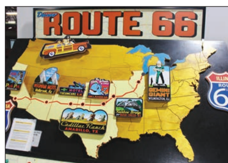
This display board at the California Automobile Museum is a great place to start a tour of the Route 66 exhibit.

For more than 40 years, America's most iconic Dust Bowl migrant remained