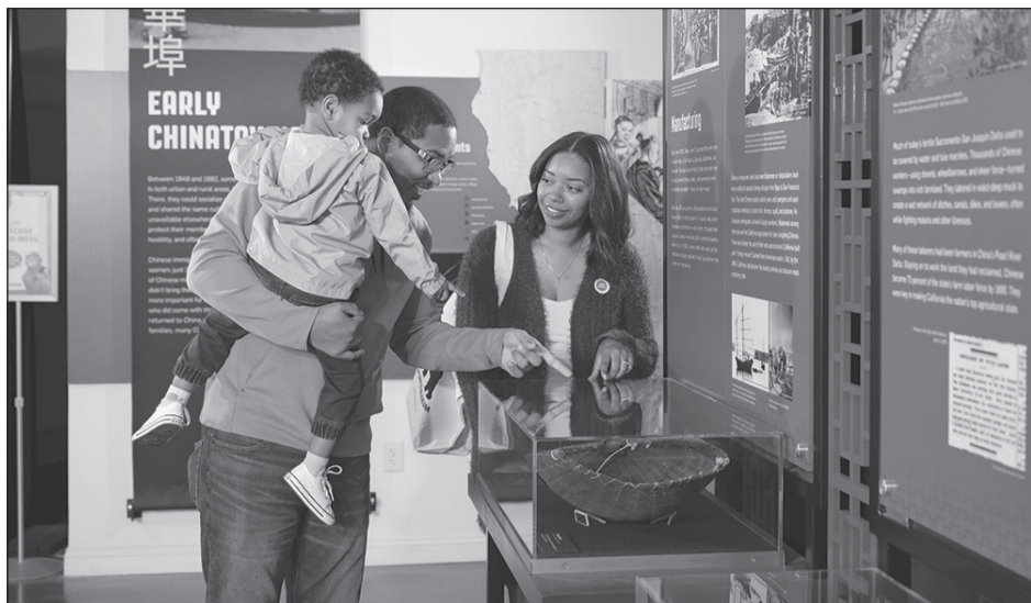
The California Museum, 1020 O St., announced several exhibitions and events that are happening now through September.

Stop by and explore our new temporary exhibit, "Reflecting on the Land," on its opening