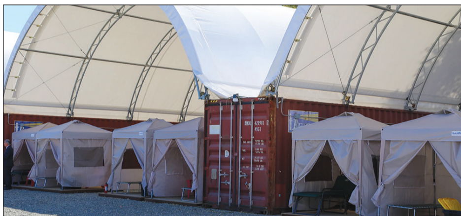
The new Safe Camping site features city-provided tents on raised platforms beneath covered structures designed to provide sun and rain protection. It also includes showers, restrooms, dog kennels, phone charging stations, a gathering space and 24/7 security.

Since 2024, the city has added more than 500