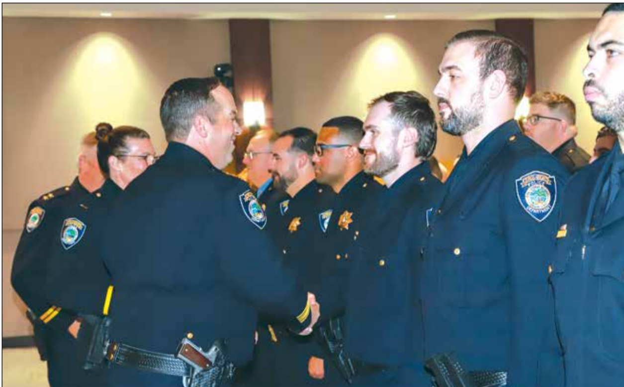
The Citrus Heights Police Department marked its 20th anniversary with a celebration that was not only a milestone event, but also a reflection on a promise made to a newly formed city two decades ago.

Citrus Heights Police Department celebrates milestone