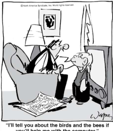
GRIN AND BEAR IT