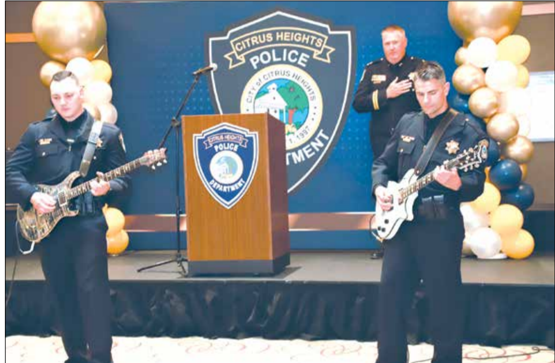
Citrus Heights Police officers perform the national anthem during the departments 20th anniversary on June 26.

as a partner in this community," she said.