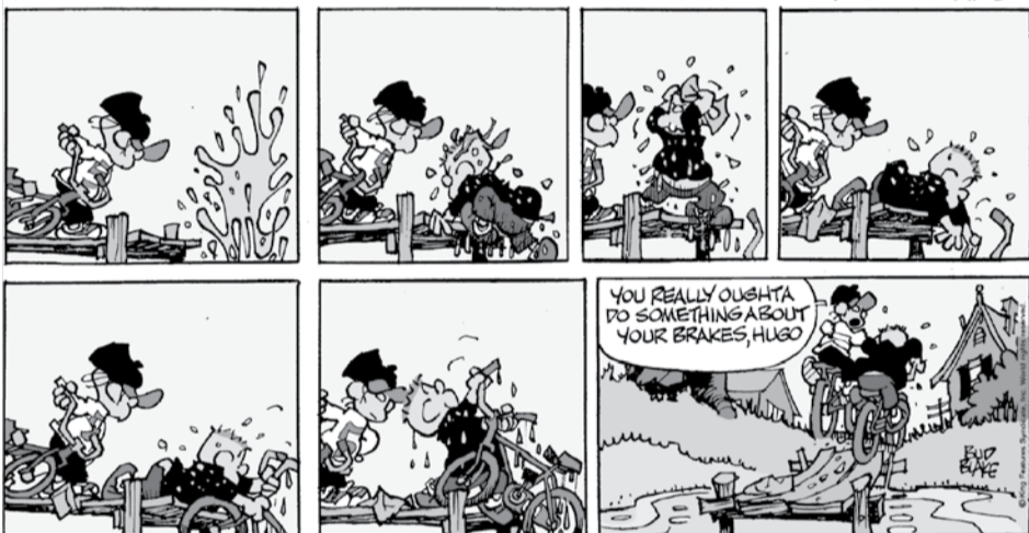
by BUD BLAKE