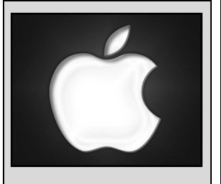
May 10, 2017 Apple becomes the first company to be worth more than $800 billion.