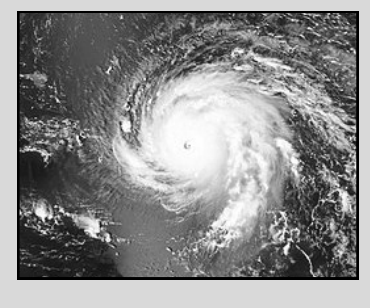
September 5, 2017 Hurricane Irma becomes the most powerful Atlantic Ocean hurricane in recorded history with winds of 185mph.