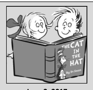
June 3, 2017 The Amazing World of Dr. Seuss Museum opens in Springfield, MA.