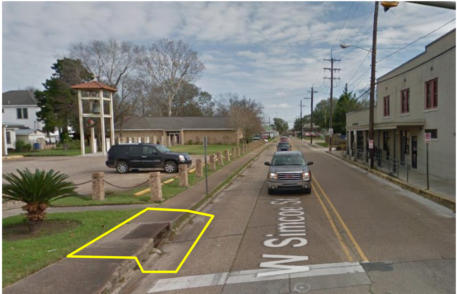
Simcoe at St. John