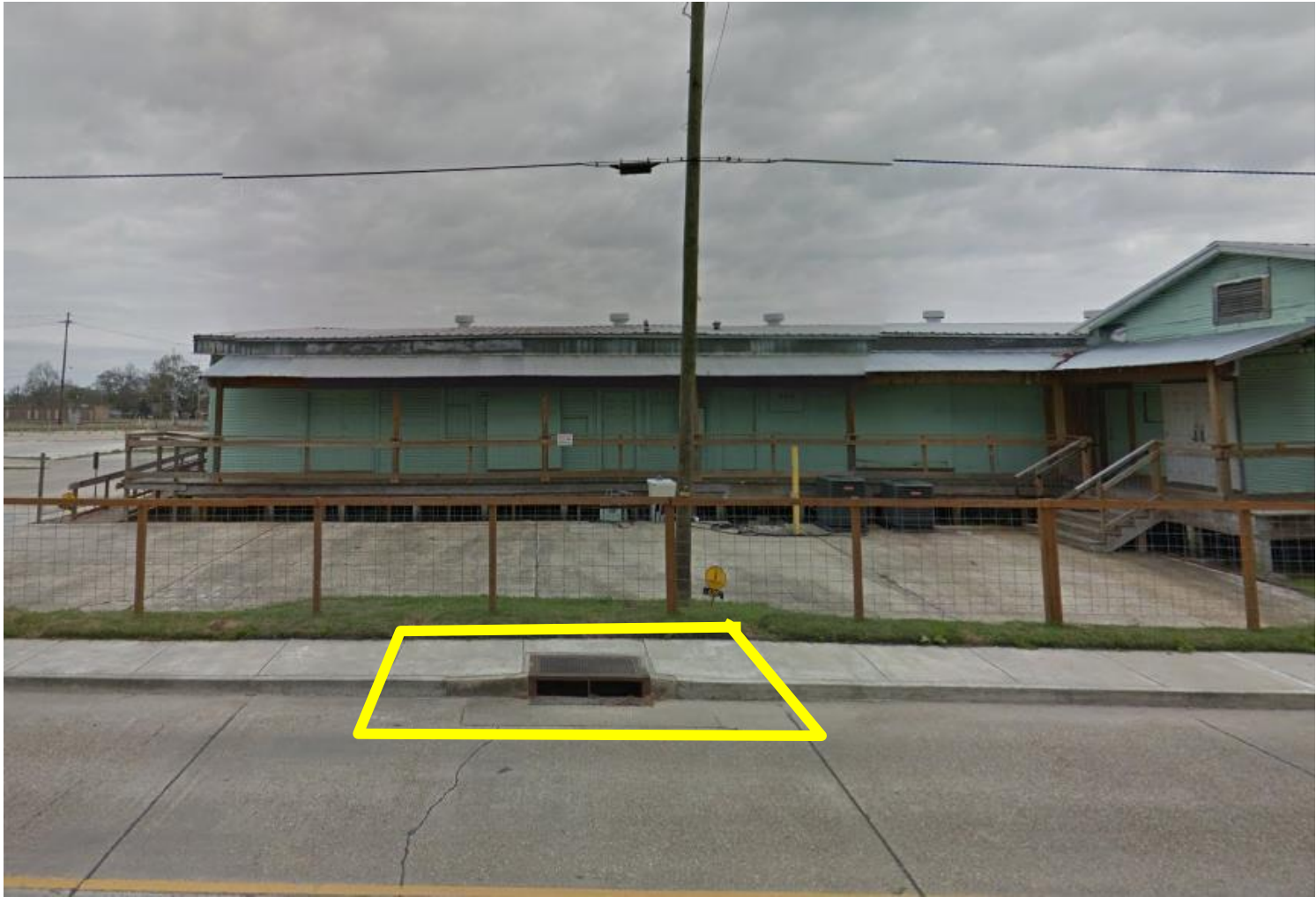
Garfield at Warehouse 535