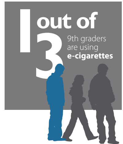
Percent of teens in Cook County using various forms of tobacco, 2016

THE BAD NEWS IS NEARLY 1 IN 3 NINTH GRADERS ARE USING E-CIGARETTES