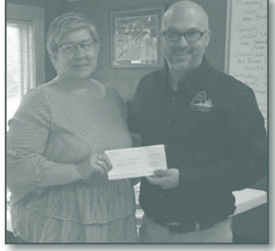
Grand Portage Elderly Nutrition Program