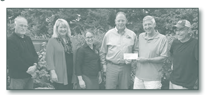
Boreal Community Media

Grand Marais Lionesses), the Gunflint Canoe Races (to raise money for the