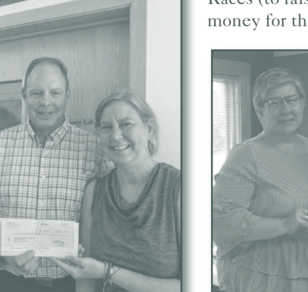
Cook County Higher Education

We want to congratulate our community partners and wish them well!