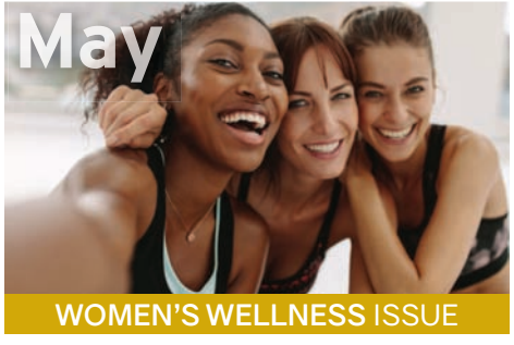
Autoimmune Breakthroughs Plus: The Collagen Connection