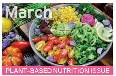
Thriving on a Plant-Based Diet Plus: CBD