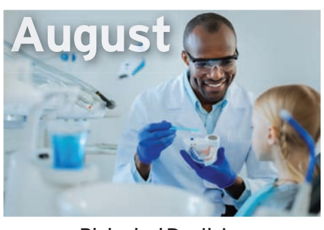
Biological Dentistry Plus: Environmental Education