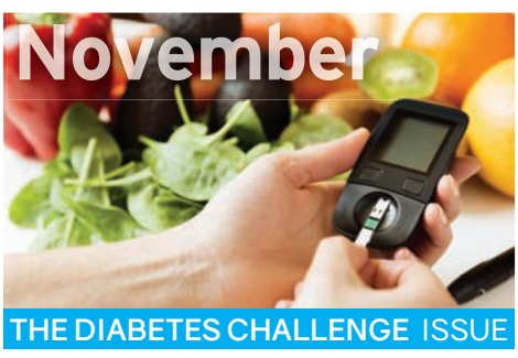
Personalized Diabetes Strategies