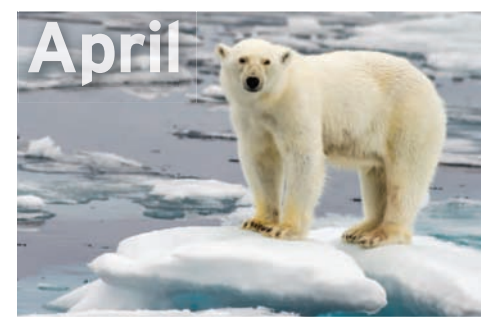
Grassroots Climate Crisis Strategies Plus: Healthy Home