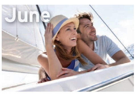
Inspired Lifestyle Travel Plus: Brain Health