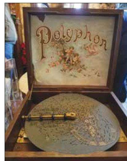
One of nine working Magical Music Boxes that are currently on display at the Lake County History Center.

Visit lakehistorycenter.org or call (440) 639-2945 for more info.