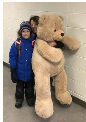
A fun way to end the day is saying goodbye to a big cuddly teddy bear!