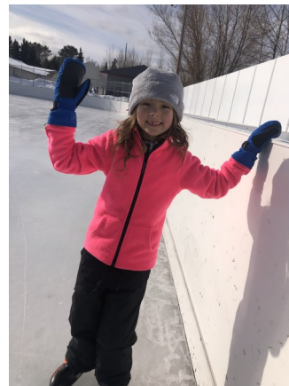
The 1st graders went ice skating and had a lot of fun!