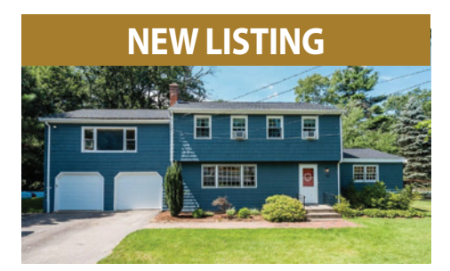
142 Longhill Road Franklin, MA $479,900

Two great Franklin offices are now under one great name! LAER Realty Partners, is now proudly the largest independent brokerage in Franklin!