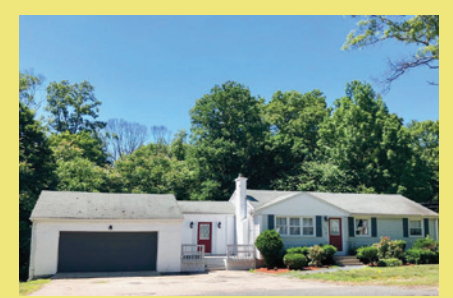
1076 S. Main St Bellingham