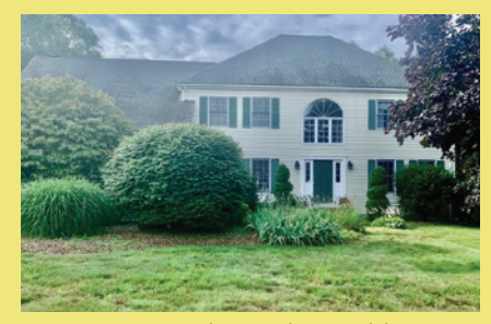
1 McKinley Rd Franklin