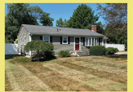
9 Priscilla Rd Medway