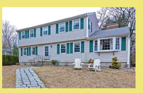
492 Old Farm Rd Franklin