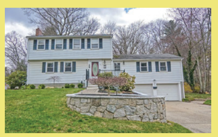
20 Mackintosh St Franklin