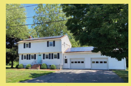
20 School St Easton