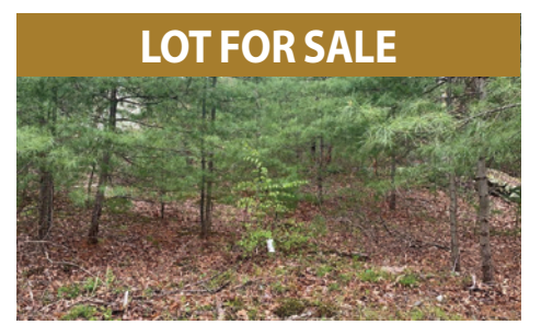
201 Wampum Street Plainville, MA $289,900