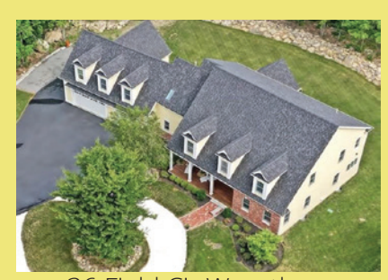
36 Field Cir Wrentham