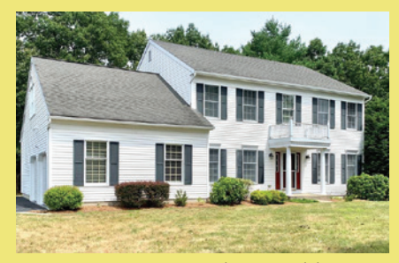
Non-MLS Sale Franklin