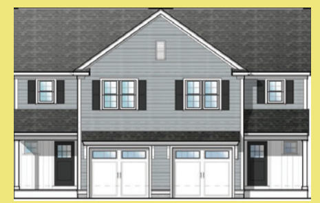
55 & 57 A St Franklin