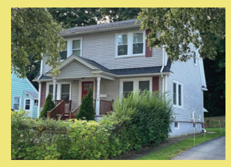
14 Varnum St Worcester