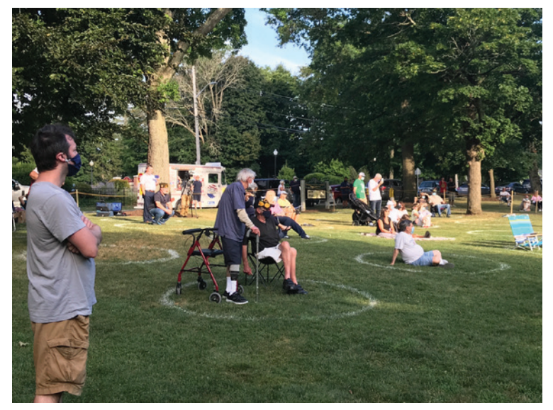
Purple Heart recipients who attended the ceremony on August 7th were invited to stand and be recognized by their community for their sacrifices.

To learn more about Franklin American Legion Edward L. Grant Post 75, visit www.mapost75.com.