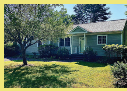
84 Barrows St Norton