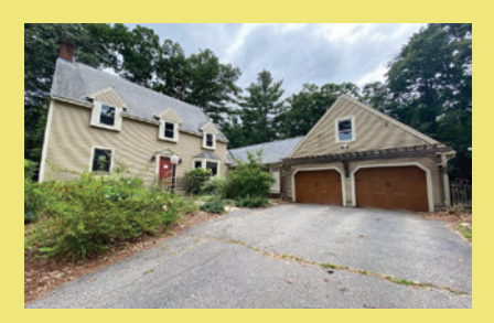
80 Bennett St Hudson