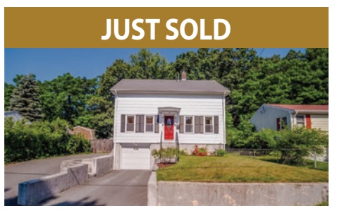
39 Greenville Road North Smithfield, Rhode Island