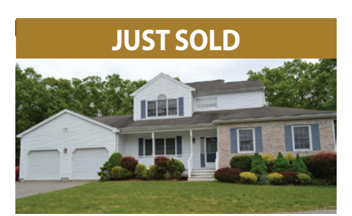
8 Oak View Terrace Unit 8 Franklin, MA