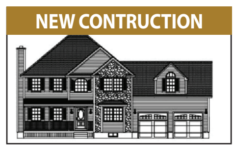
85 Winthrop Street Medway, MA $699,900