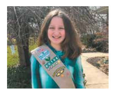
Girl Scout receives life-saving award Page 7