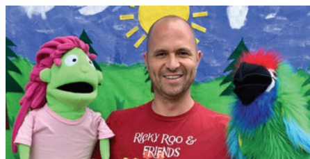
Ricky Roo & Friends

SALMON HEALTH & RETIREMENT THE WILLOWS | WHITNEY PLACE