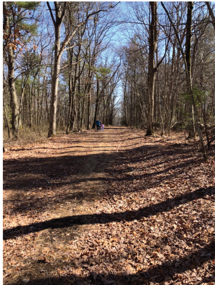
The development proposed at the end of Overdale Parkway would include paving what is now an unpaved path (a portion shown here) that leads to the entrance to the Parklands and is delineated by a sign and metal gate installed by the Park Commission decades ago.

– "A highway cannot be laid out or constructed over a park dedicated to the use of the public, except in the way provided by statute...This has not been done and the road is not a highway but still a part of the park...It would also seem to me desirable to have these streets entirely in control of the park commissioners, so that they could be closed, temporarily or permanently, and their use be subjected to such regulations as may be advantageous in the use of the park.