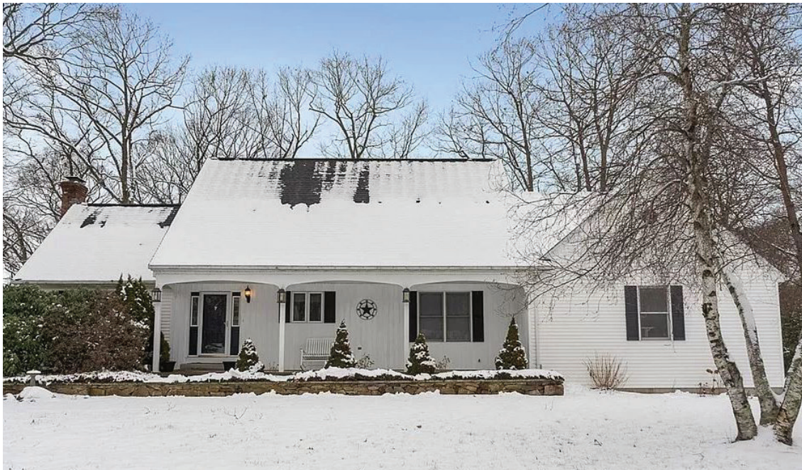
6 Oak View Lane in Hopedale recently sold for $591,426