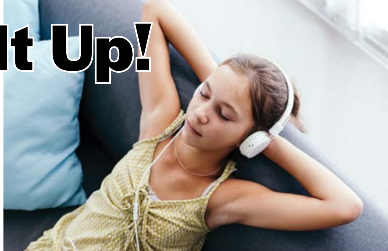
It is important that your children have down time to relax.

Notice moods. Kids should be reasonably happy to get out of bed each morning and go to school. If your child does not have at least one or two activities to look forward each week, address this together. The beginning of the school year, the change in season or after the holiday break are good times to get involved in new activities. Having fun, interactive activities to look forward to can significantly improve a child's mood. Getting enough sleep and eating three healthy meals plus snacks are also critical for maintaining a cheerful attitude and good health.