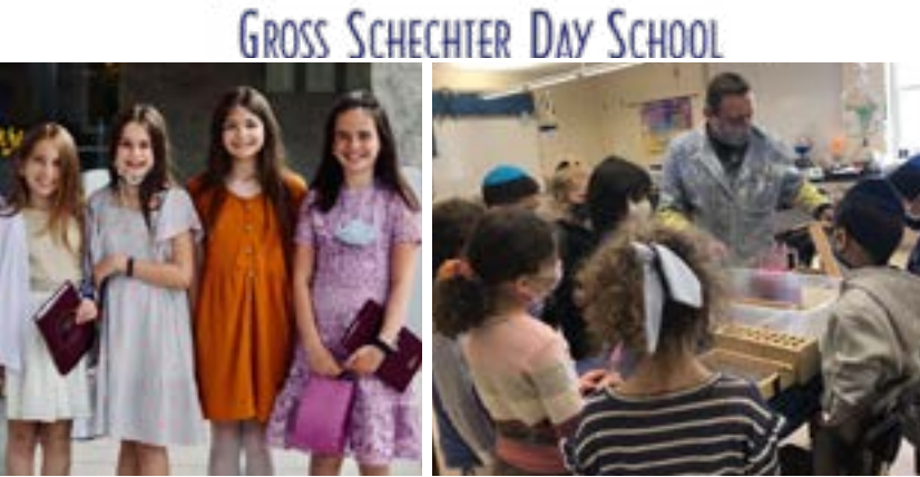
Success illuminated by tradition, ignited by innovation.