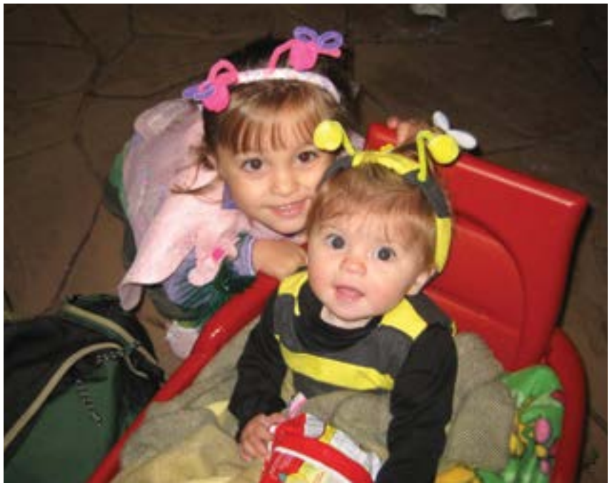
The Turner girls at two-and-a-half and seven months.

"When a child hits a child, we call it aggression. When a child hits an adult, we call it hostility. When an adult hits an adult, we call it assault. When an adult hits a child, we call it discipline." —Haim G. Ginott