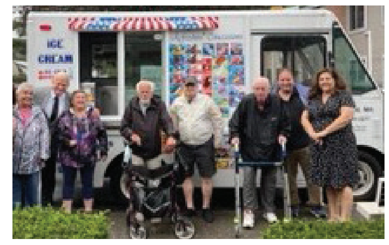
The Ashland Housing Authority board hosts ice cream treats for its residents before its September board meeting.

The Ashland Housing Authority is a Massachusetts, stateaided public housing agency that provides housing for low income elderly and persons with disabilities. Its mission is to work with community, state, and local officials to provide decent, safe, and affordable housing, with dignity and respect, for the people of Ashland.