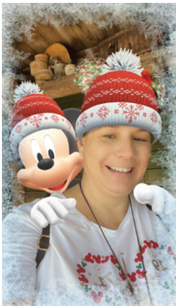
One of the photo filters included with Genie+ at Walt Disney World

new "Star Wars Hotel" is a revolutionary new experience described as " part live immersive theater, part themed environment, part culinary extravaganza, part real-life role-playing game ". Included in the cost of this experience is a 2-night stay in a well-appointed cabin or suite, meals, valet parking and entry to Disney's Hollywood Studios for your planetary excursion to Batuu. This would be a great add-on to a Walt Disney World stay OR a vacation all in itself! Guardians of the Galaxy: Cosmic Rewind - This thrilling new family-friendly coaster is scheduled to open in the summer of 2022 in Walt Disney World's Epcot and will be one of the longest, fully enclosed coasters in the world. Though currently still under construction, this ride was originally slated to open in 2021, but was delayed due to the pandemic.