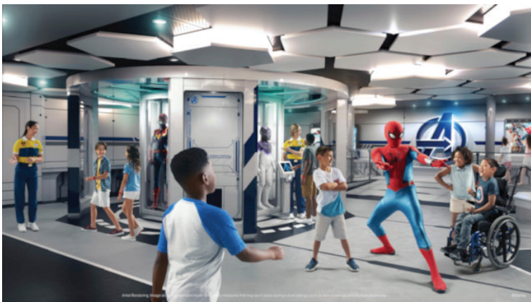
Marvel Super Hero Academy aboard The Wish (artists rendering)

The Wish will be taking its inaugural sailing in June of 2022! The newest Disney Cruise Line ship will offer all the same innovative experiences you expect from Disney - including a Frozen-themed theatrical dining experience, a kids club area that will allow your superheros to train alongside some of their favorite Marvel characters, and the Aquamouse - the first ever Disney attraction at sea! The Wish is available to book through May of 2023!