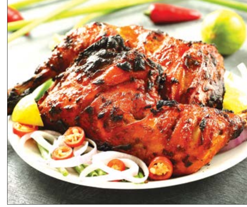
Tandoori chicken is a popular food in India.

The food of India varies somewhat by region, but there are several Indian dishes kids love. Curd rice, a