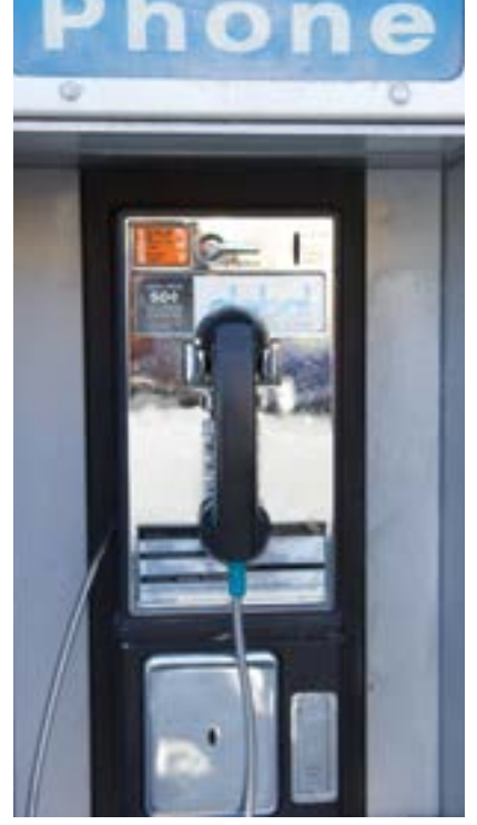
Most kids today probably have never even seen an actual payphone!

My Teen Now: Everyone in the house has their own phone line and can easily make unlimited phone calls (or Facetime) anywhere in the USA without paying additional fees. Although she hardly ever makes "real" phone calls—she mostly uses text messages or social media. I doubt she has ever heard a "busy signal" or understands how great it was when "call waiting" was introduced (she probably doesn't even know what that is either).