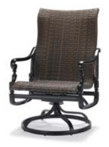
Carlisle Woven Swivel Rocker Lounge Chairs, Set of Two

Every item in their outdoor collection, from furniture and accessories to pool floats, is designed with you in mind – your style, your comfort, your family – and made to last year after year.