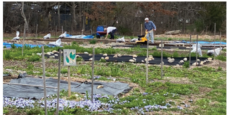
The Bellingham Community Garden, which will be the site of a number of Garden Club programs this year, recently got a donation of mulch from Scally's Tree Service.