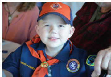
Bellingham Cub Scouts held their Blue & Gold Ceremony on April 8th.

across the bridge of their nose, symbolizing the 3 “steps” they have taken to earn this rank – learning the promise, the law of the pack and the motto. Those who are moving up to Wolf rank are marked with two brown inverted V shapes above their eyebrows, signifying the “ears” of the wolf and expressing eagerness to listen.