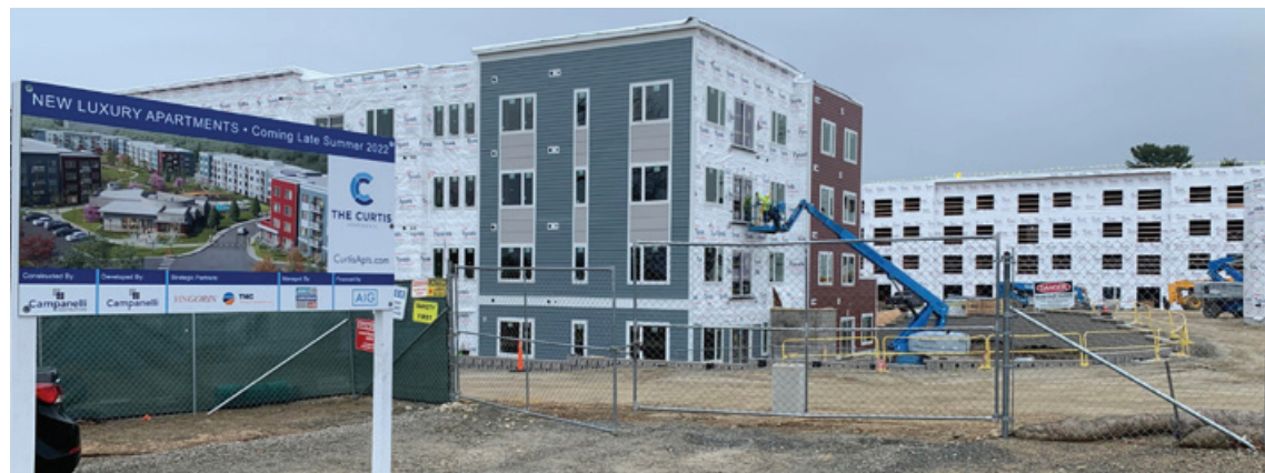
Construction continues on The Curtis Apartments in Bellingham. The 250-unit complex is expected to open in the fall.

“The Reader’s Digest version,” explains David Cashman of SEB Housing, “is that all (applying) households who are eligible for the lottery will be included