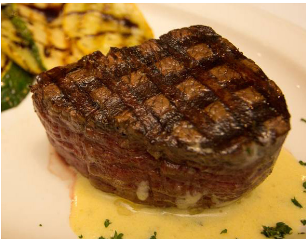
A varied menu has been a staple at Chuck's Steak House in Auburn for more than forty years.

Chuck's, by the way, celebrated a 44th anniversary on Mother's Day.