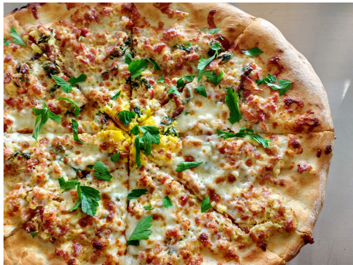
Pizza is just one of the favorites with diners at UXLocale in Uxbridge.

The dining room has been relieved of all the (Covid) extras. I built some new narrow tables that allow space and symmetry. We host Wise Guys Trivia on Wednesday nights. Live music is back