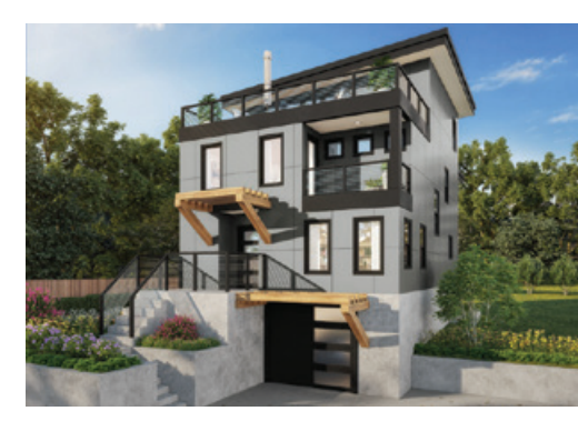
4 Spring Street, Natick