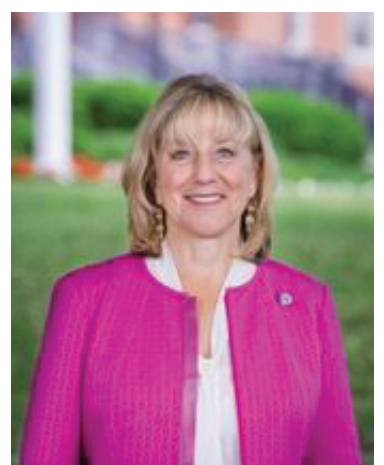
State Senator Karen Spilka

Amid alarming reports by the Intergovernmental Panel on Climate Change, the Massachusetts Senate passed a major bill, S.2819, An Act Driving Climate Policy Forward, or the Drive Act. The bill addresses climate change in three primary areas—clean energy, transportation, and buildings—with the aim of achieving the Commonwealth's ambitious goal of reaching net-zero emissions by 2050, which the Legislature codified into law in 2021.