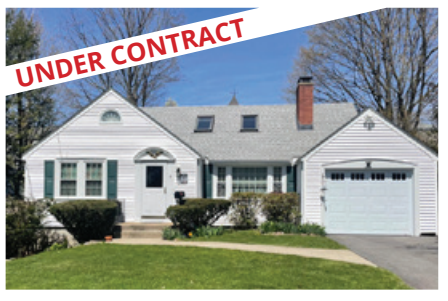
9 TUCKER ST, NATICK