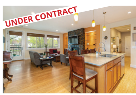
20 SOUTH AVE UNIT 202, NATICK