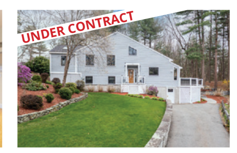
72 OAKLAND ST EXT, NATICK