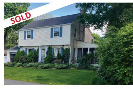
18 GREENWOOD RD, NATICK