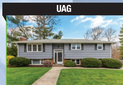
33 FIELDBROOK DRIVE