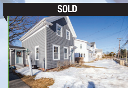
195 PROSPECT ST.