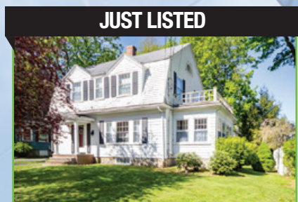
5 MARION AVE.

May your day be touched with a bit of Irish Luck brightened by a song in your heart and warmed with smiles by the people you love. Congratulations 2022 graduates!