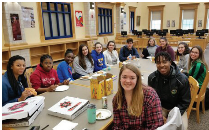
Weekly Youth Ambassador Meeting in 2018