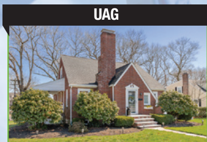
220 NICHOLS ST.