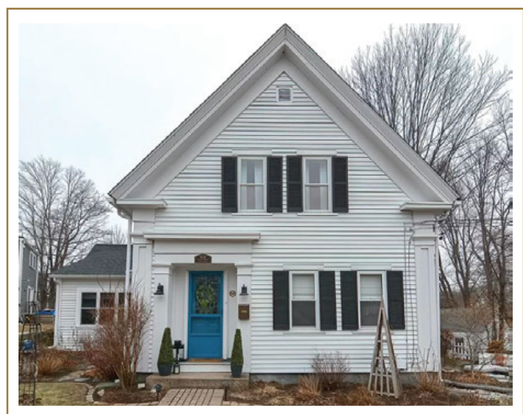
64 Railroad Street in Holliston recently sold for $640,000