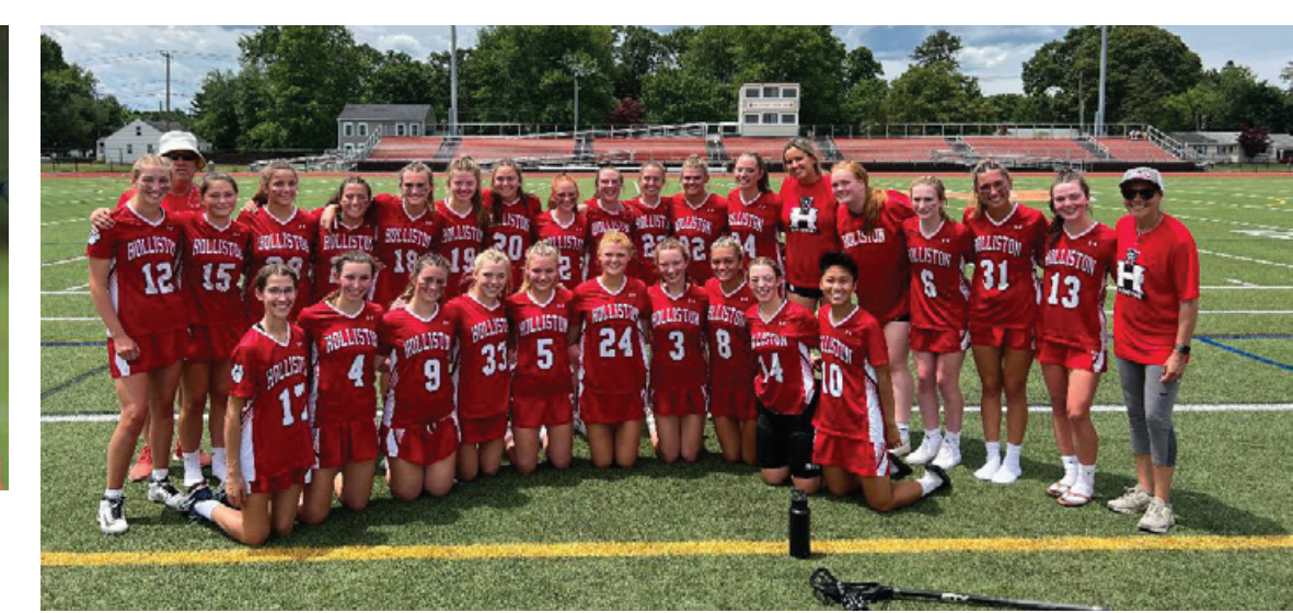
The Holliston High girls lacrosse team finished its 2022 season with a 15-6 record that put them into the quarterfinal round of the state tourney.