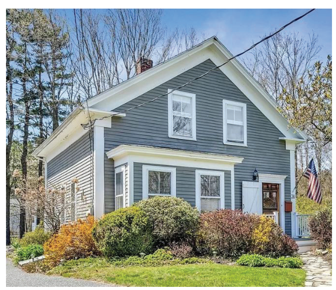
38 Baker Street in Holliston recently sold for $805,000.