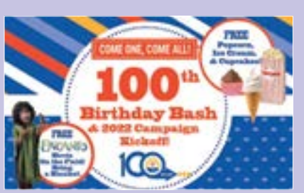
United Way of Lake County 100th birthday bash