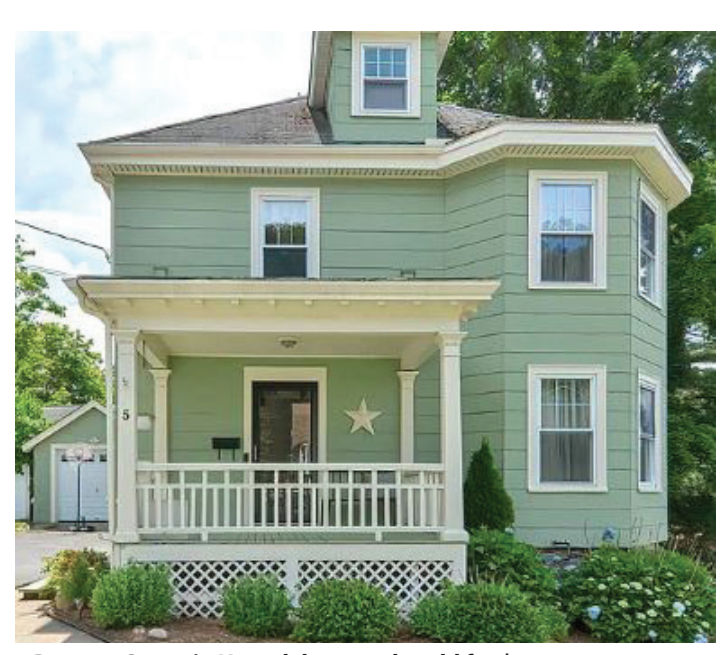
5 Dennett Street in Hopedale recently sold for $421,000