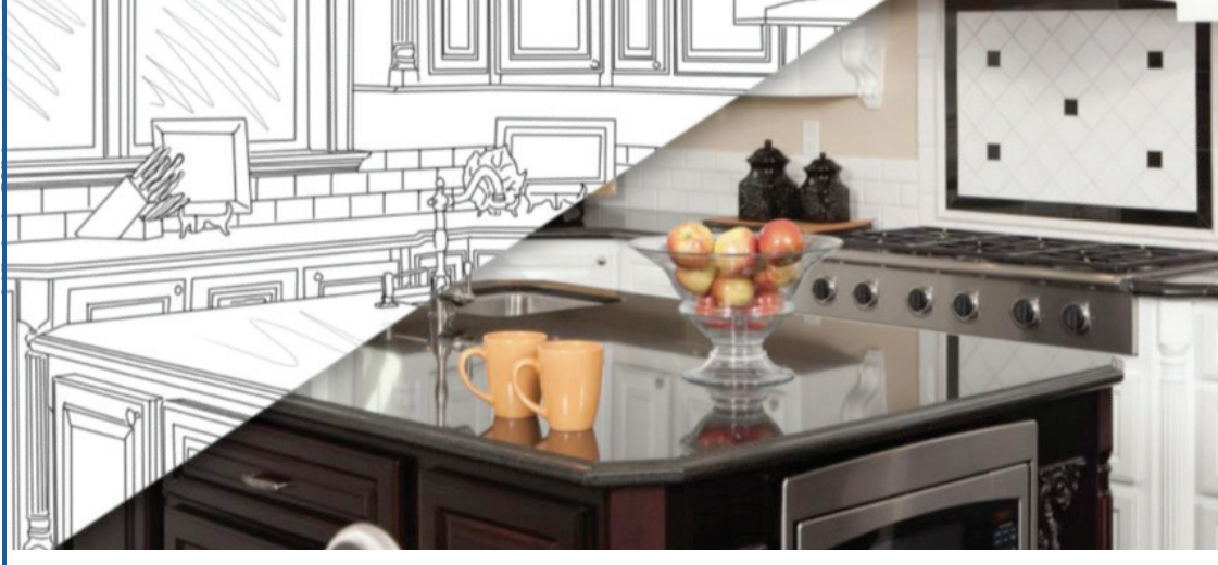
Creating functional and stylish spaces since 2014