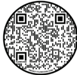
scan for more info

Finish your holiday shopping early and from the comfort of your own home! And grab a gift for yourself with our Buy 3 Get 1 FREE offer! It only happens once a year!