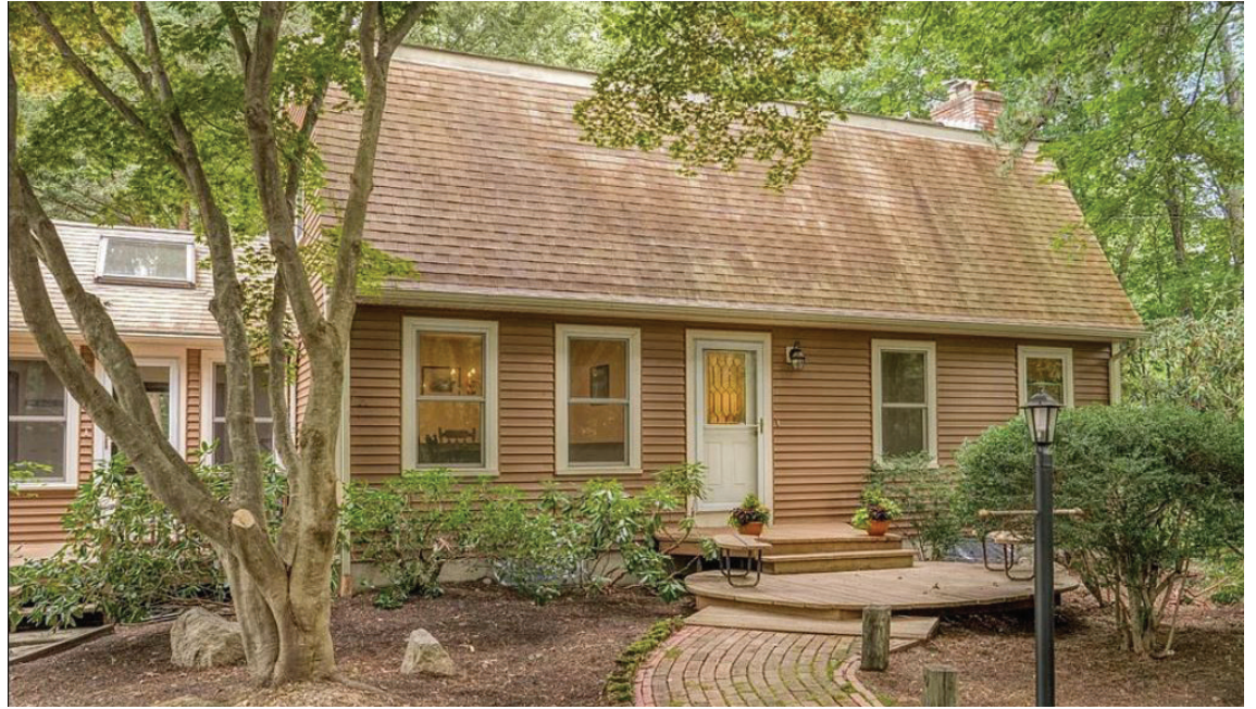
85 Howe Street in Ashland recently sold for $690,000. Source: www.zillow.com / Compiled by Local Town Pages