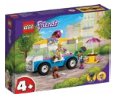
LEGO® Friends Ice Cream Truck

Visit Lego.com to discover a world of endless build opportunities.