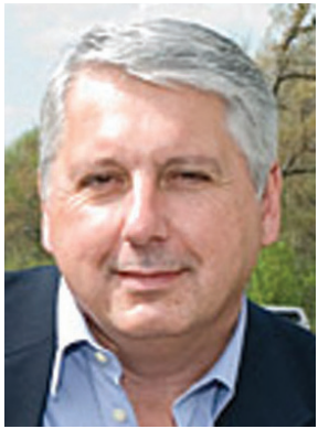
BY JOHN PAUL

Q. I'm trying to replace a damaged steering column in a 1987 Chevy El Camino. I got one from a 1986 Chevy El Camino but where the transmission linkage hooks up to the column is in a different position on the 1986 than the one from the 1987. Would you know if they are compatible with each other?