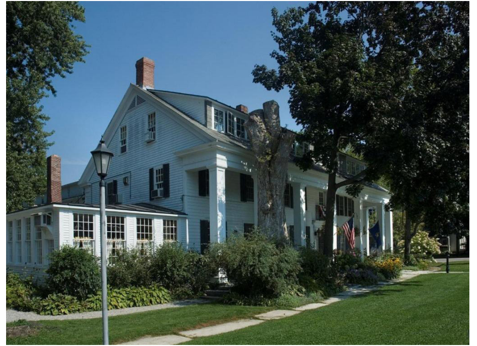
The Dorset Inn in Vermont, where guests and staff alike have seen "The General."

tigation was quiet, but it appears they may have contacted the child's spirit that sometimes accompanies the ghost of The General, or perhaps it is altogether another spirit. With a place that is over 225 years old, it can be assured there is a lot of energy lingering within. But, do not worry, all of