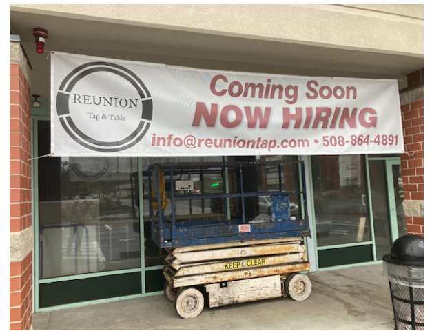
The storefront in the Whitinsville Plaza formerly occupied by Jube's will be home to Reunion Tap & Table.

Reunion Tap & Table's mantra is "familiar food