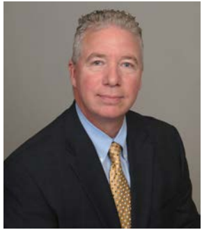
BY DENNIS ANTONOPOULOS

It's unfortunate, but recessions are a fairly normal part of the economic landscape. When a recession occurs, how might you be affected? The answer depends on your individual situation, but regardless of your circumstances, you might want to consider the items in this recession survival checklist: