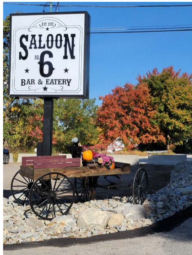
Opened recently, Saloon 6 Bar & Eatery with its Old West theme is already making a big hit in Webster.